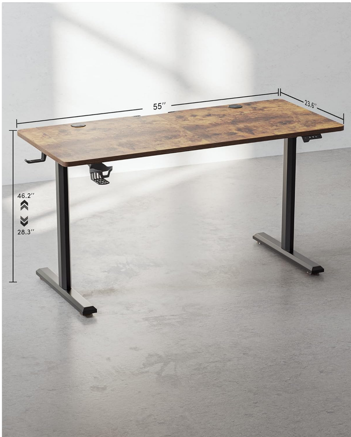
Figure 2: Diagram illustrating the dimensions of the BANTI electric standing desk. The desktop measures 55 inches wide by 23.6 inches deep. The adjustable height range is from 28.3 inches to 46.2 inches.

For a visual guide, refer to the assembly video (if available from the manufacturer) or the detailed instructions provided in your package.