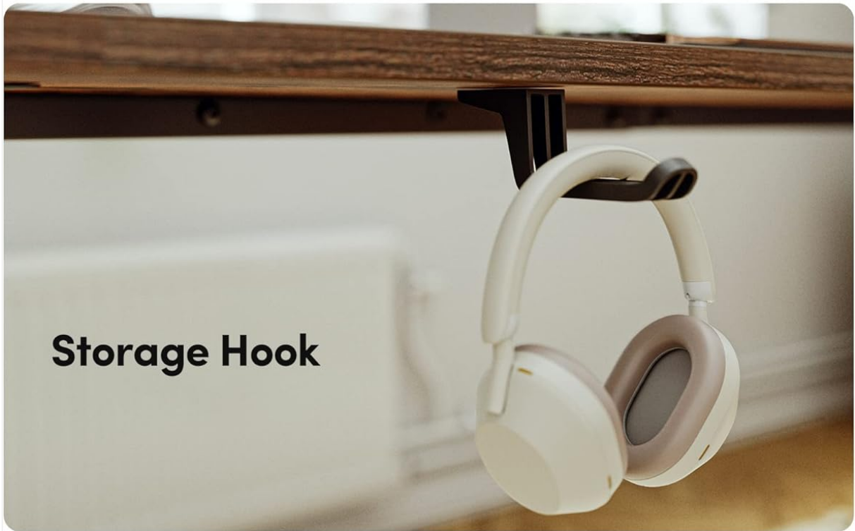
Figure 4: Demonstrates the included cup holder and storage hook. The cup holder securely holds a cup, and the storage hook is shown holding a pair of headphones, keeping the desktop clear.