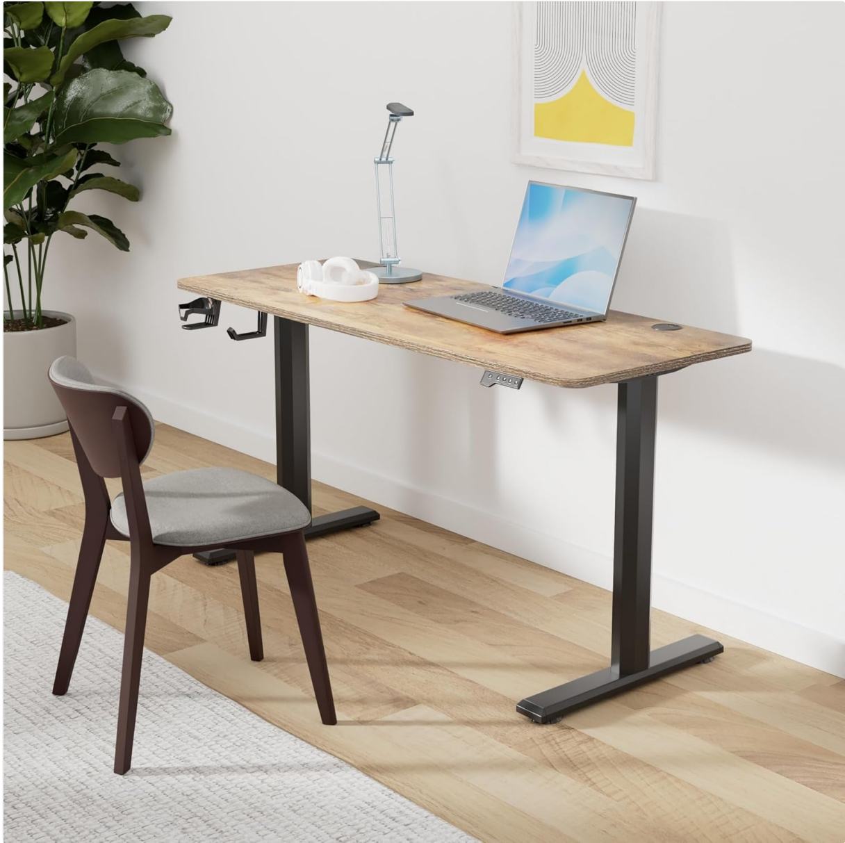
Figure 1: Fully assembled BANTI 55x24 inch electric standing desk. The desk features a rustic brown top and black frame, with a laptop, lamp, and headphones visible on the surface. A chair is positioned to the left.

Assembly Tip: The assembly steps have been optimized for user convenience. All parts are clearly labeled, and the package contains assembly tools and detailed instructions. Ensure all connections are secure before applying weight or operating the desk.