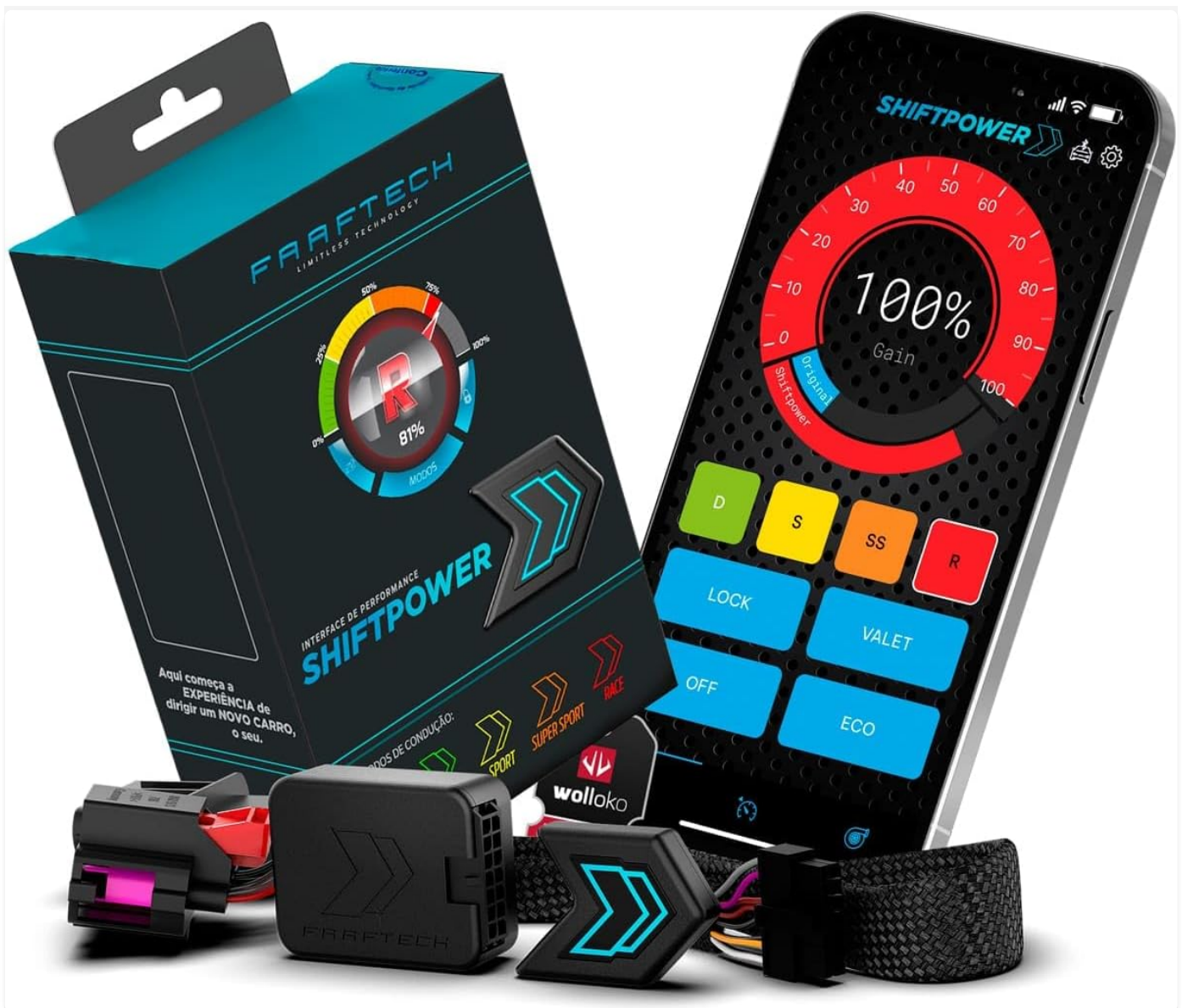
Image 1.1: Shiftpower FT-SP18+ device, packaging, and the accompanying smartphone application interface.