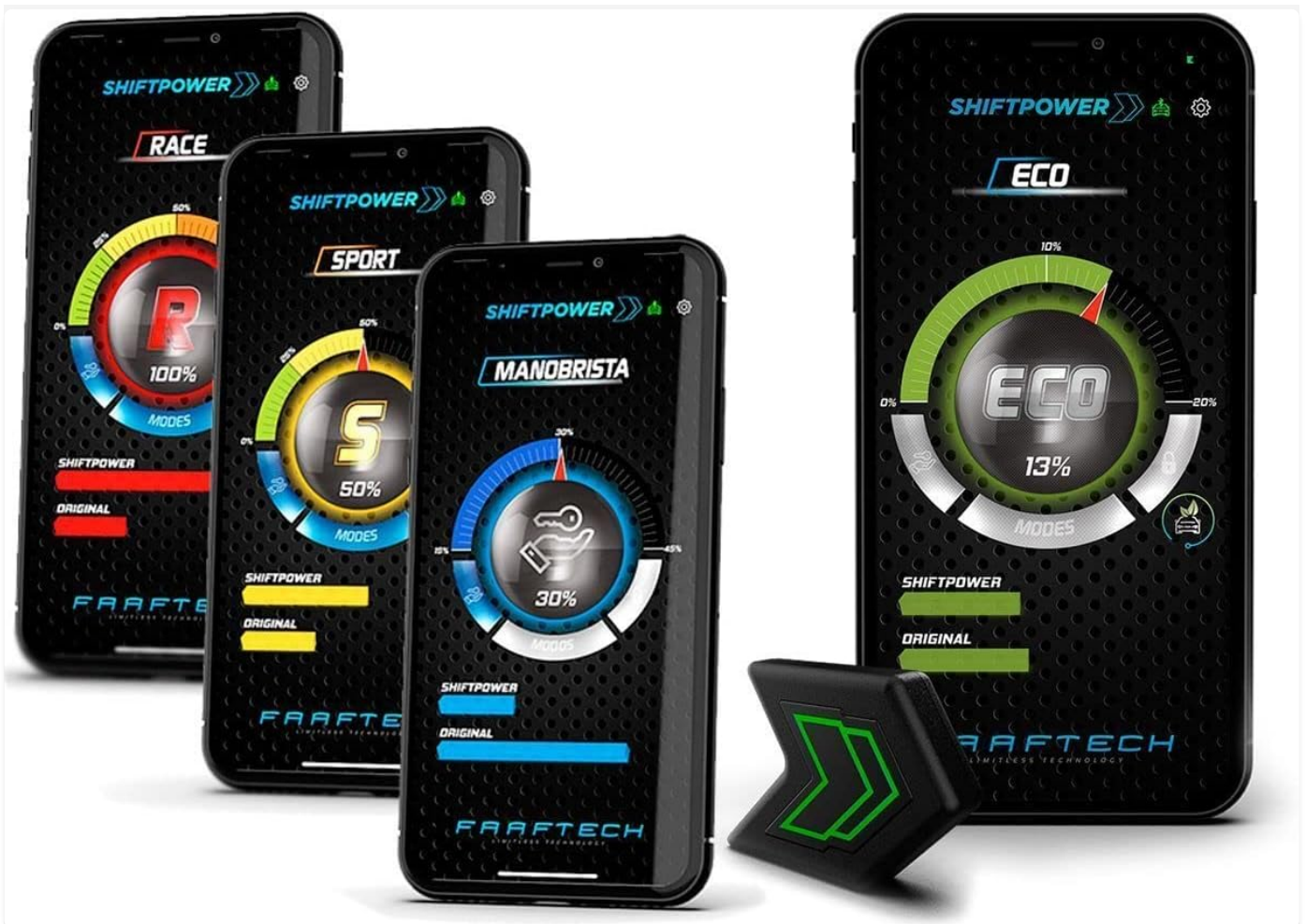
Image 5.2: Illustrates the fuel-saving benefit of Shiftpower's Eco Mode.