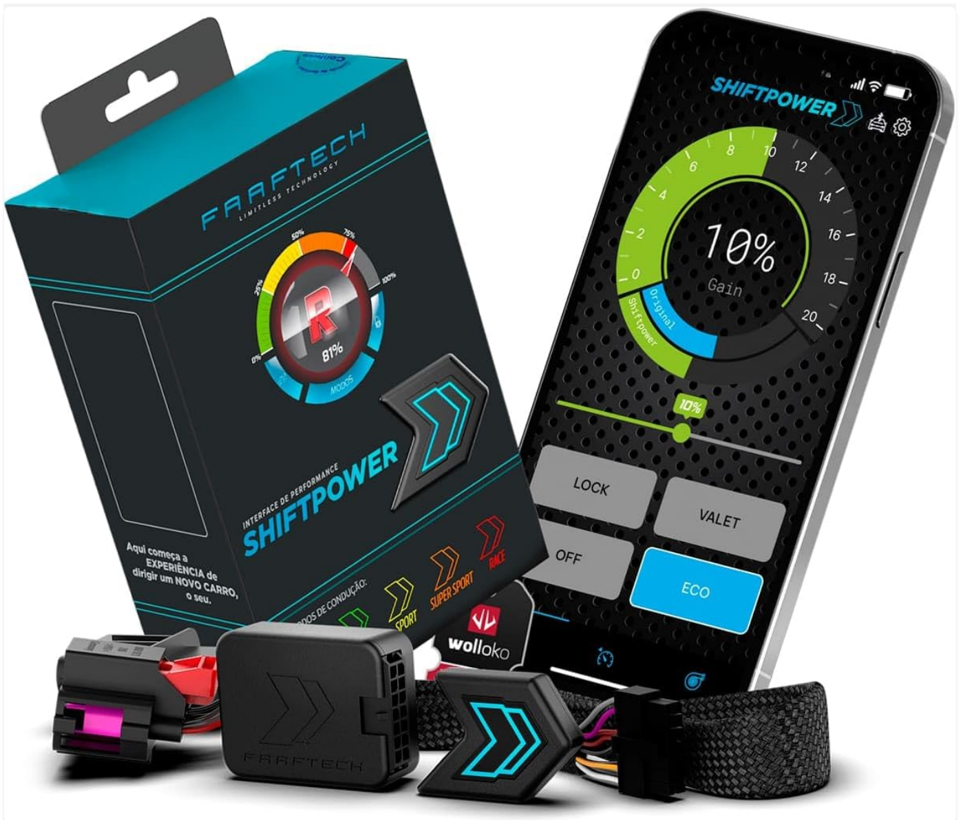
Image 4.2: Another view of the smartphone application interface, highlighting Race, Sport, Manobrista (Valet), and Eco modes.