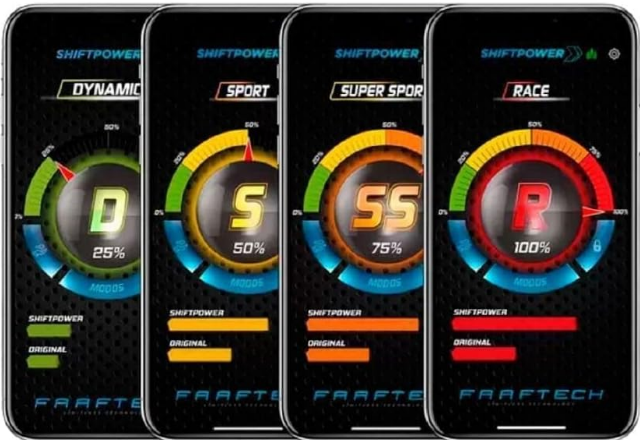
Image 3.2: Instructions to connect the Shiftpower device with the smartphone application, available on iOS and Android platforms.