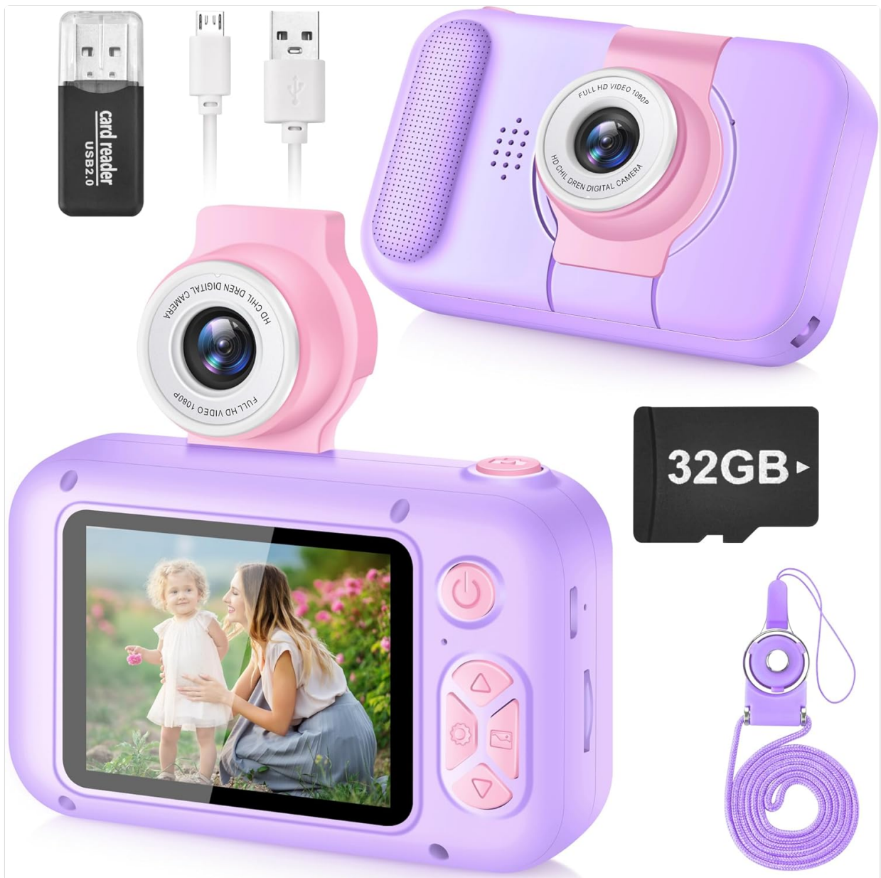
Image: A purple ARNSSIEN X101 Kids Digital Camera connected to a USB charging cable, illustrating the charging process.