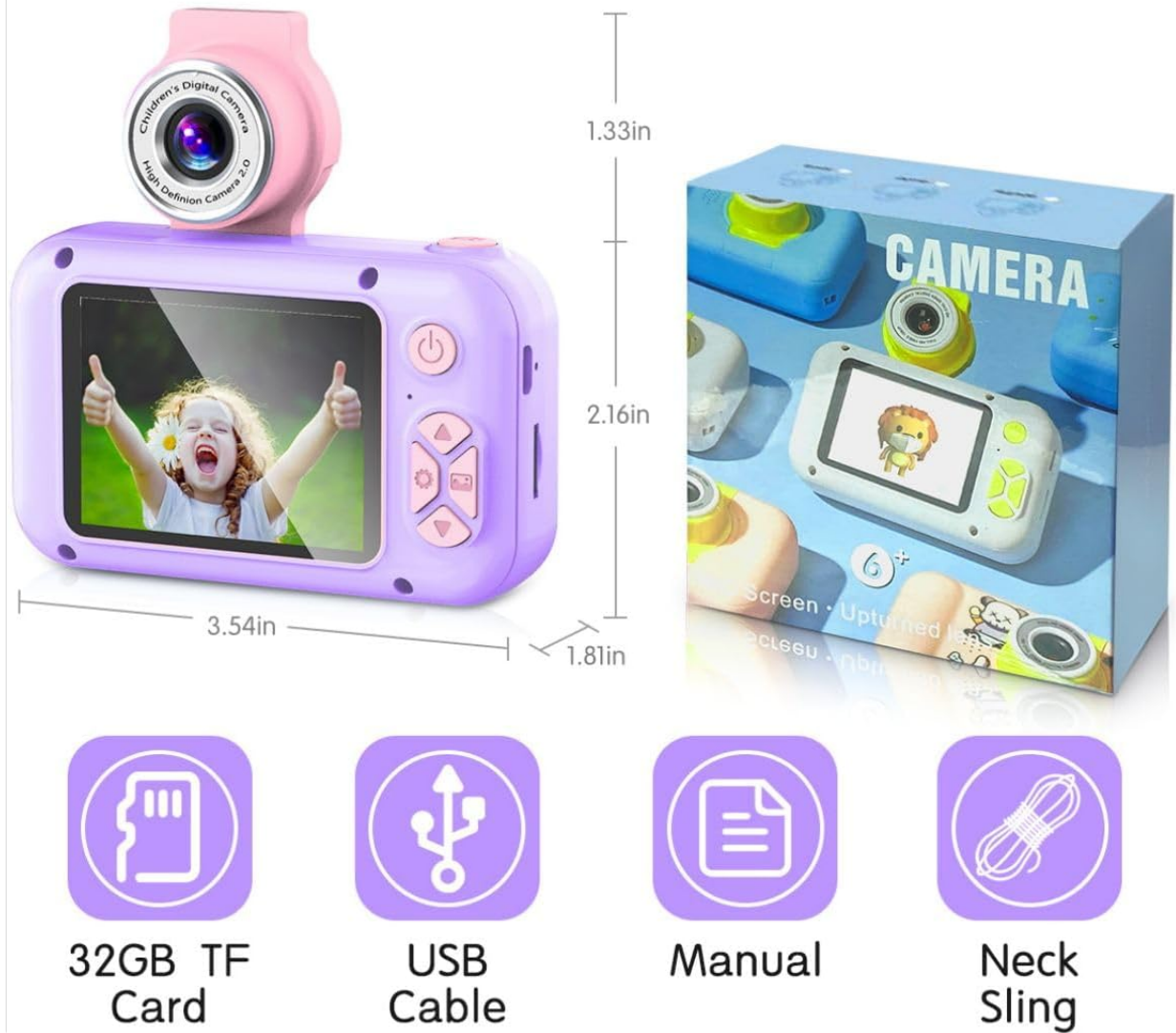
Image: The ARNSSIEN X101 Kids Digital Camera shown with its included accessories: USB charging cable, 32GB TF card, user manual, and dual-use strip.