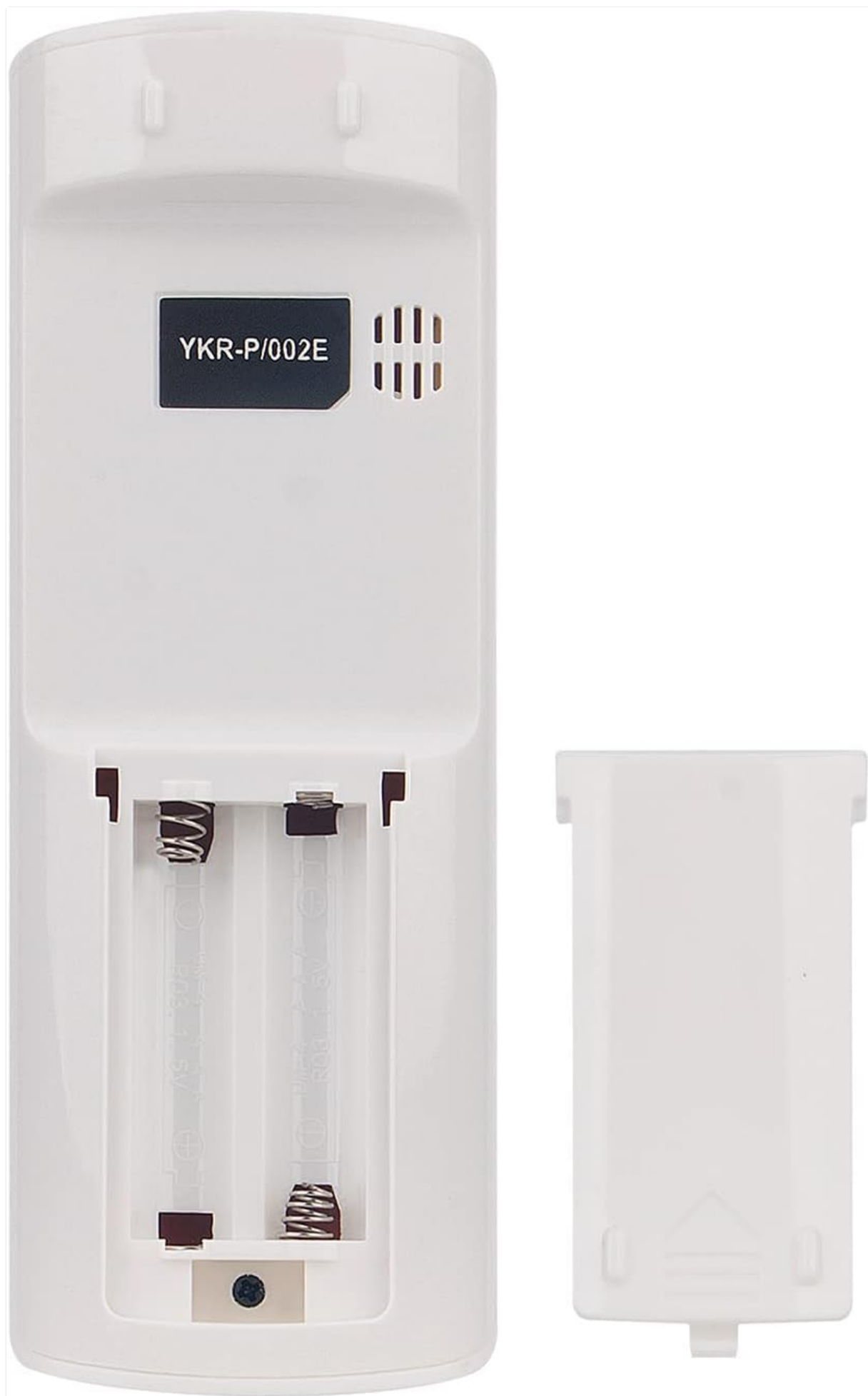
Figure 1: Rear view of the remote control with the battery cover removed, illustrating the battery insertion process. Two AAA batteries are required.