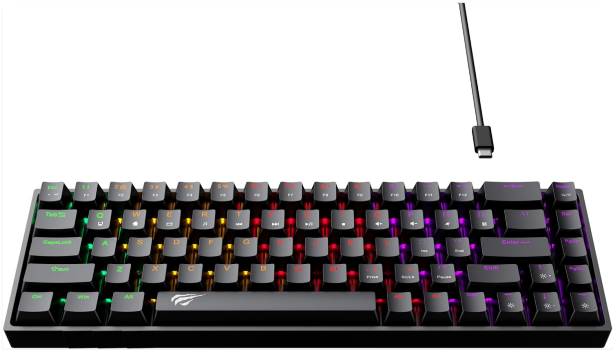
Image 3: Top-down view of the Havit KB881L keyboard showcasing its 68-key layout and RGB lighting.

function key combinations, refer to the keycaps for secondary functions, often accessed using the 'Fn' key.