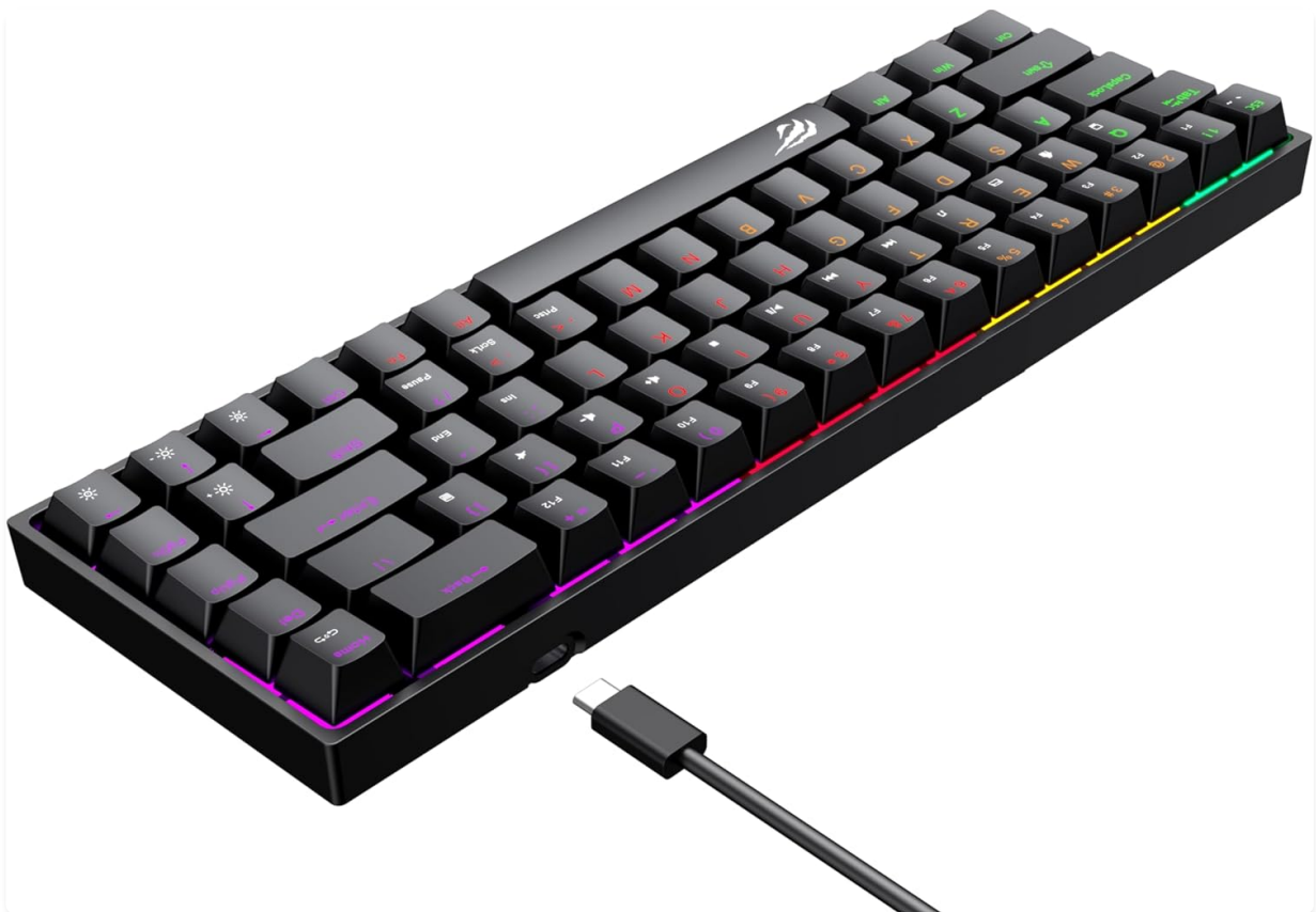
Image 2: Side view of the Havit KB881L keyboard showing the USB-C connection port.

The keyboard is plug-and-play and should be automatically recognized by your operating system (e.g., Windows 10) without requiring additional driver installation.