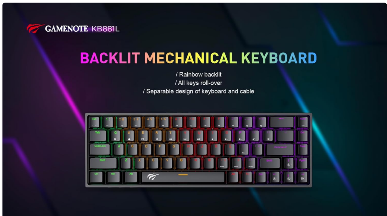
Image 1: Havit KB881L Backlit Mechanical Keyboard highlighting key features.

Thank you for choosing the Havit KB881L Gaming Series RGB Mechanical Keyboard. This manual provides essential information for setting up, operating, and maintaining your new keyboard. The KB881L is designed for both typing and dynamic gaming, featuring a compact 68-key layout, mechanical switches, and vibrant RGB backlighting.