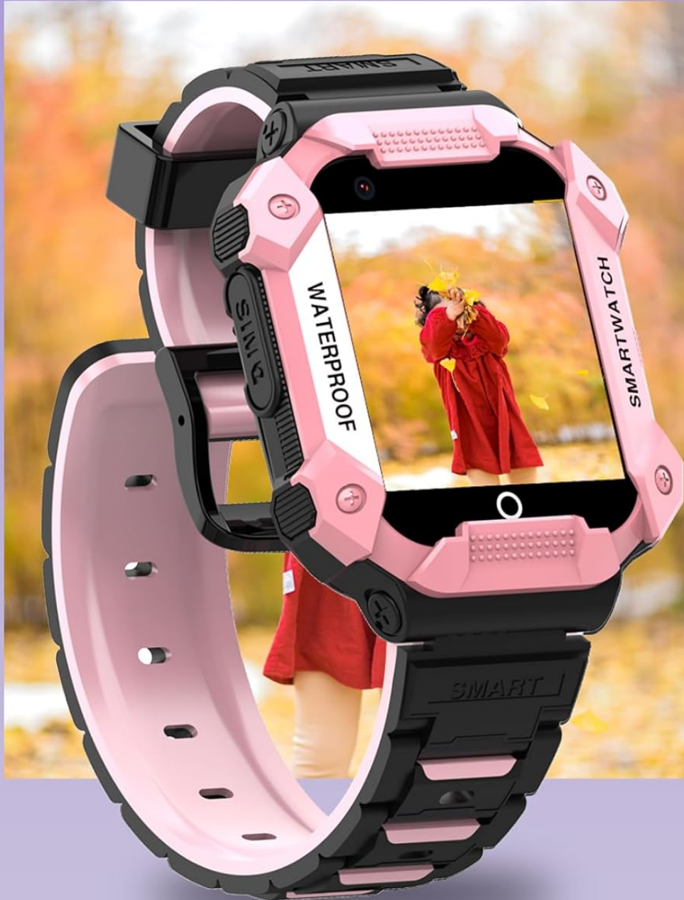
Image: The smartwatch showcasing a photo on its screen, demonstrating the functionality of its integrated HD camera.

HIGH-DEFINITION FRONT CAMERARECORD THE WONDERFUL MOMENTS OF LIFE