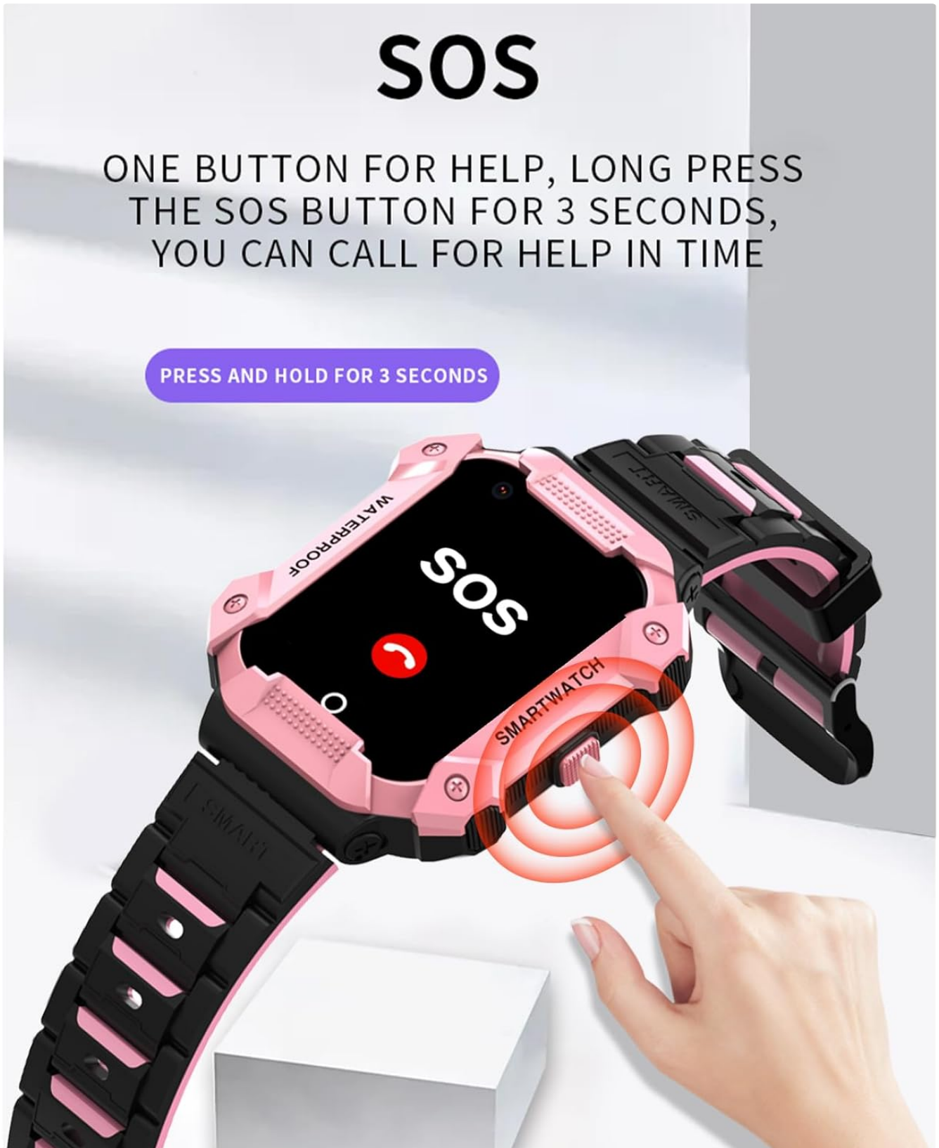
Image: A visual guide showing how to activate the SOS function by pressing and holding the dedicated button on the watch.

In an emergency, the child can press and hold the SOS button (typically located on the side of the watch) for 3 seconds. The watch will automatically dial pre-set emergency contacts in a loop until one answers, and also send location alerts to these contacts.