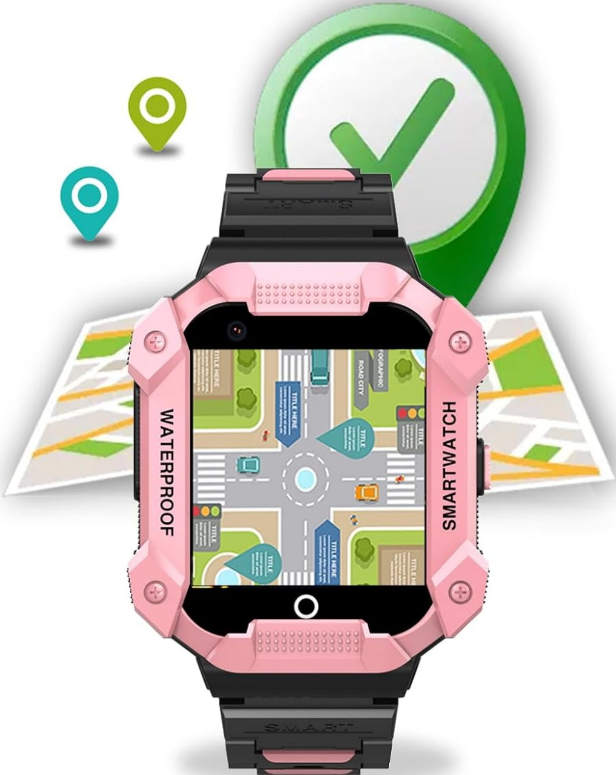
Image: The smartwatch screen showing a map with location markers, demonstrating its precise positioning feature.

GPS+WIFI+LBSPOSITIONING, OPEN THE MOBILE PHONE BACKGROUND APP, ACCURATELY LOCATE THE CHILD'S POSITION