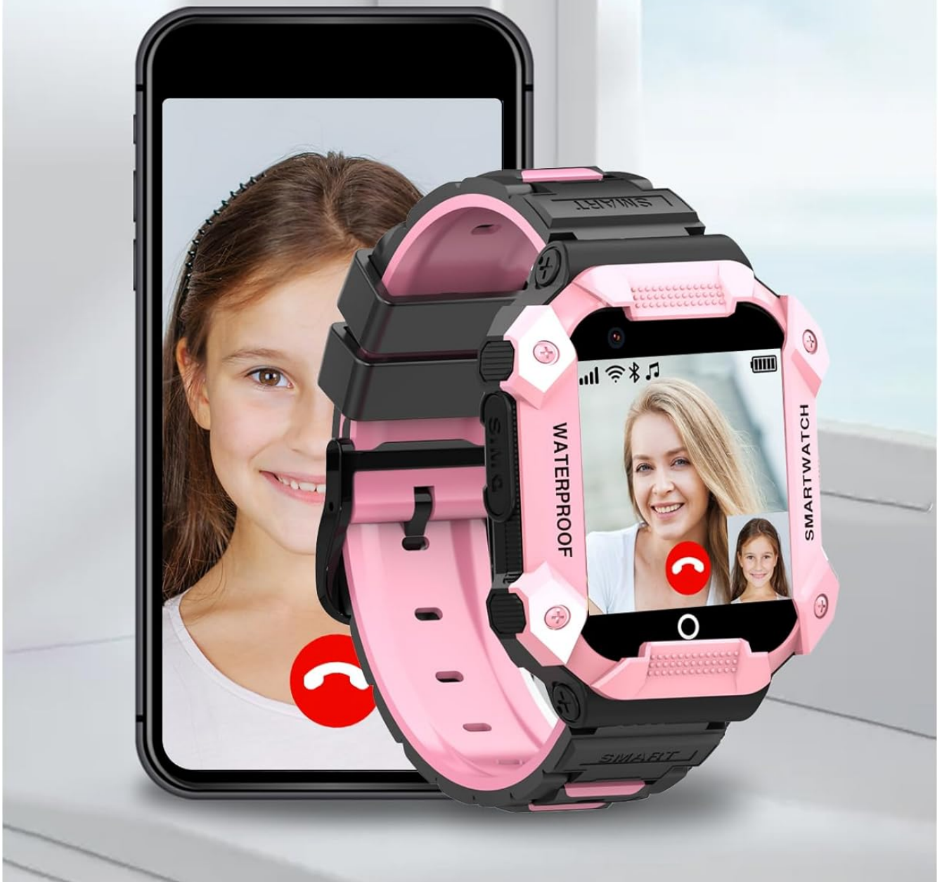
Image: The smartwatch and a smartphone demonstrating a live video call, highlighting the convenience of communication between parent and child.

Make communication between parents and children more convenient