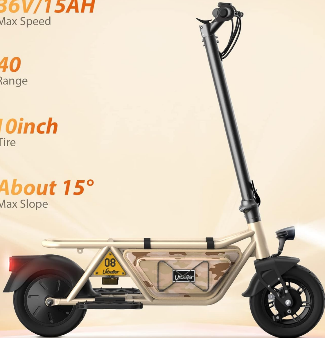
Image: Side profile of the urbetter M8 E-Scooter, illustrating its compact design and highlighting key performance specifications like range and tire size.