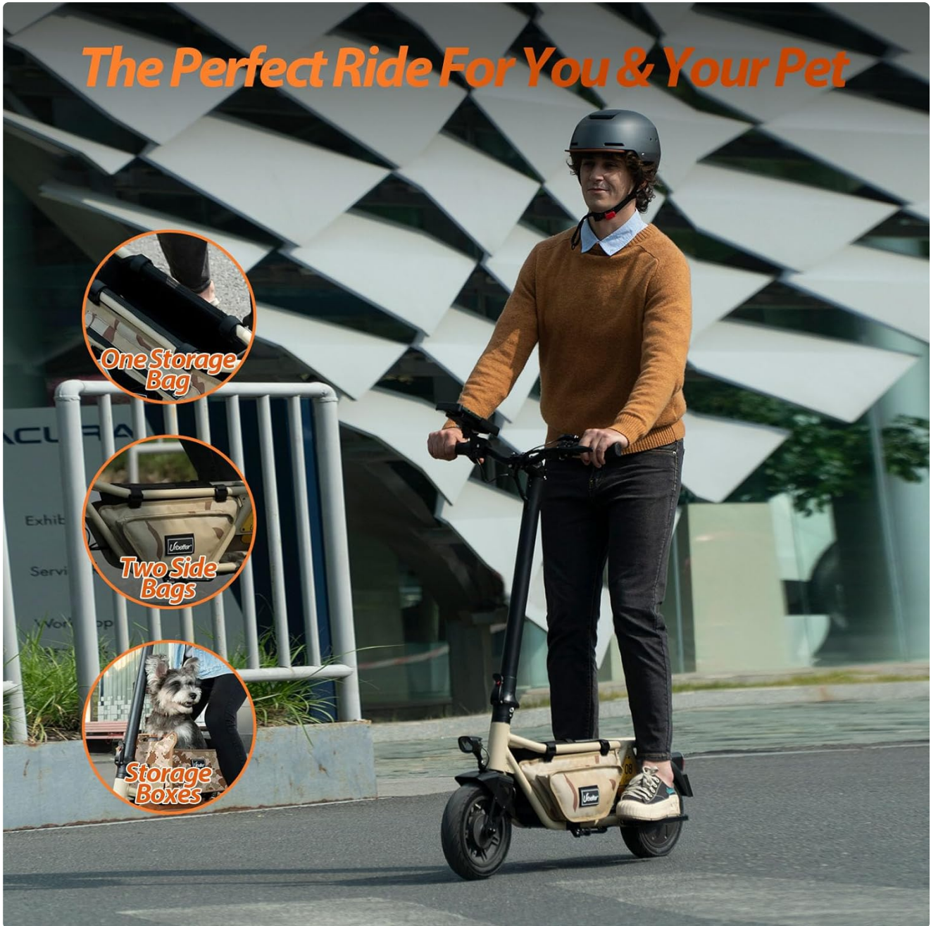
Image: The urbetter M8 E-Scooter equipped with storage bags, highlighting its versatility for carrying items or even a small pet (additional purchase required for pet carrier).