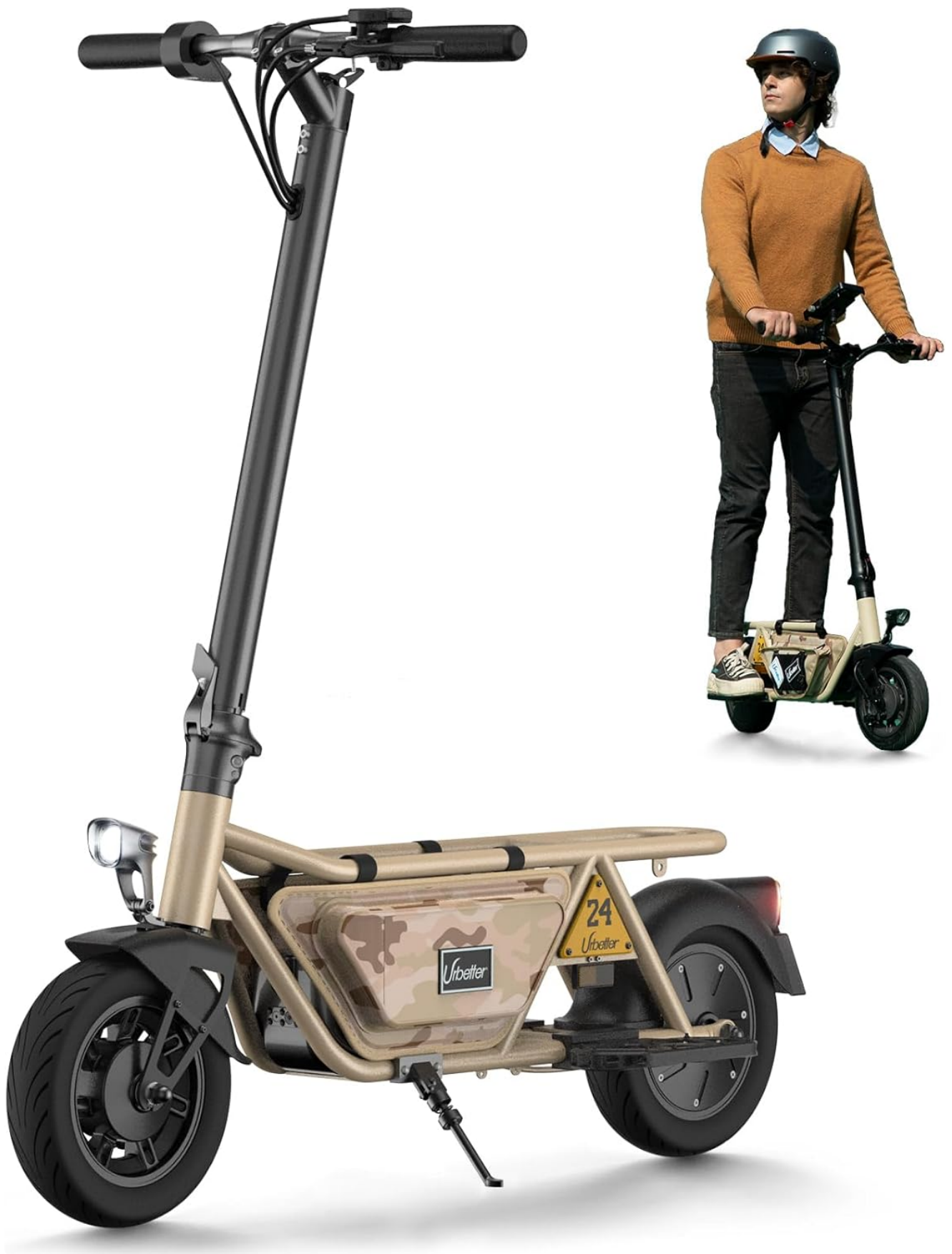
Image: The urbetter M8 E-Scooter, showcasing its design and a rider demonstrating its use.