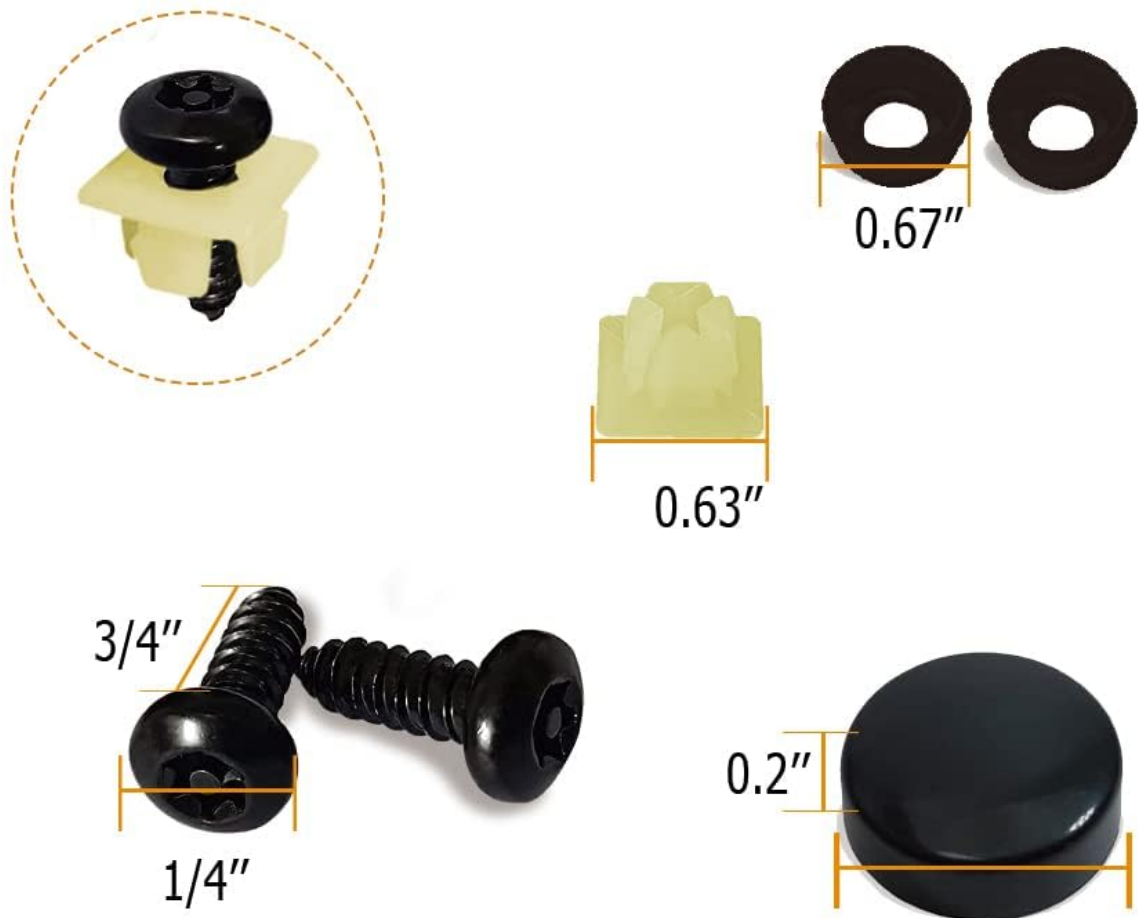
Figure 2: Product dimensions for the screws, washers, and caps.