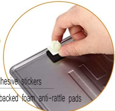
Figure 3: Applying foam anti-rattle pads to the license plate.