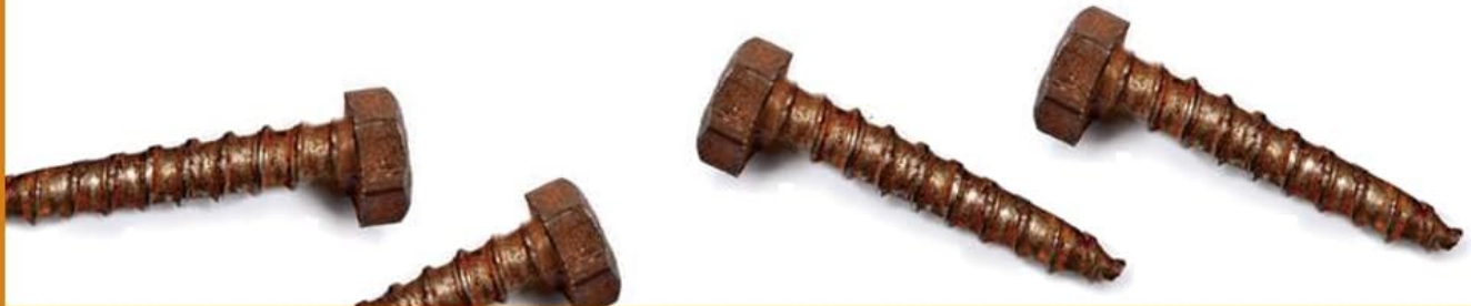
Figure 7: Rust prevention features of the stainless steel screws.