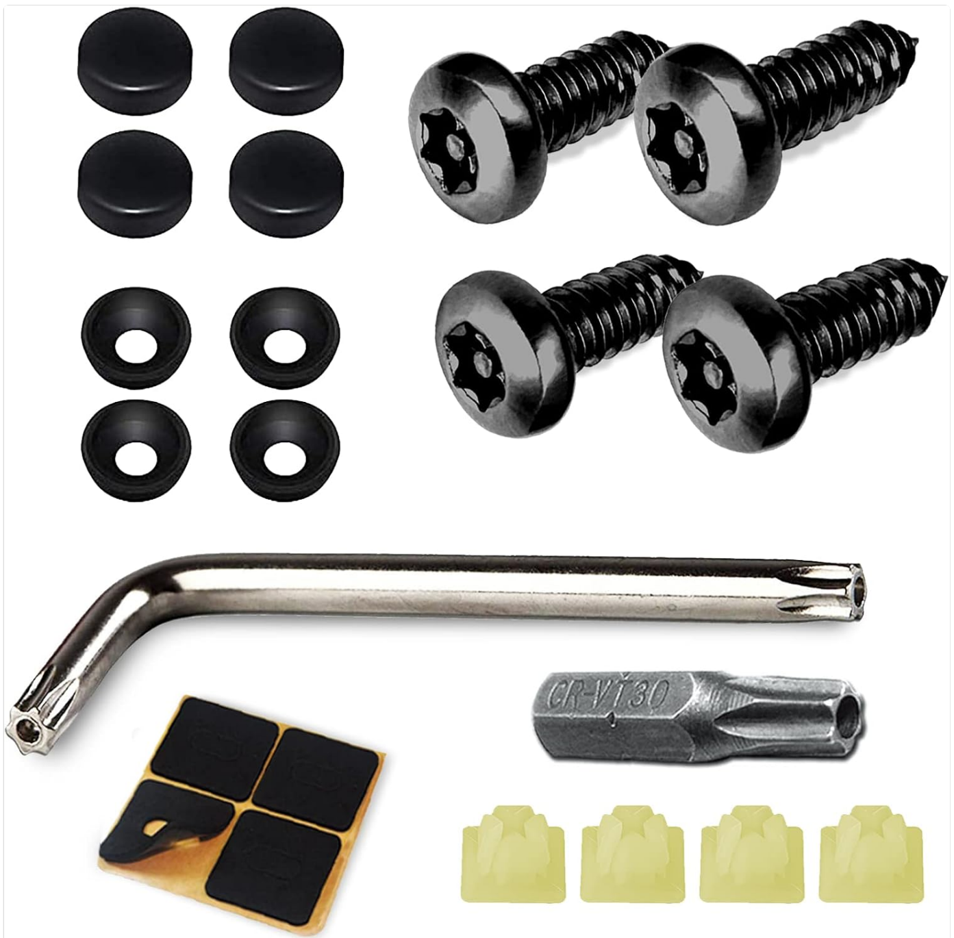
Figure 1: Complete contents of the Middrivr Black Anti-Theft License Plate Screw Kit.