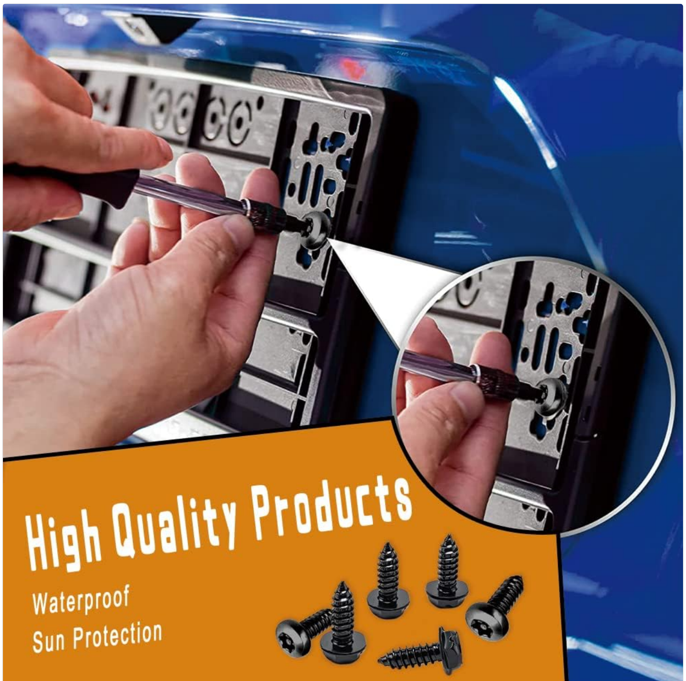
Figure 6: Overview of the anti-theft screw design and specialized tools.