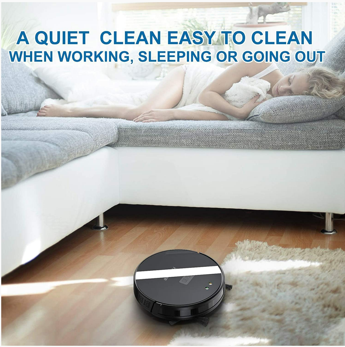
Image: The HONITURE Q5 robot vacuum performing a quiet cleaning operation on a hard floor in a home environment.