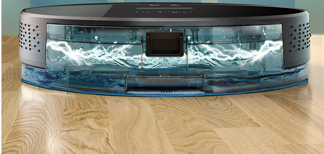
Image: An illustration of the robot's electric control water tank, detailing three adjustable water flow settings for different cleaning needs.