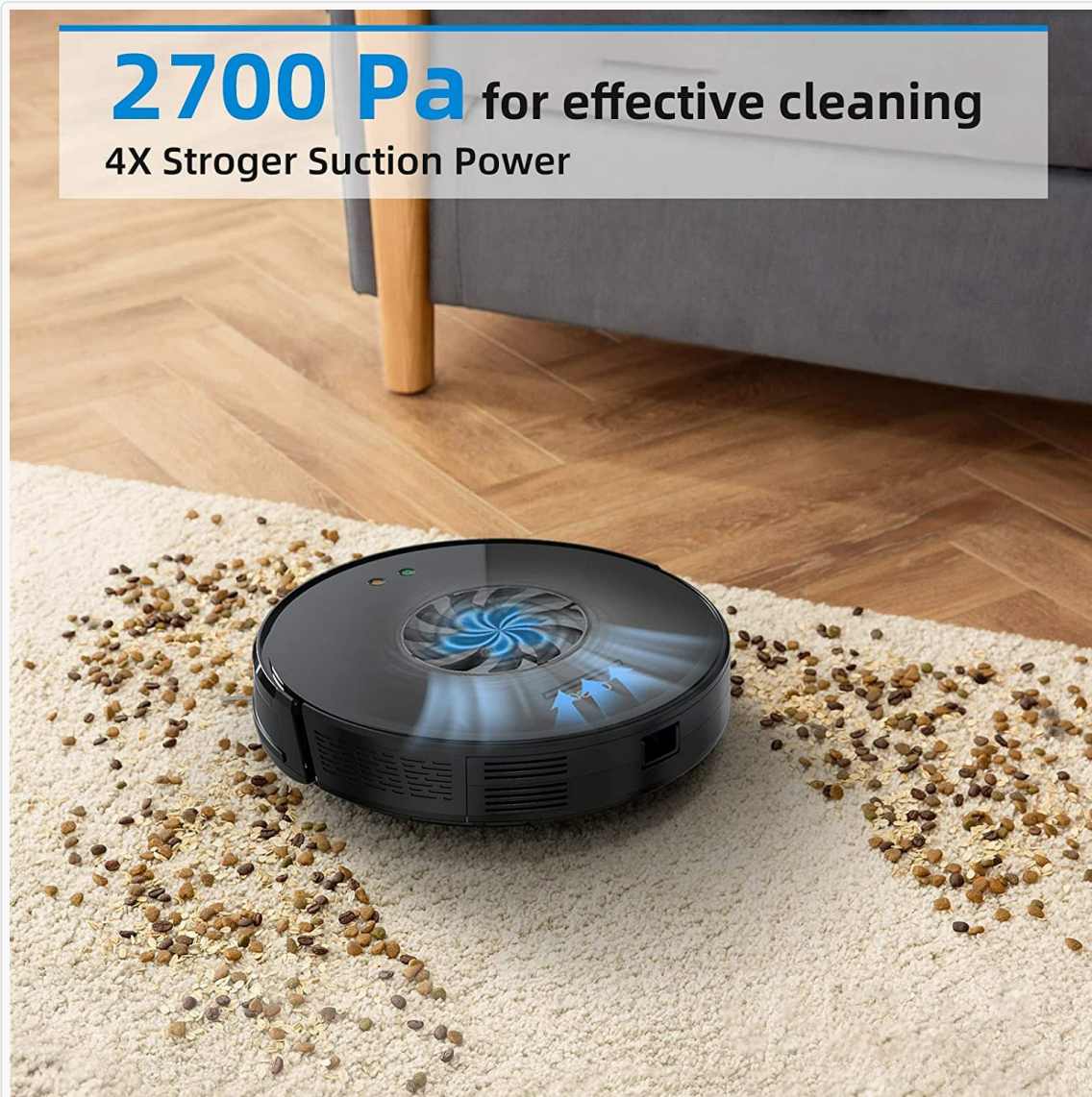
Image: The HONITURE Q5 robot vacuum operating on a carpet, illustrating its powerful suction capability for effective cleaning.