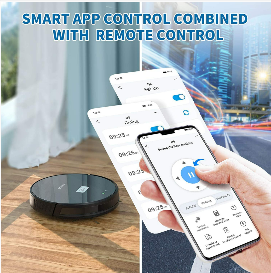
Image: The HONITURE app interface on a smartphone, demonstrating various control options for the robot vacuum, including scheduling and adjusting cleaning parameters.