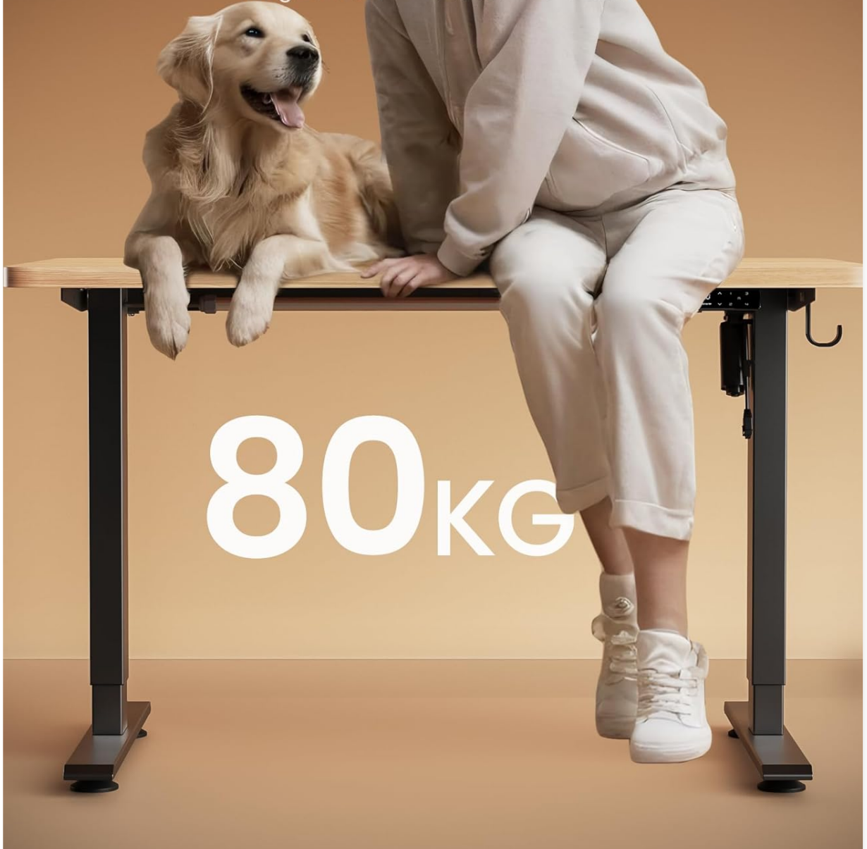
Figure 2.5: Visual representation of the desk's impressive 80kg load capacity, highlighting its sturdy design.