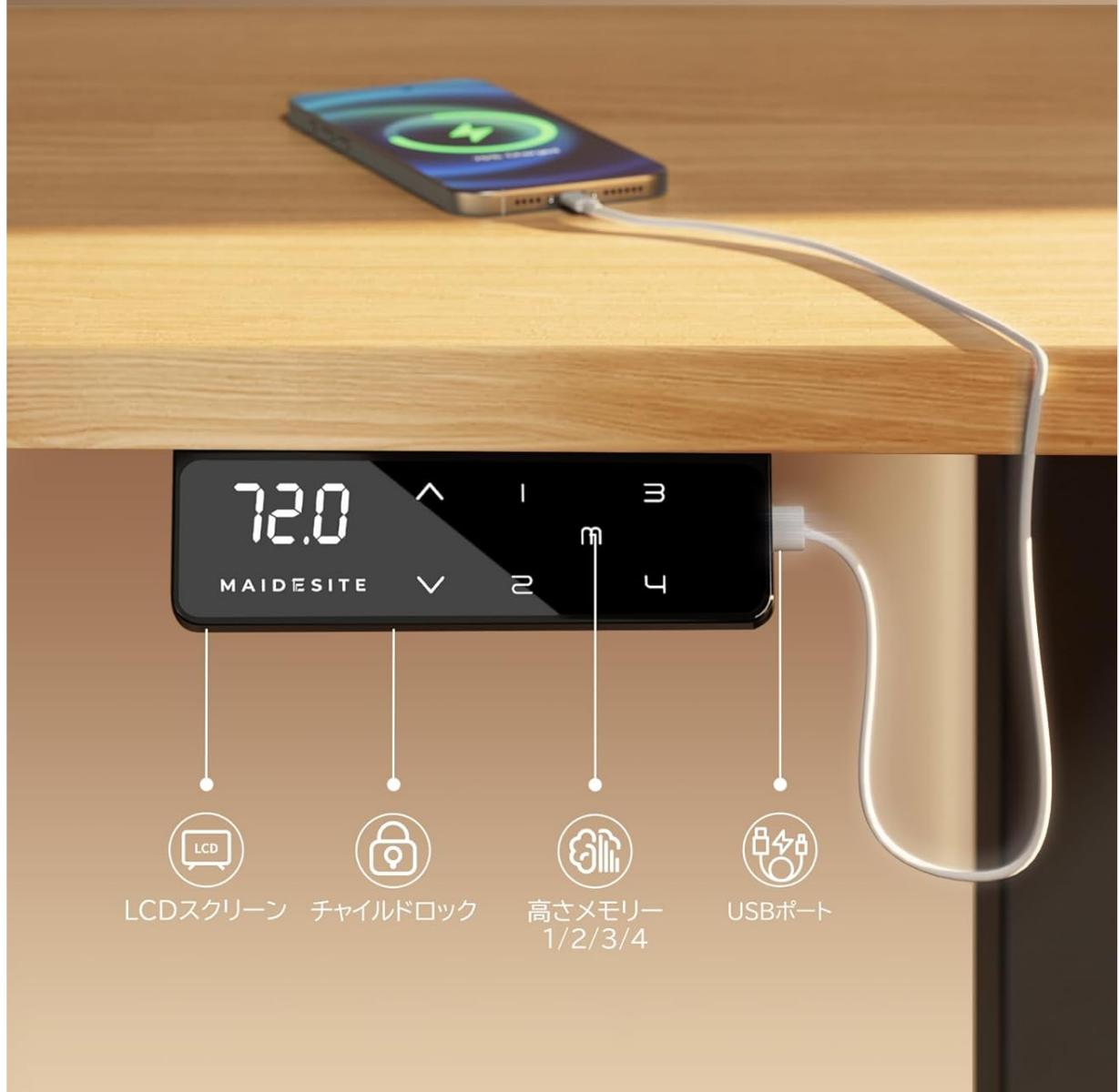
Figure 2.4: Detailed view of the control panel, showing the LCD screen, height adjustment buttons, memory presets, and USB port.