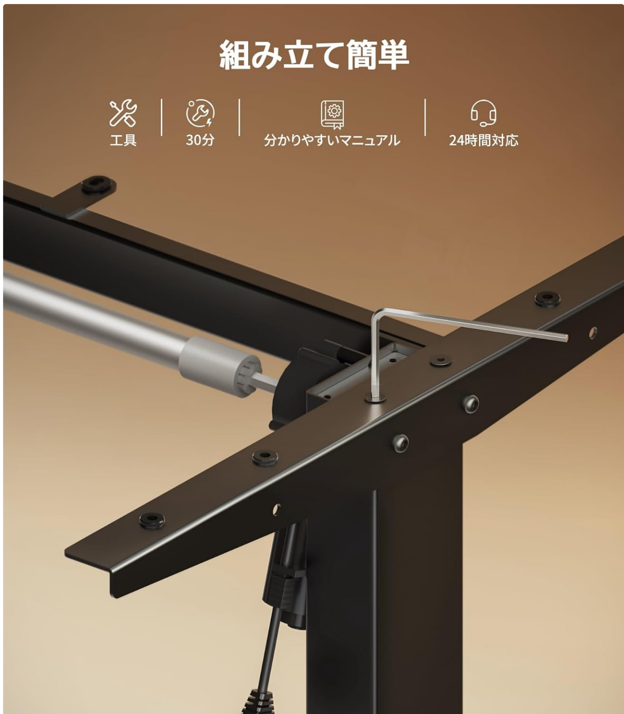
Figure 4.1: An illustration of the assembly process, showing the use of an Allen key to secure frame components.