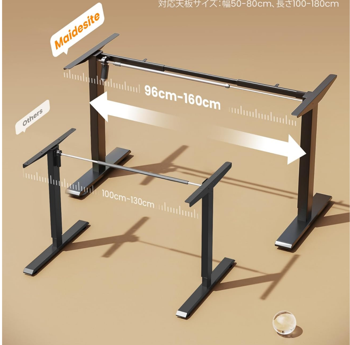
Figure 2.3: Illustration of the desk frame's adjustable width, highlighting its adaptability to different desktop dimensions.

伸縮範囲が2倍になり、DIYに最適! 対応天板サイズ:幅50-80cm、長さ100-180cm