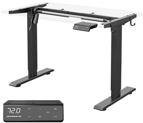
Figure 2.1: Overview of the Maidesite T1 Pro Electric Standing Desk Legs, showing the dual-leg frame and the digital control panel.