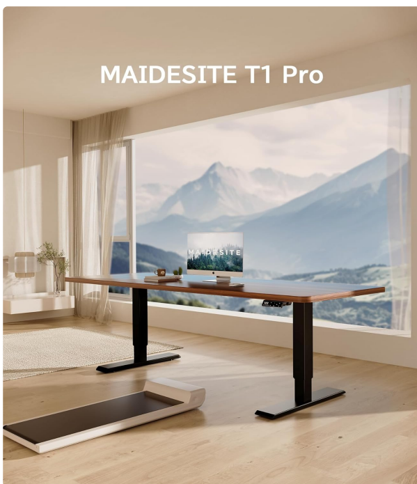
Figure 2.2: The Maidesite T1 Pro desk legs integrated into a home office setup, demonstrating its aesthetic appeal and functionality.