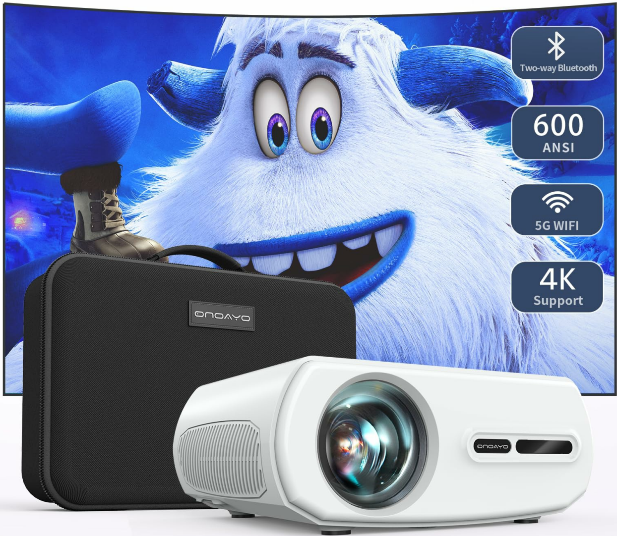
The ONOAYO AY01 Projector, showcasing its compact design, included carrying case, and key features like 4K support, 5G WiFi, and Two-way Bluetooth.