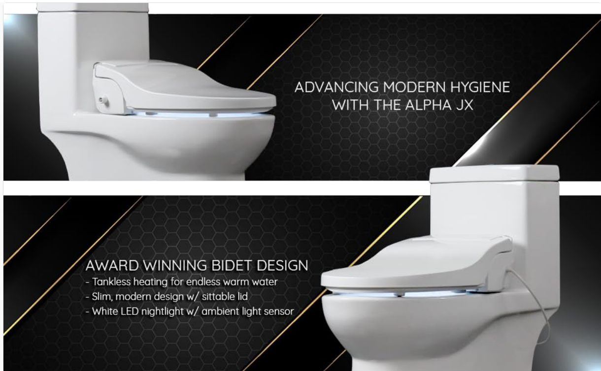
Image 1.2: The ALPHA BIDET JX2 installed, showcasing its modern design and LED night light.