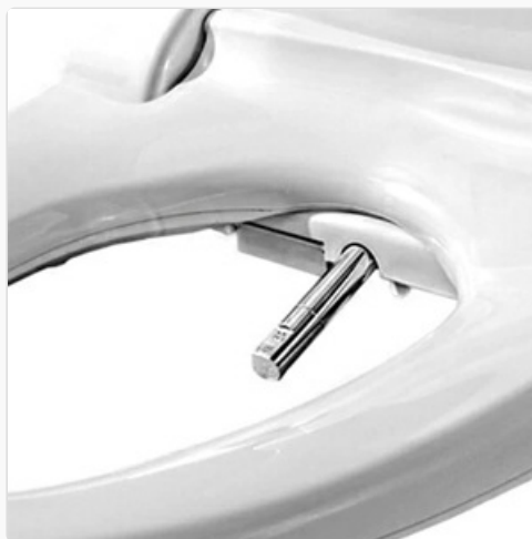
Image 3.1: The self-cleaning stainless steel nozzle, providing precise and hygienic cleansing.