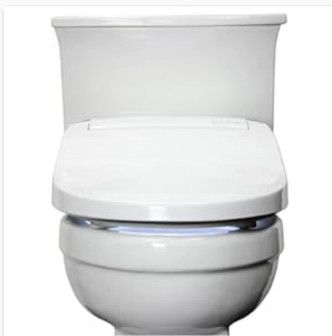
Image 3.3: The LED night light feature, providing subtle illumination.