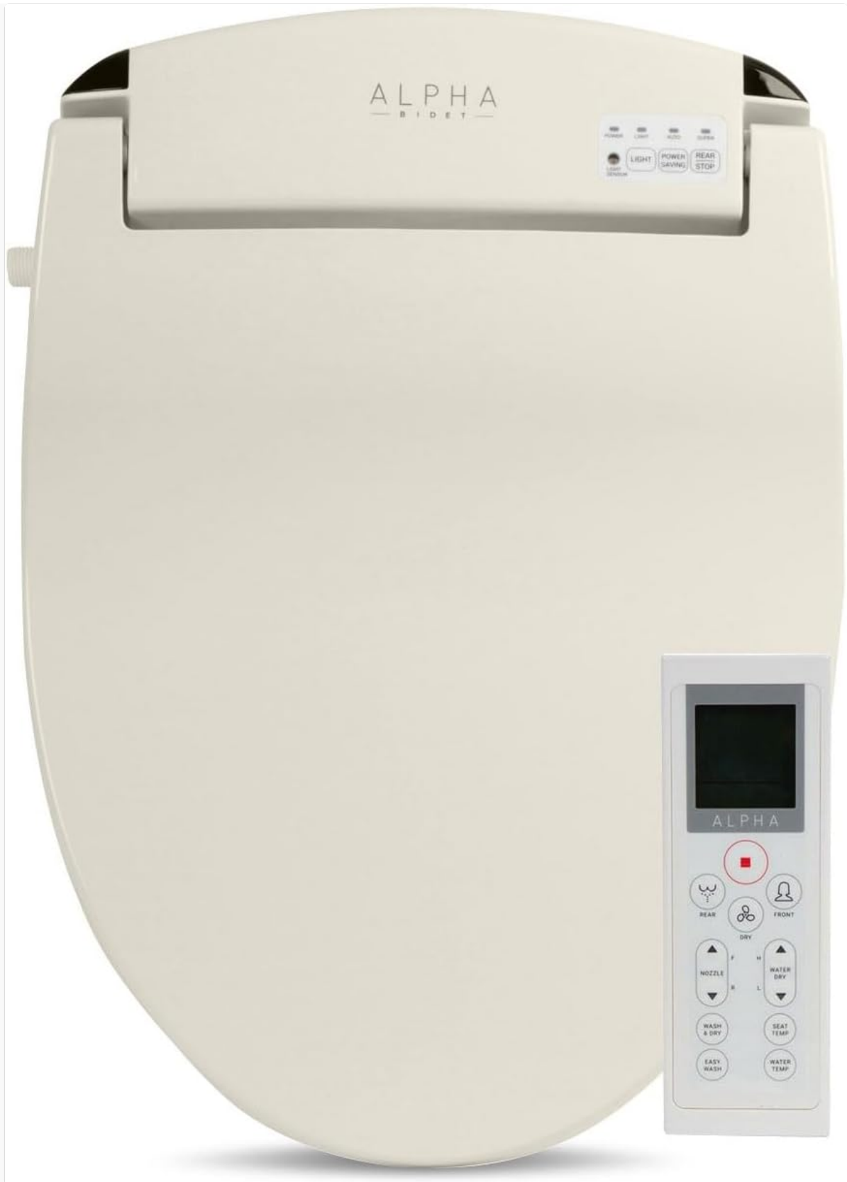
Image 1.1: The ALPHA BIDET JX2 Round Bidet Toilet Seat and its wireless remote control.