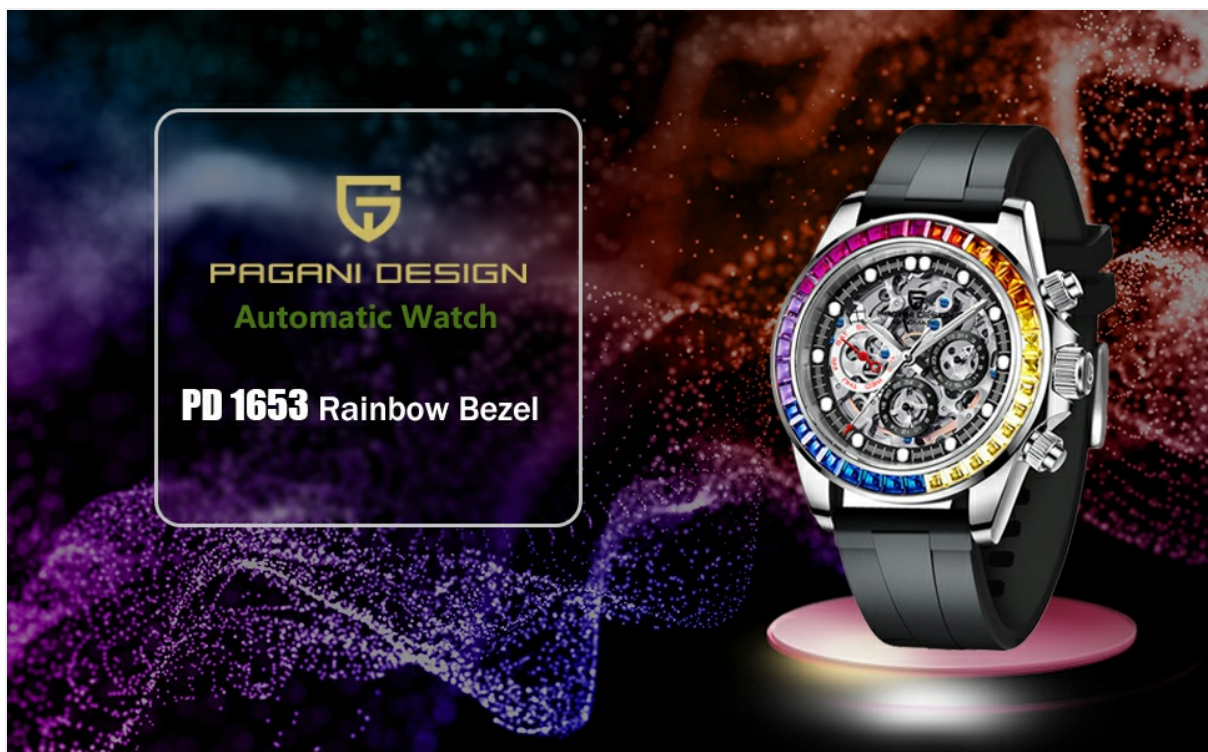
Image: Pagani Design PD1653 Automatic Watch with Rainbow Bezel. This image showcases the watch's unique design with its skeleton dial and colorful bezel.

Thank you for choosing the Pagani Design PD1653 Automatic Mechanical Watch. This timepiece combines sophisticated mechanical engineering with a distinctive aesthetic, featuring a skeleton dial and a vibrant rainbow bezel. This manual provides essential information for the proper setup, operation, and maintenance of your watch to ensure its longevity and accurate performance.