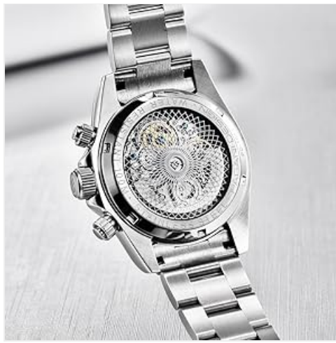
Image: Sapphire crystal with a water droplet. This illustrates the watch's durable and water-resistant crystal.