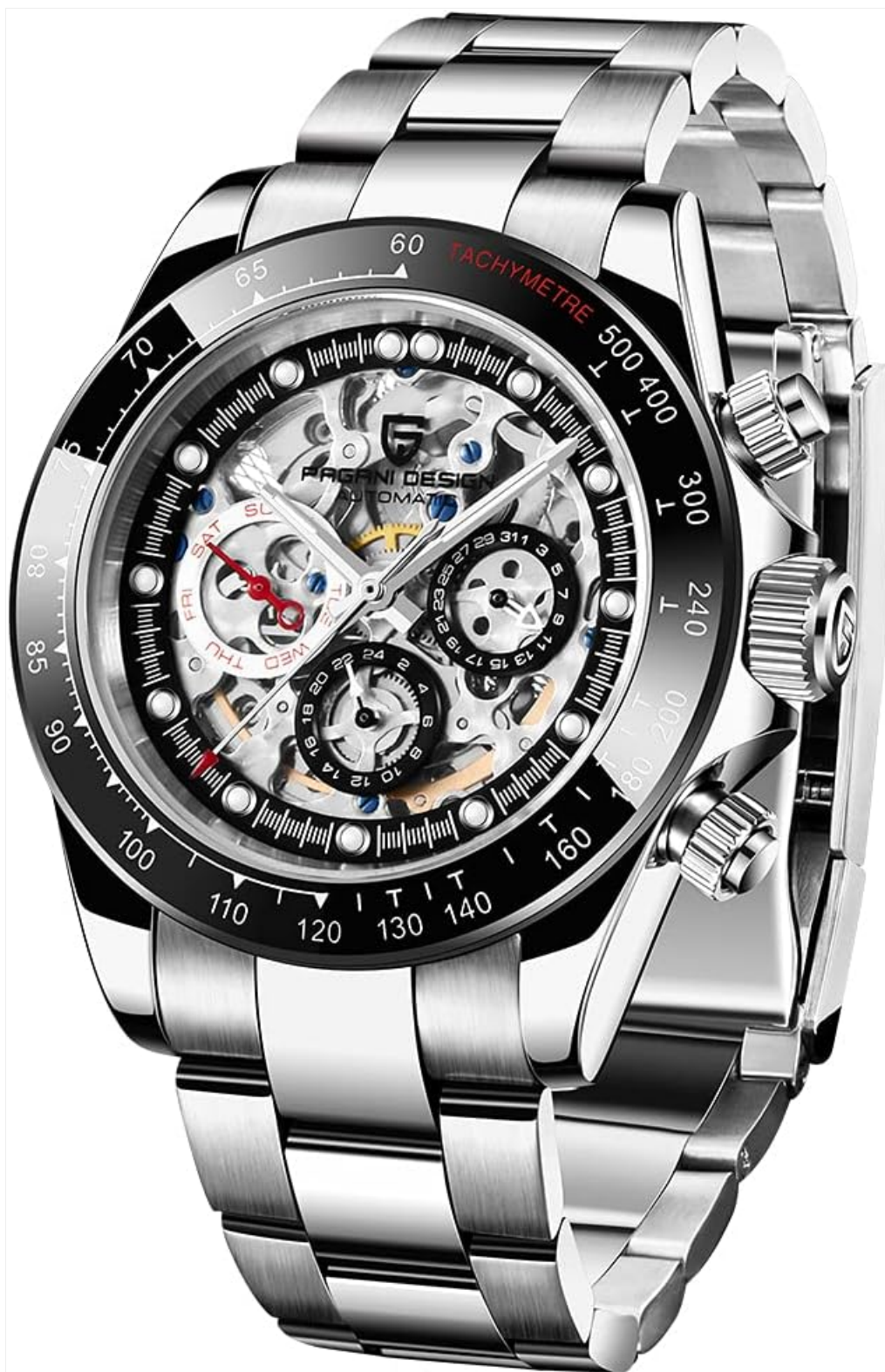
Image: Front view of the Pagani Design PD1653 watch. This image highlights the skeleton dial and the rainbow bezel.