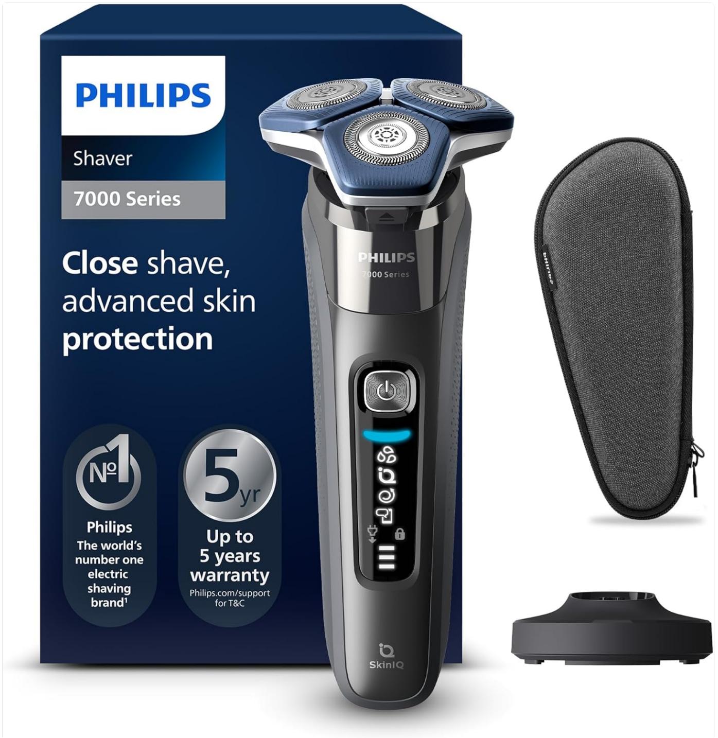
Figure 1: Philips Series 7000 Electric Shaver S7887/35, including its retail packaging, charging stand, and protective travel case.