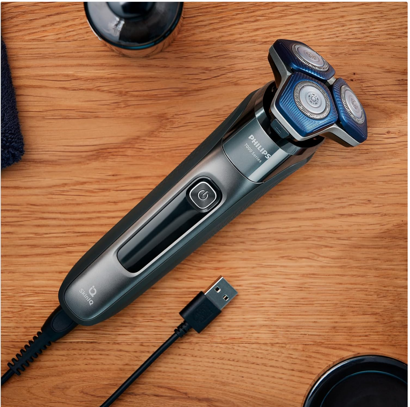
Figure 3: The Philips Series 7000 Shaver placed on a surface with its USB charging cable connected, ready for charging.