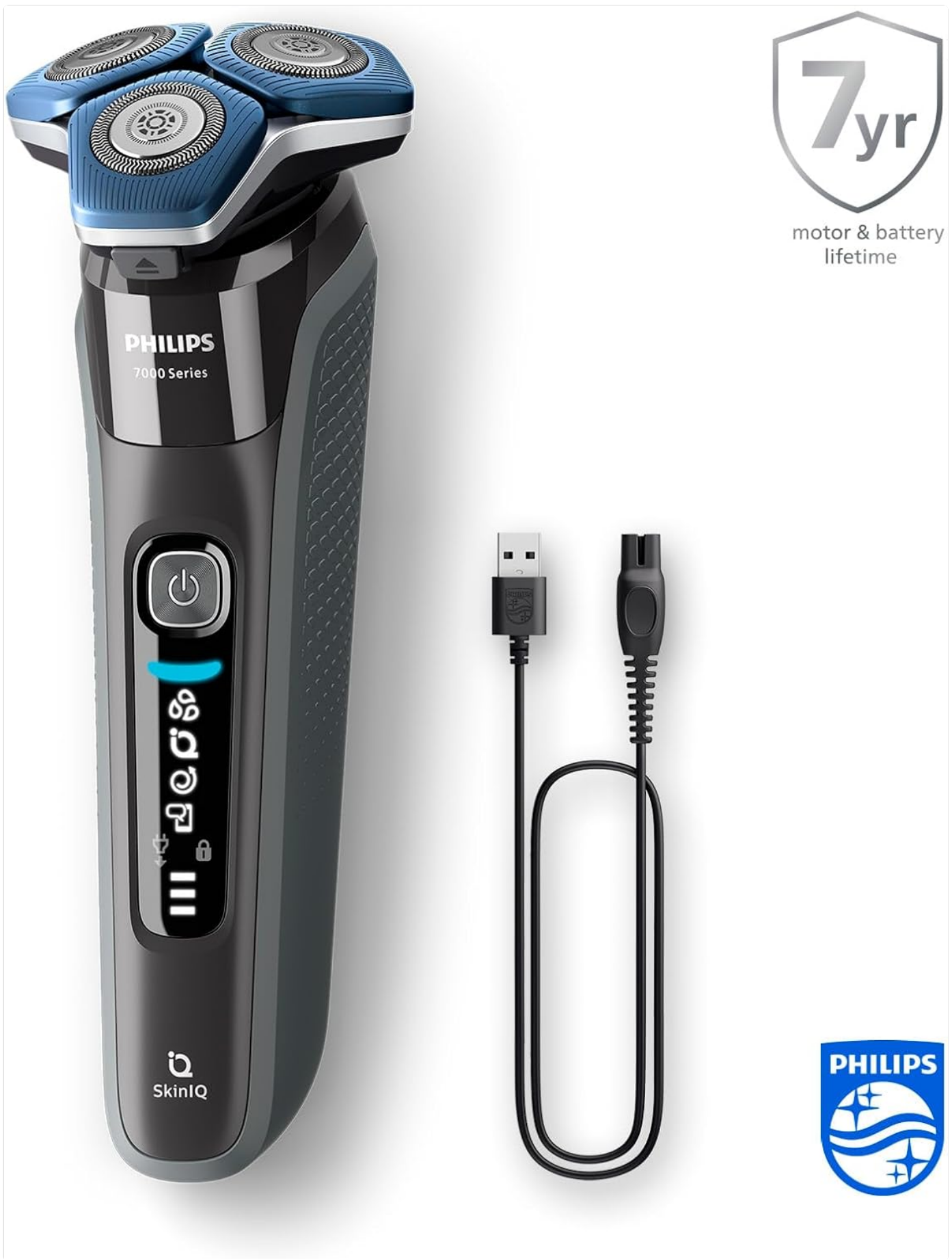
Figure 2: The Philips Series 7000 Electric Shaver shown alongside its USB charging cable, highlighting the power connection.