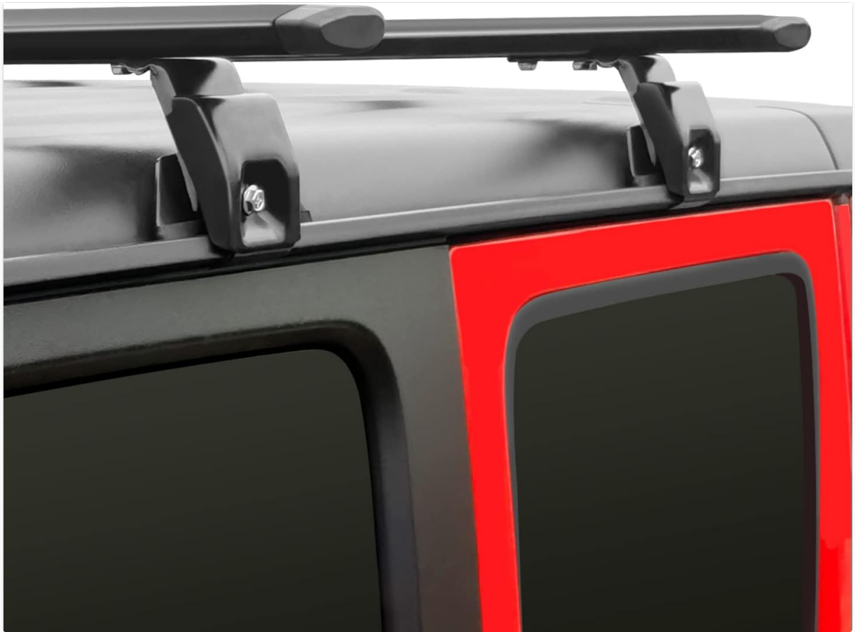
Image: Installed Wonderdriver roof rack cross bars, demonstrating the secure fit on the vehicle's hard top.