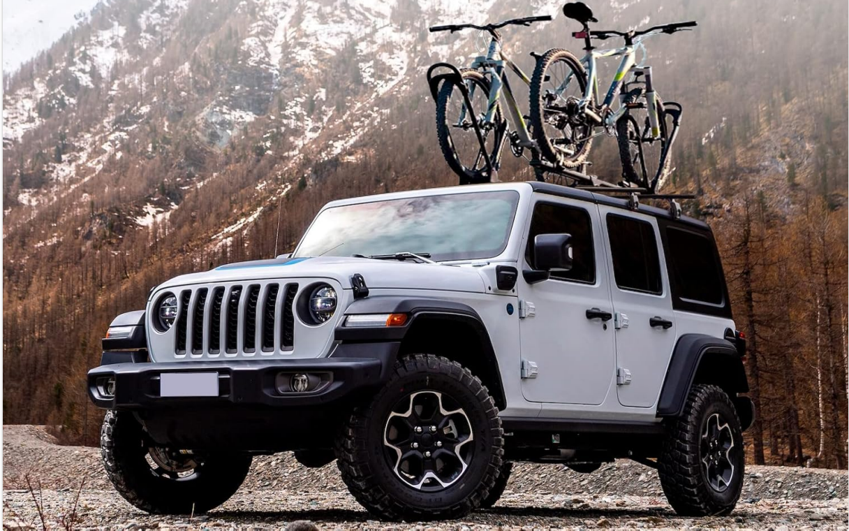
Image: A Jeep showcasing the roof rack's 330lb load capacity with two bikes mounted, ready for adventure.