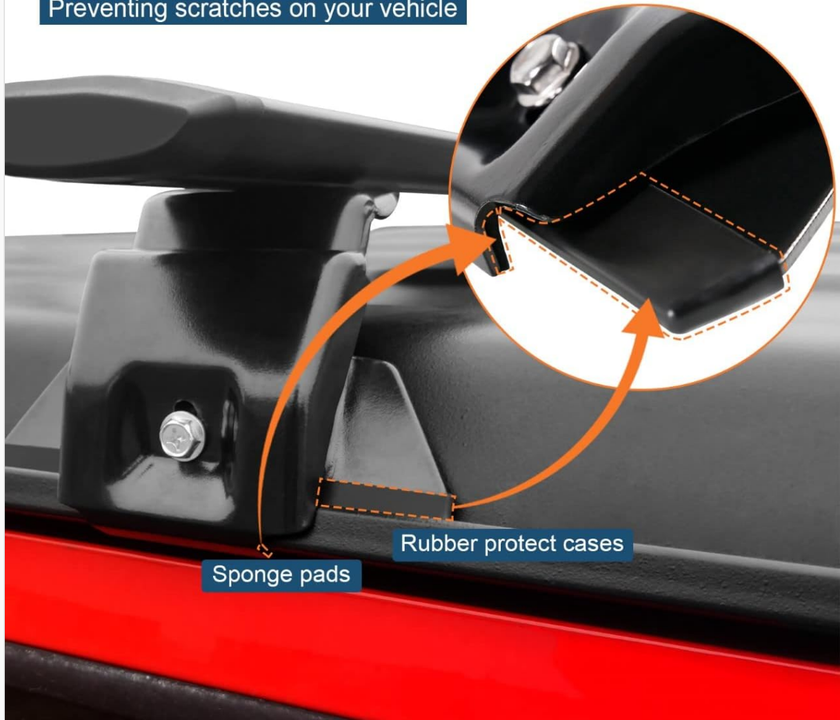
Image: Detail of the rubber protection and sponge pads on the roof rack's base, designed to safeguard the vehicle's finish.