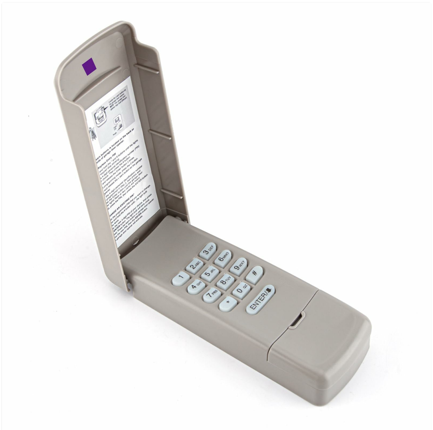
Image 1.1: The LAWOHO 377LM Wireless Keypad with its protective cover open, displaying the numeric buttons.