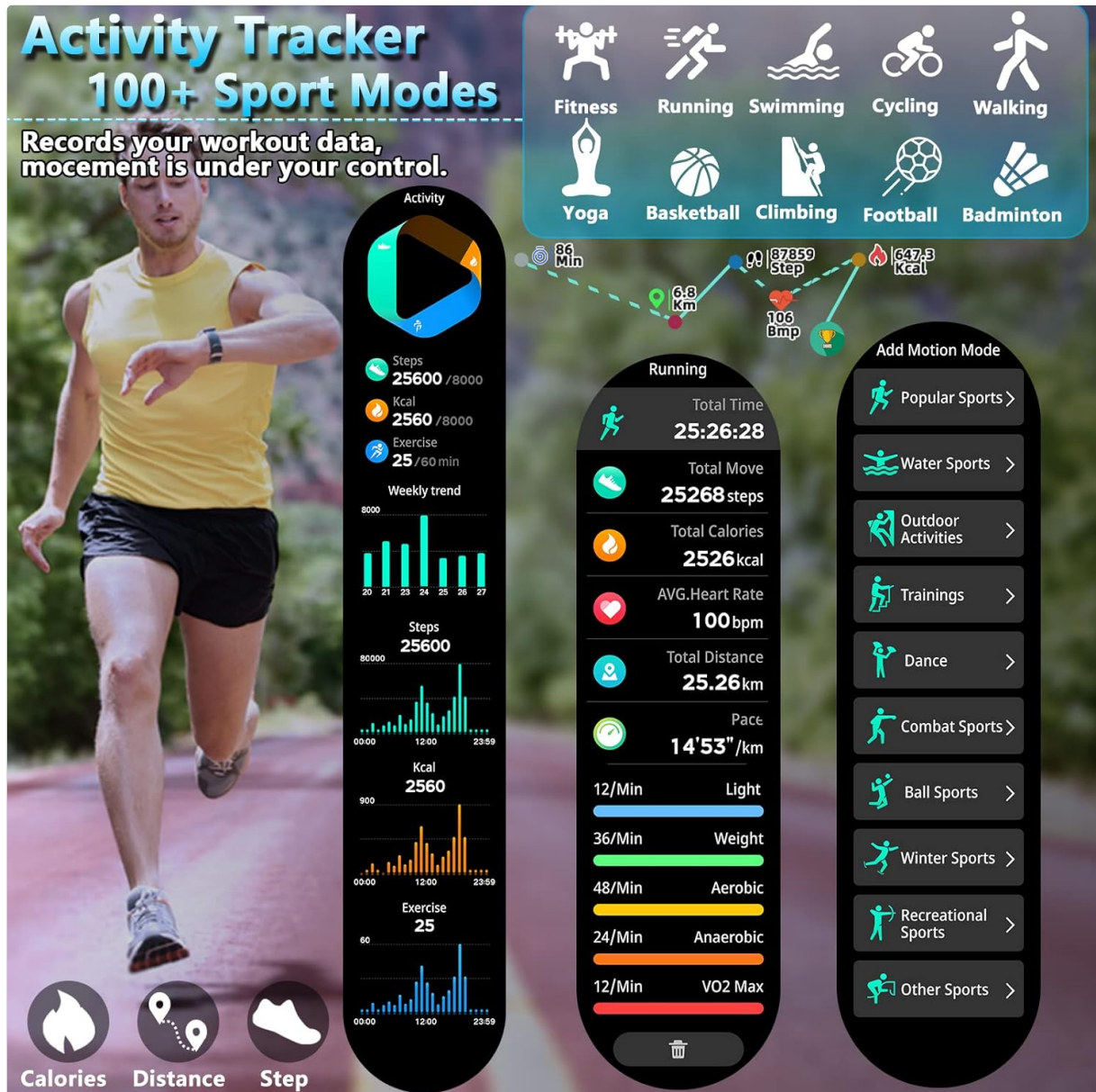
Image: FirYawee Smart Watch S48H S45K displaying activity tracking data including steps, calories, and exercise time, with icons for over 100 sport modes.