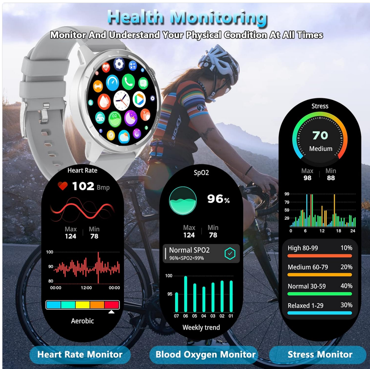
Image: FirYawee Smart Watch S48H S45K displaying health monitoring data including heart rate (102 bpm), SpO2 (96%), and stress level (70, medium).