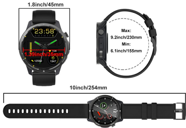
Image: FirYawee Smart Watch S48H S45K displaying various customizable watch faces, including options to use personal photos.

1X Smart watch, 1X USB Cable, 1X Instruction manual