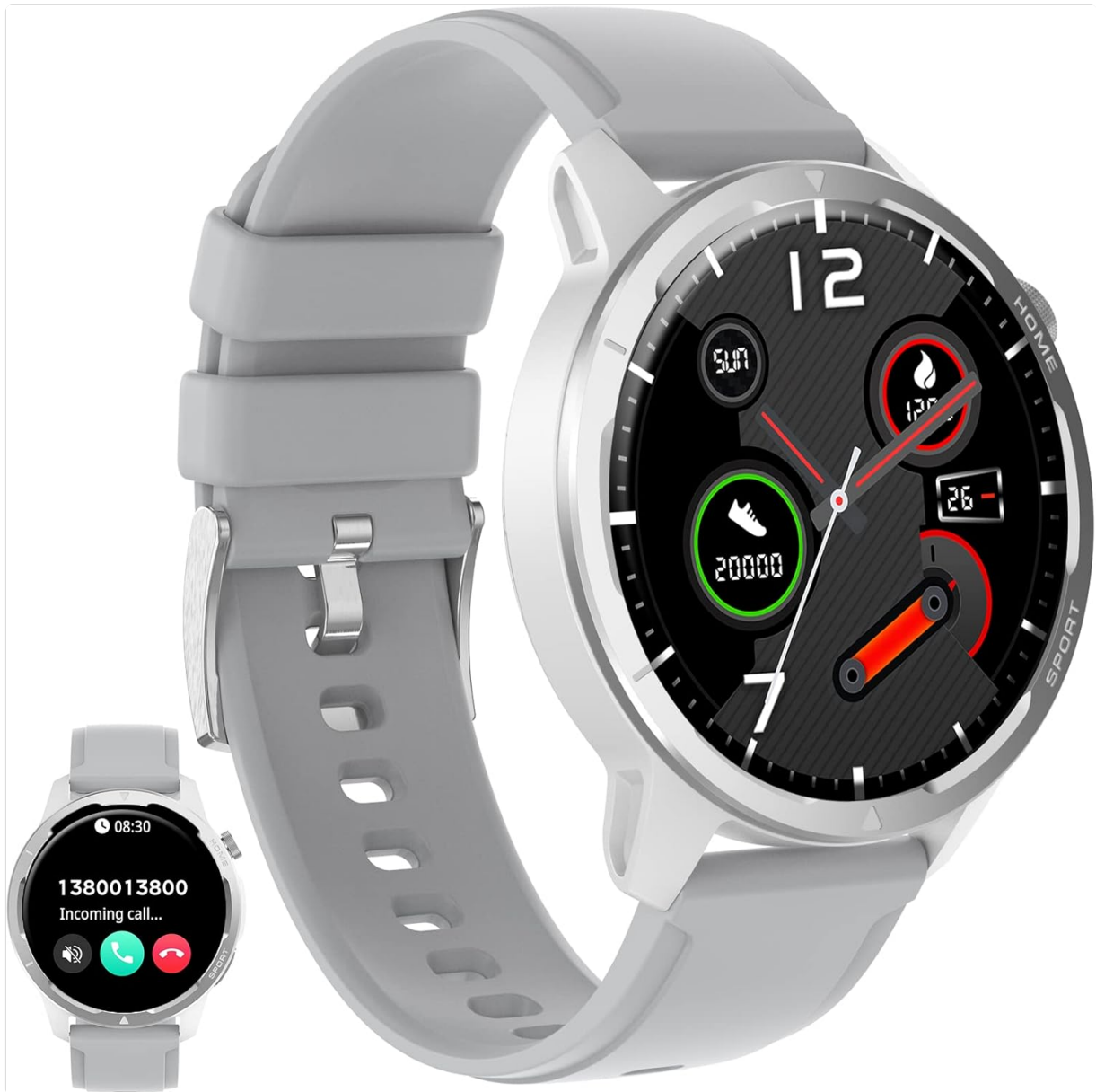
Image: FirYawee Smart Watch S48H S45K displaying a watch face with time and date, showing the side buttons labeled 'HOME' and 'SPORT'.