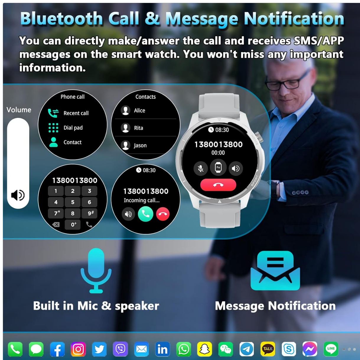
Image: FirYawee Smart Watch S48H S45K displaying an incoming call screen with options to answer or decline, alongside a diagram showing call features like dial pad, recent calls, and contacts.