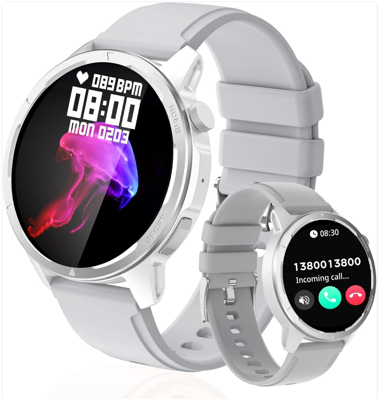
Image: FirYawee Smart Watch S48H S45K, gray color, displaying time and heart rate.