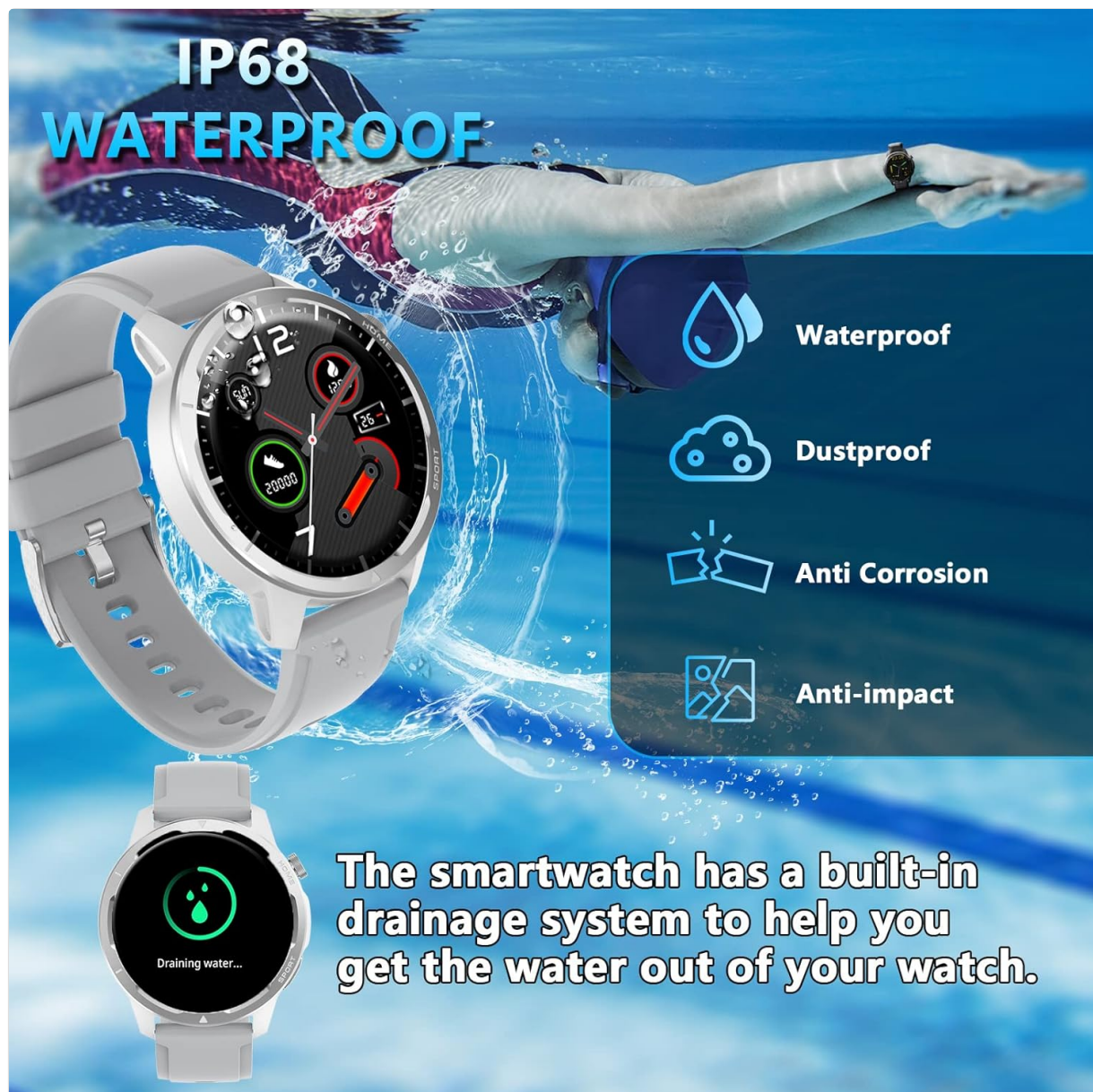
Image: FirYawee Smart Watch S48H S45K submerged in water, illustrating its IP68 waterproof rating, with icons for waterproof, dustproof, anti-corrosion, and anti-impact features.