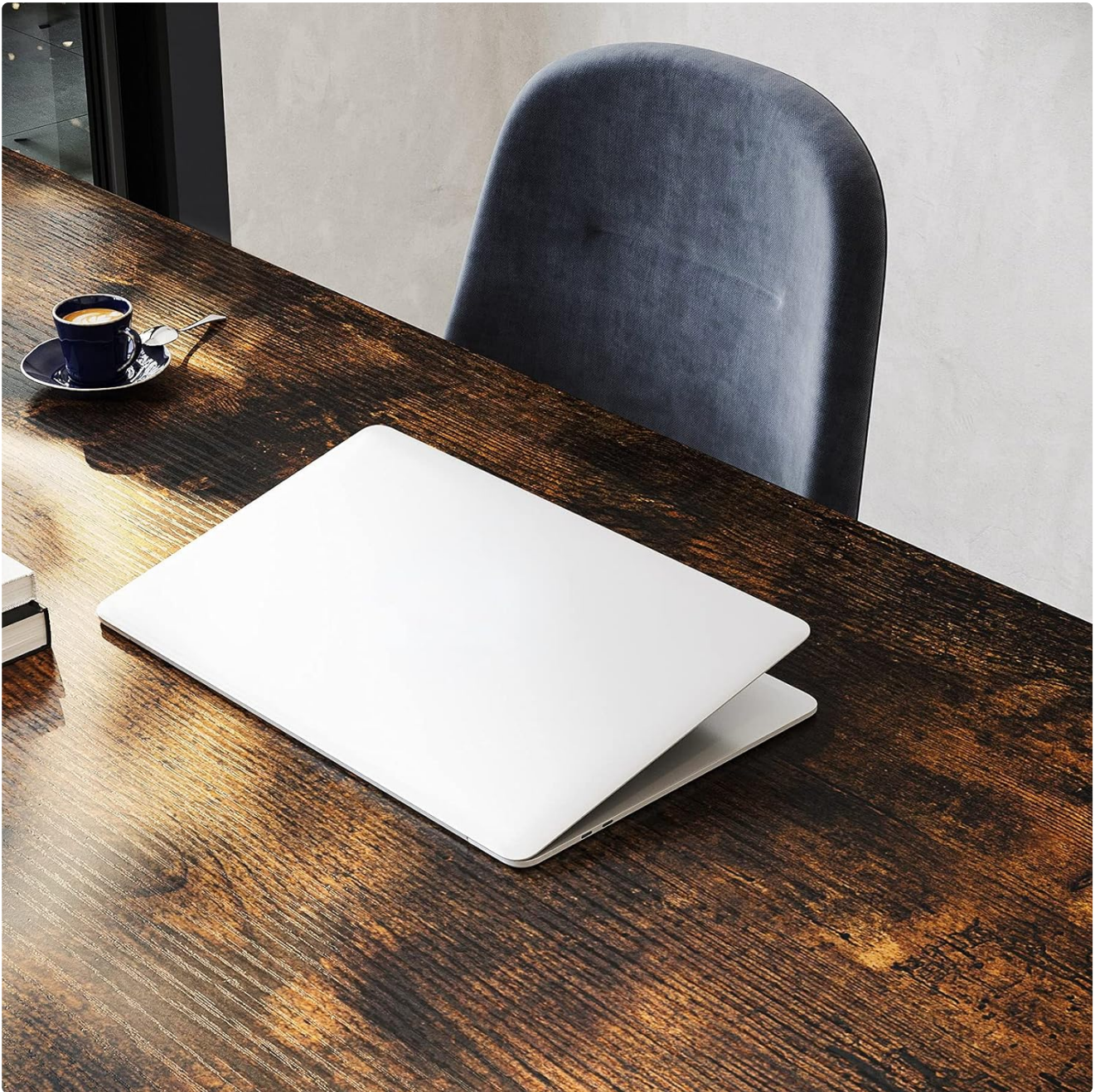
Image: A detailed close-up of the vintage wood grain desktop surface, highlighting its texture and smooth finish.