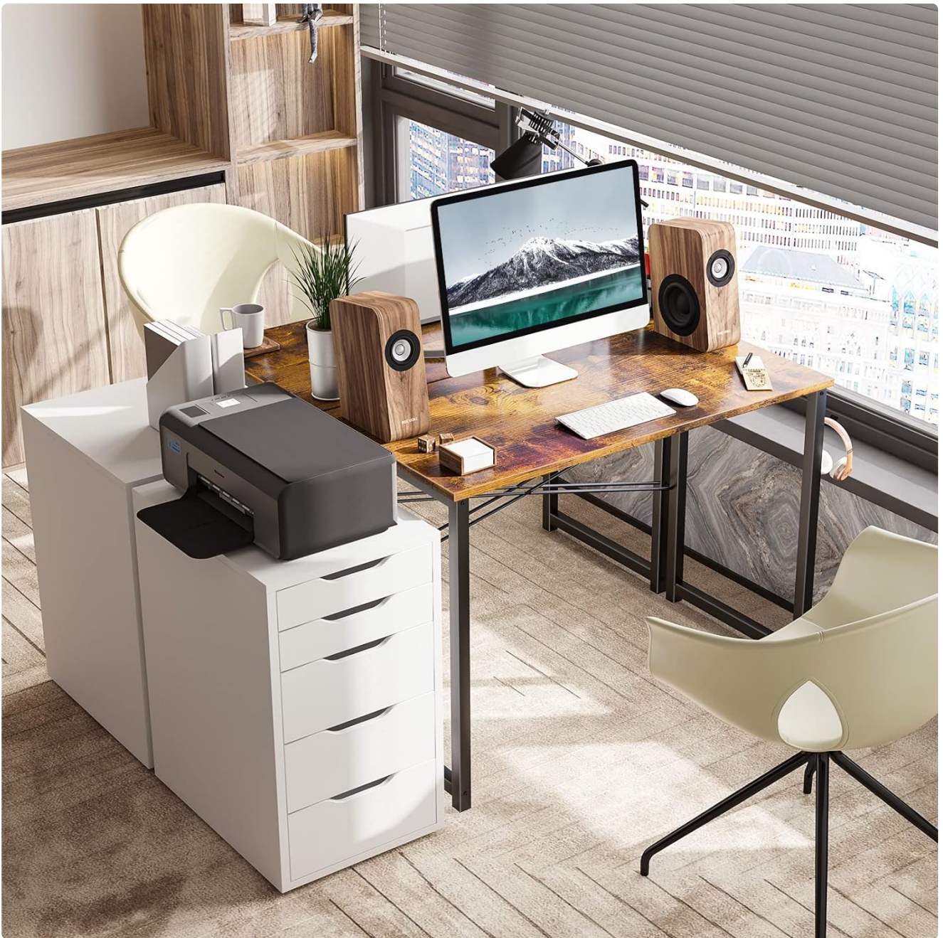
Image: The Coleshome 32-inch Vintage Computer Desk, showcasing its compact design in a modern home office environment. The desk provides ample space for a monitor, speakers, and a printer, demonstrating its practical use.