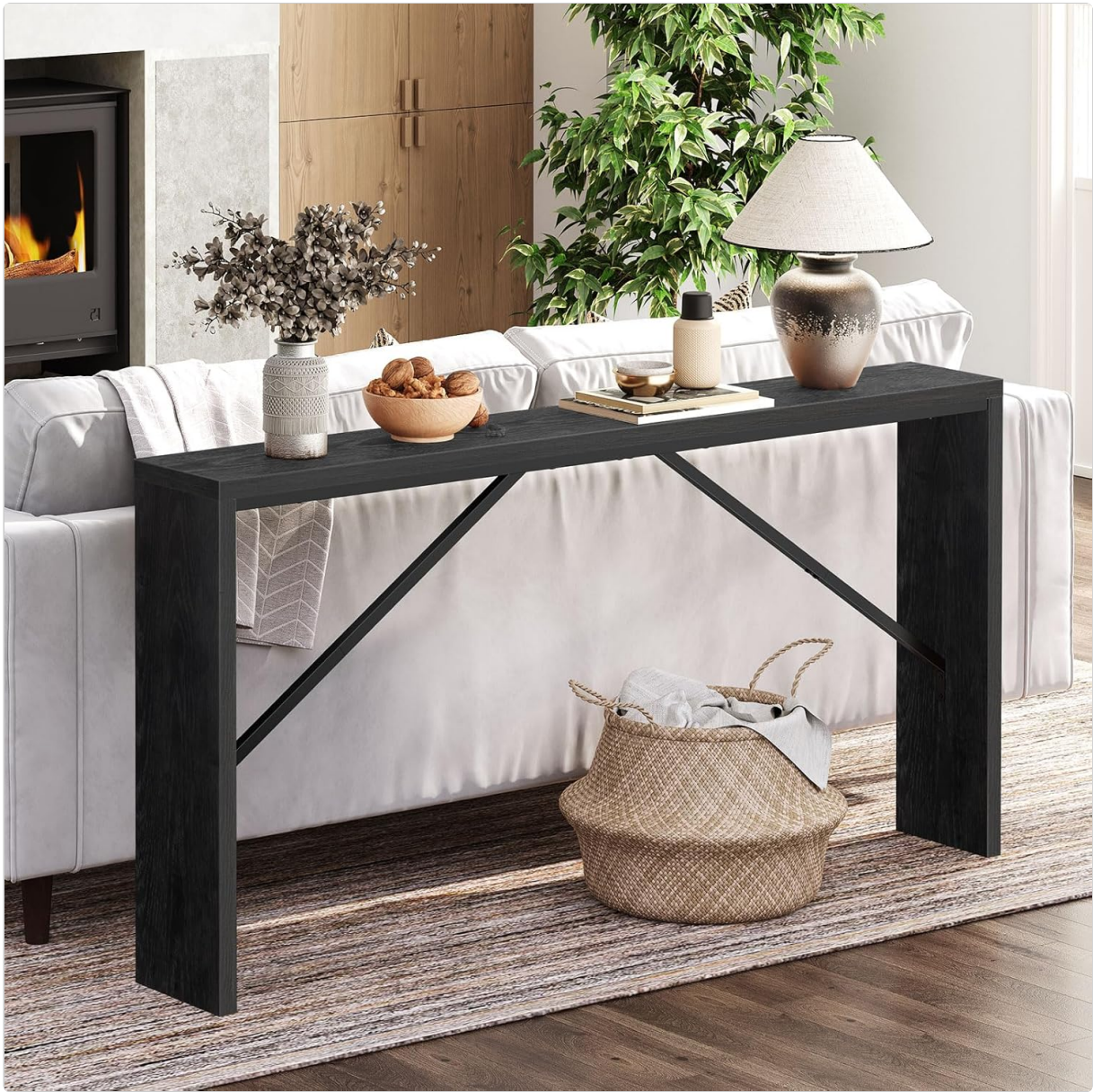
Figure 4: Console table serving as an elegant entryway piece.

Your browser does not support the video tag.