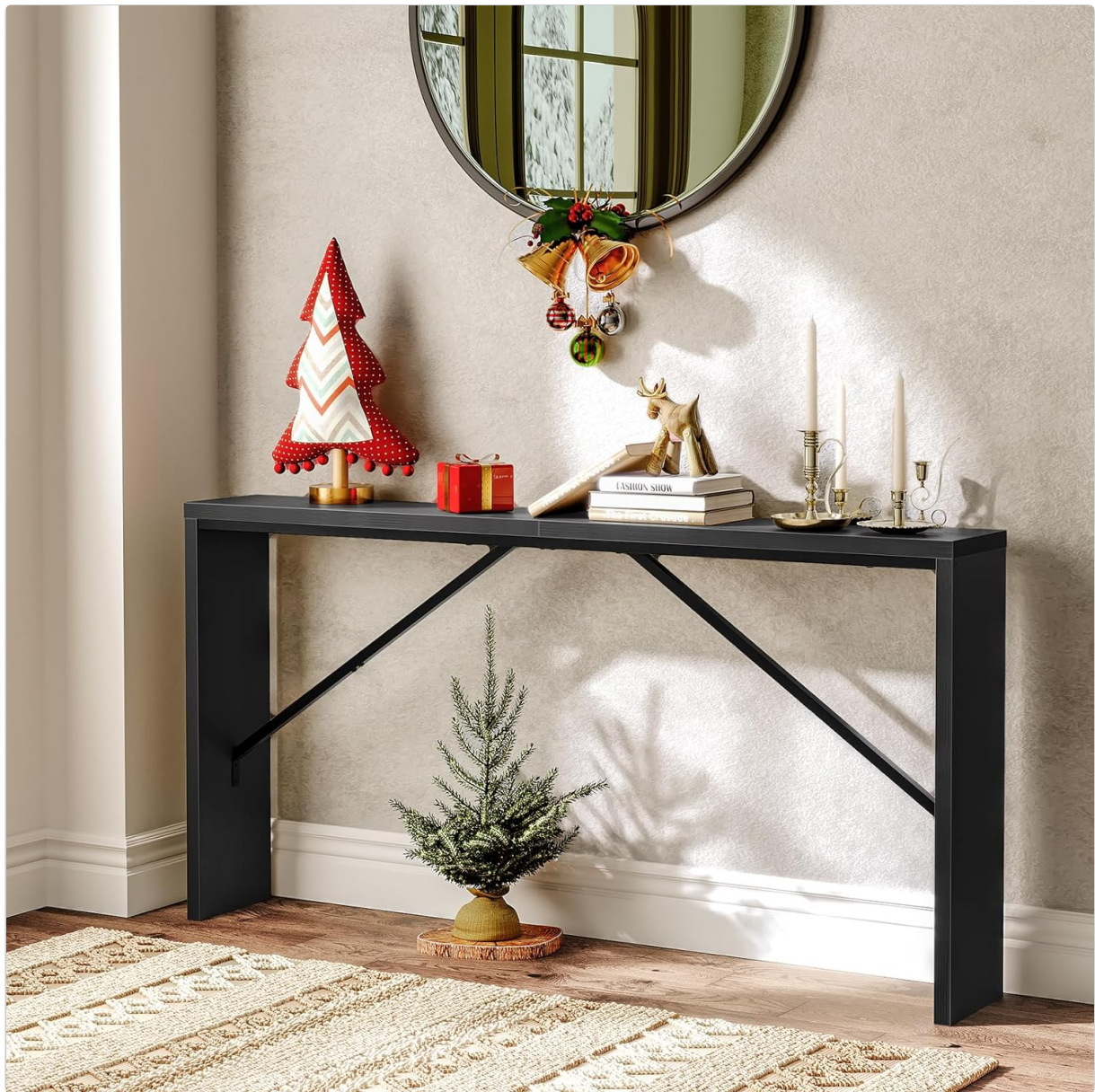
Figure 1: Fully assembled MAHANCRIIS Console Table.