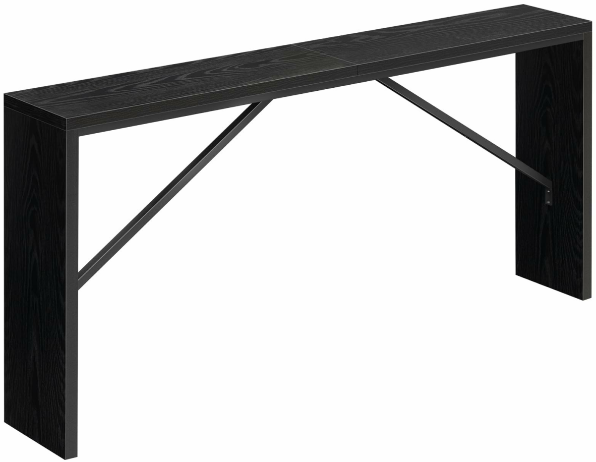
Figure 5: Product dimensions for the MAHANCRIIS Console Table.