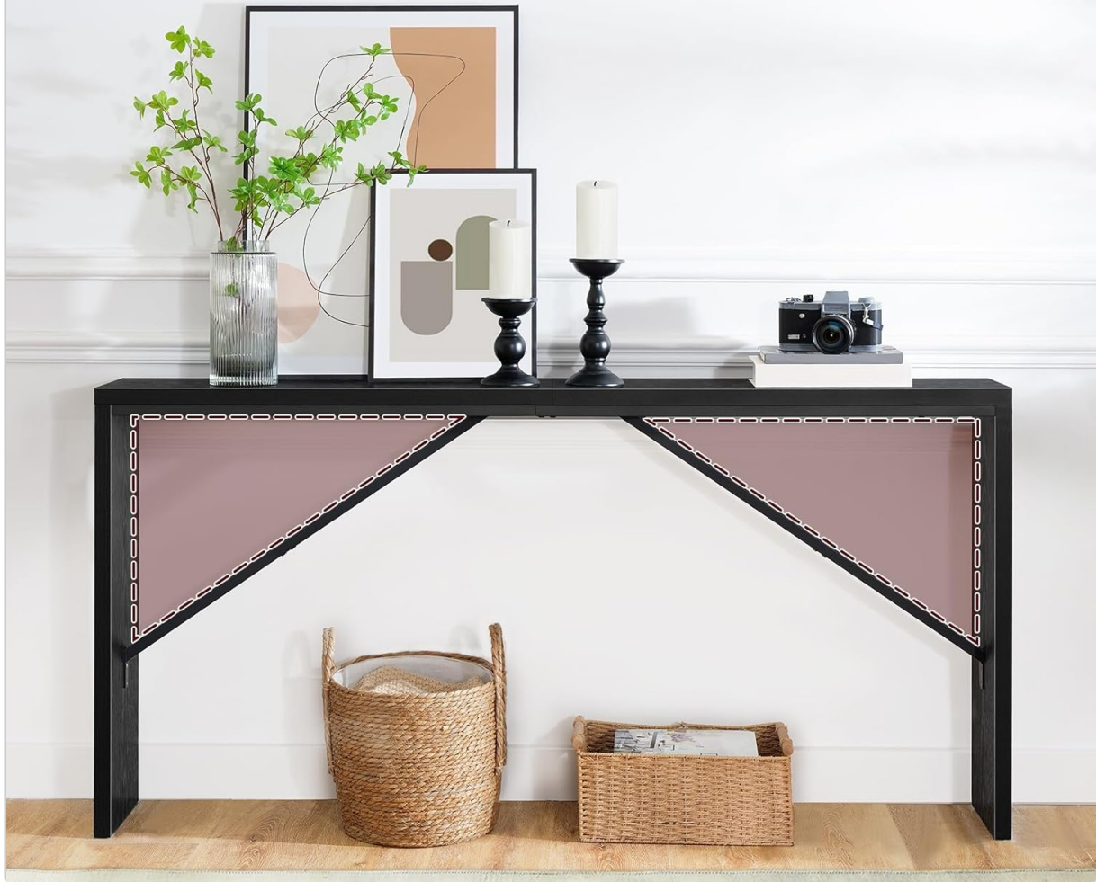
Figure 2: Key features: 1.2" thickened board, herringbone-shaped stable structure, self-adhesive floor protectors, and anti-tip furniture anchor kit.

The herringbone iron support effectively helps stability without sacrificing basket storage below and can bear up to 120 pounds.