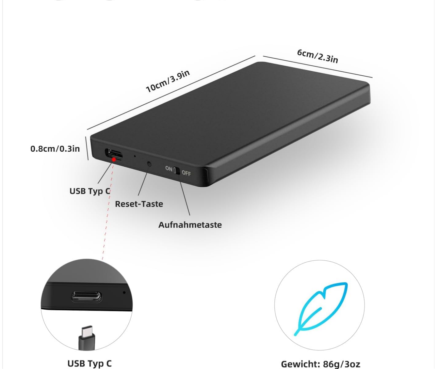
Image: Detailed dimensions and weight of the Vivaniir Voice Recorder.