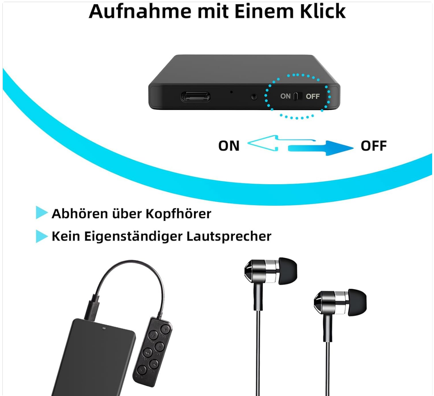
Image: Illustration of the one-touch recording switch and the method for listening to recordings via headphones.