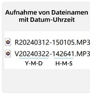
Image: An example of how recording files are named with date and time for easy organization.