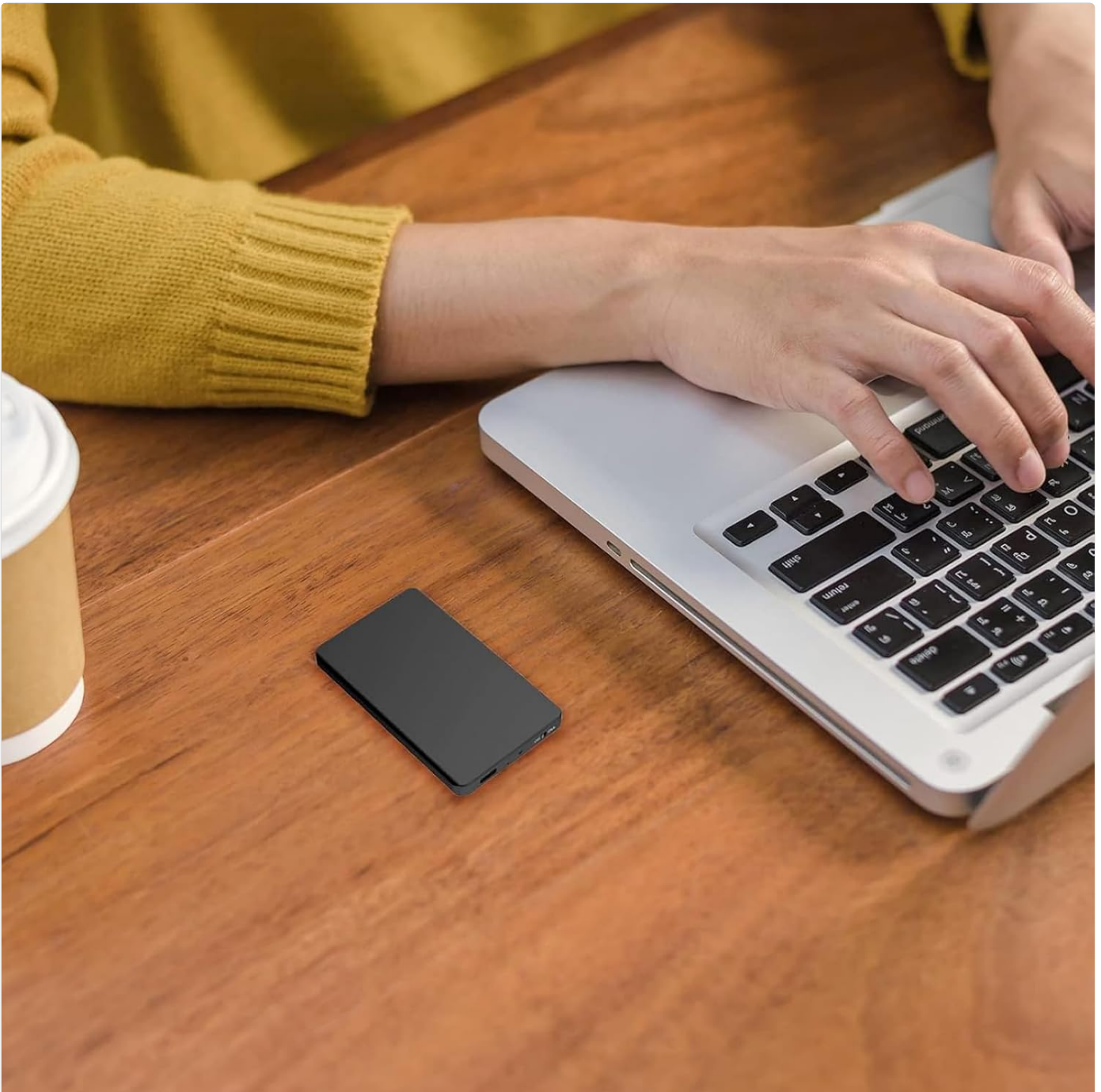
Image: The voice recorder connected to a laptop, demonstrating how to access files and play recordings.