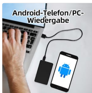
Image: A visual icon indicating playback options via Android phone or PC.