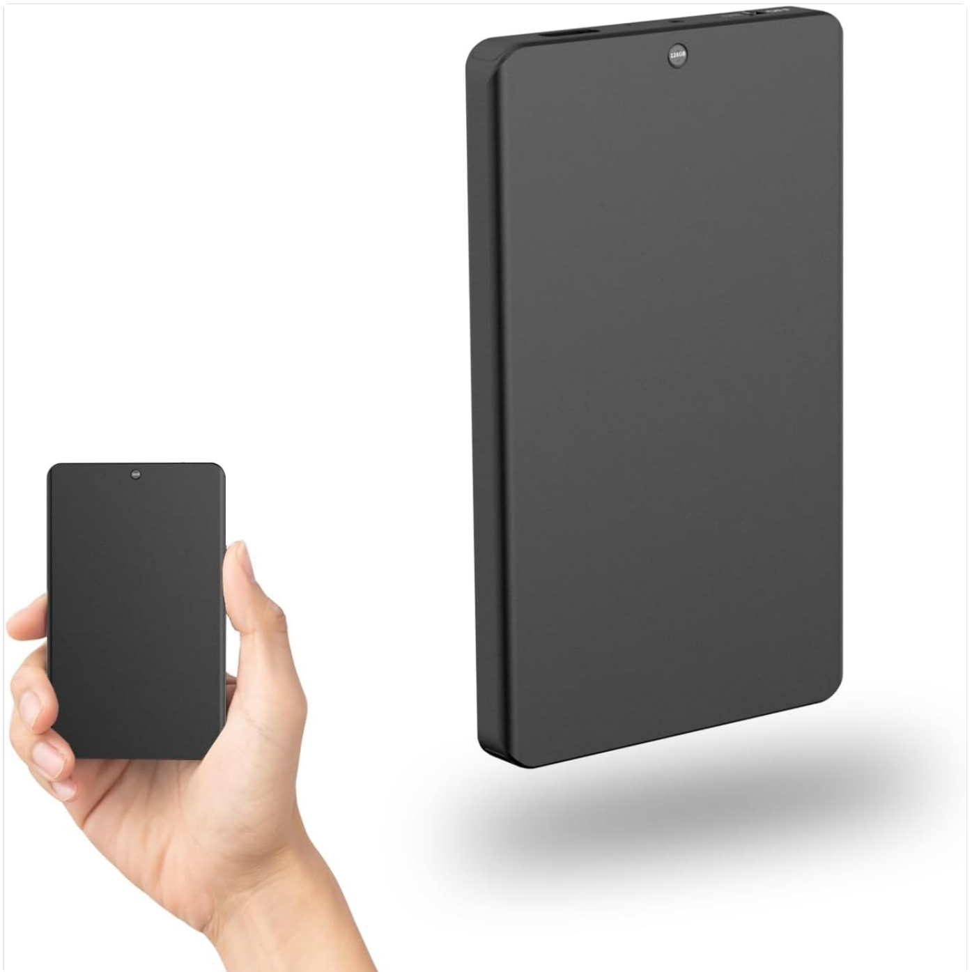
Image: The Vivaniir Voice Recorder, highlighting its small, portable form factor.