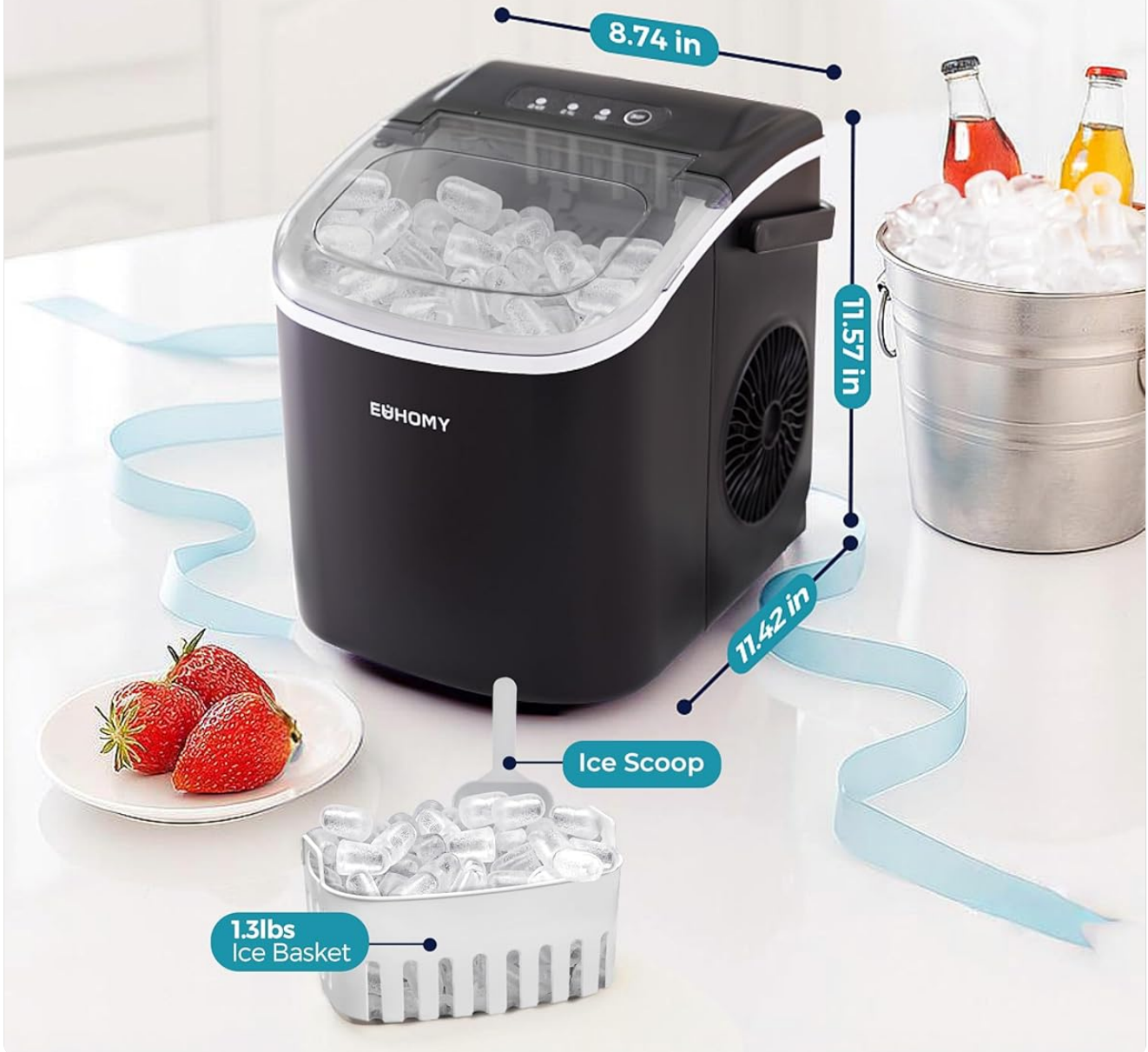
Figure 3.2: Compact dimensions and components of the EUHOMY Ice Maker.

No More 'Where Do I Put This?' Just Pure Ice Magic on Day One