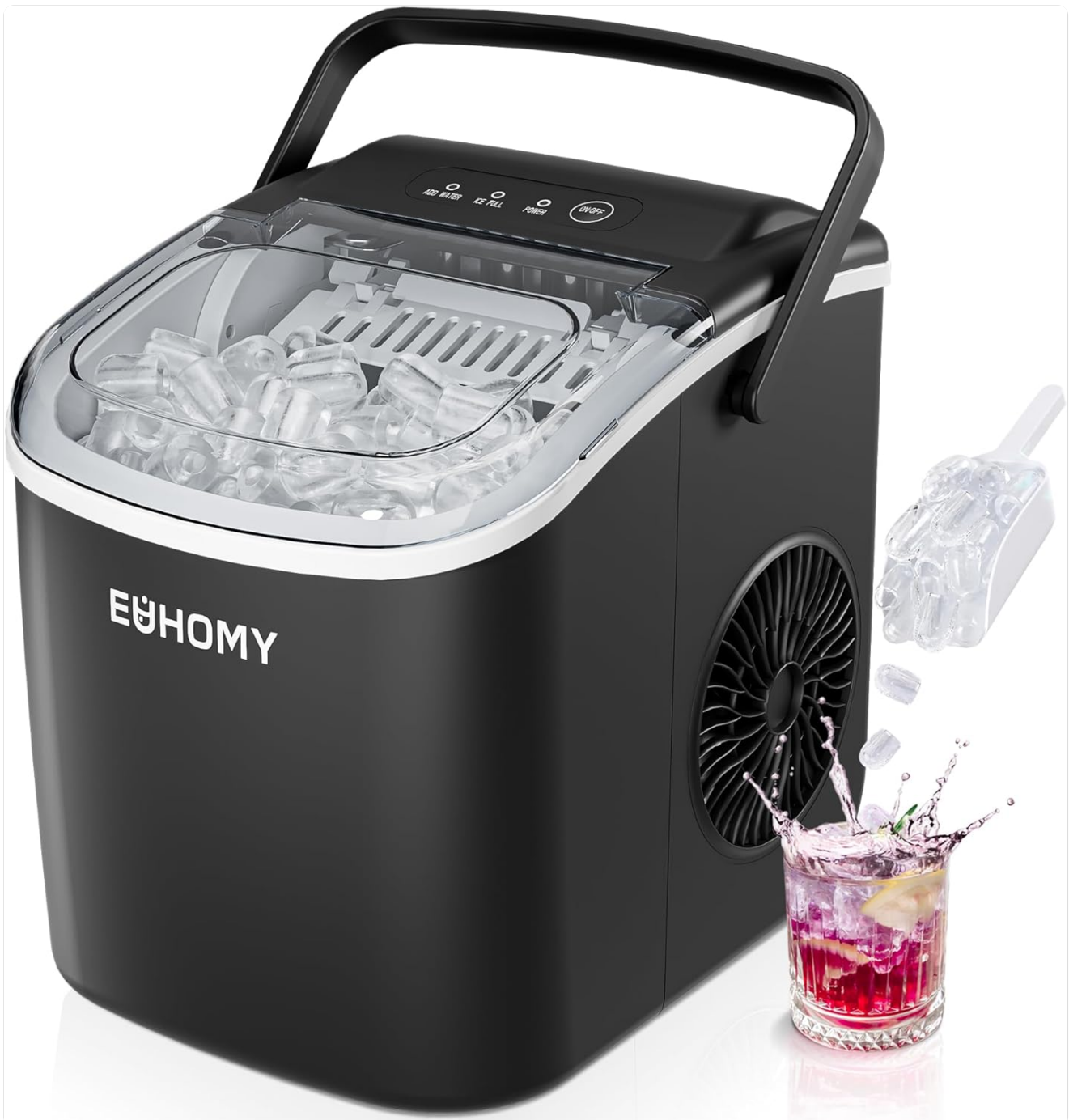
Figure 3.1: EUHOMY Countertop Ice Maker with included accessories.