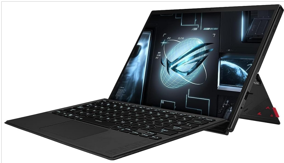
Figure 1: ASUS ROG Flow Z13 with detachable keyboard.