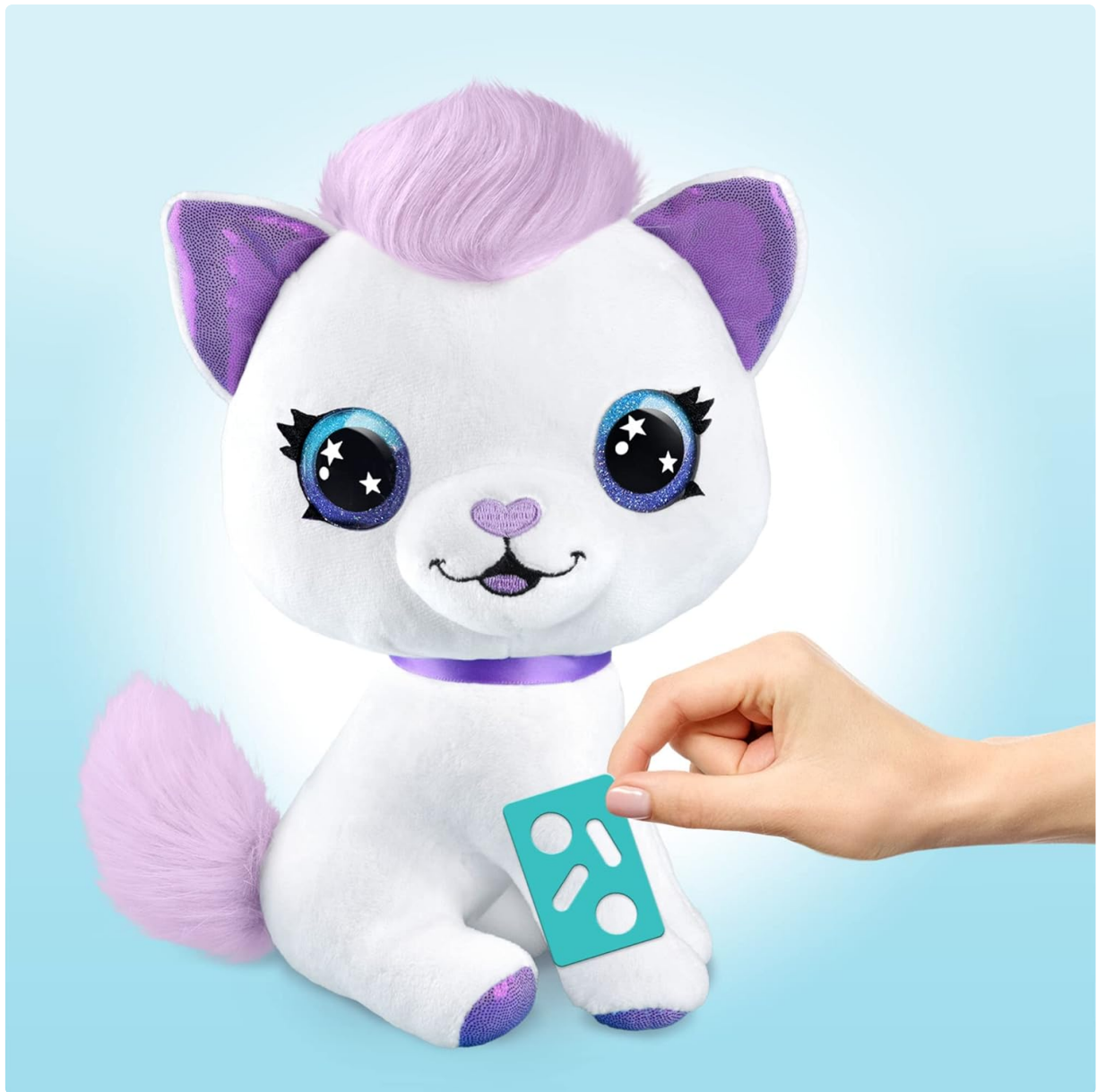
Image: Using the airbrush gun to apply color through a stencil.