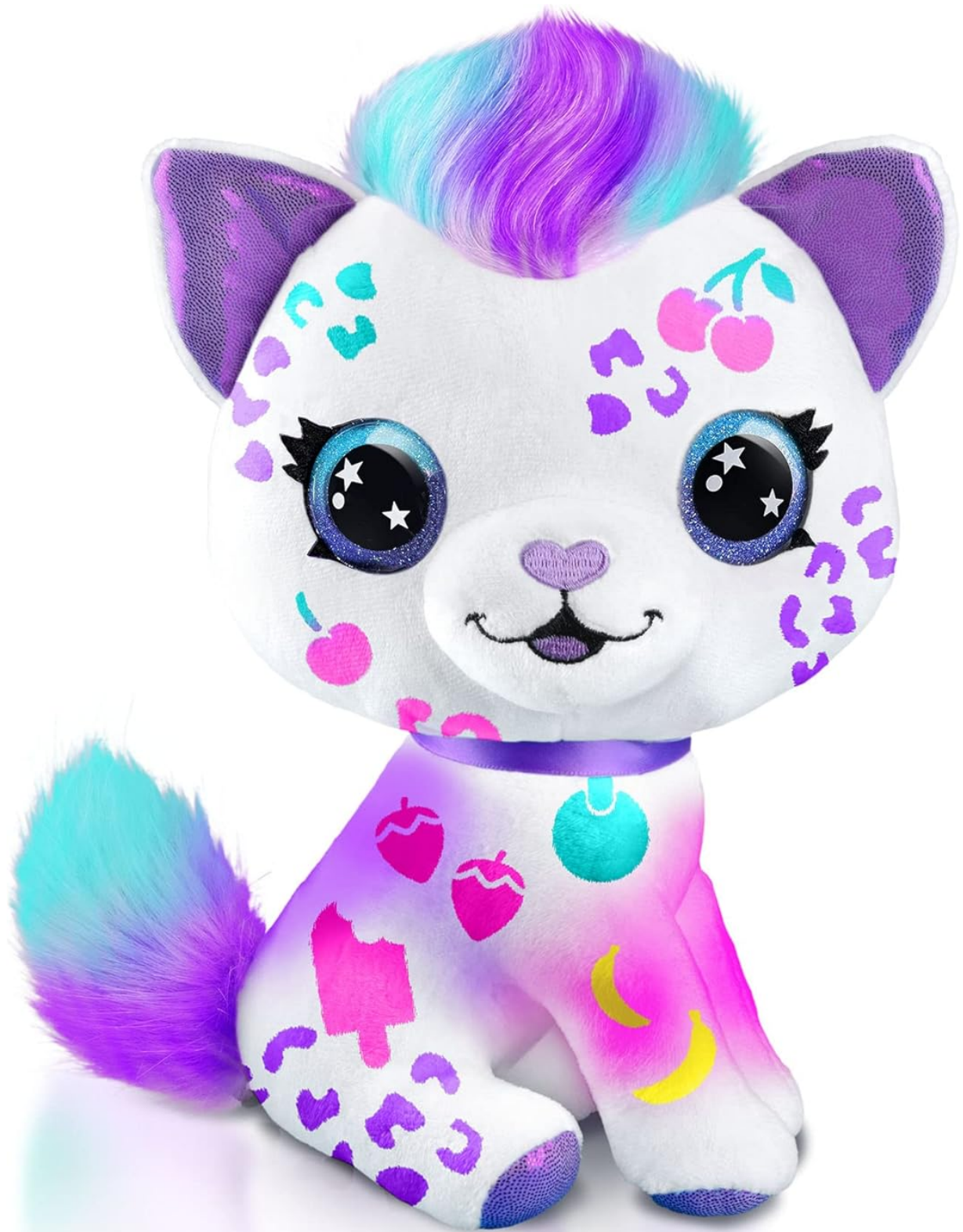
Image: The plush kitty is clean and ready for new designs after washing.