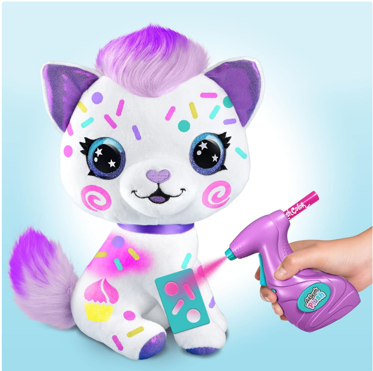
Image: An example of a customized plush kitty with multiple patterns.