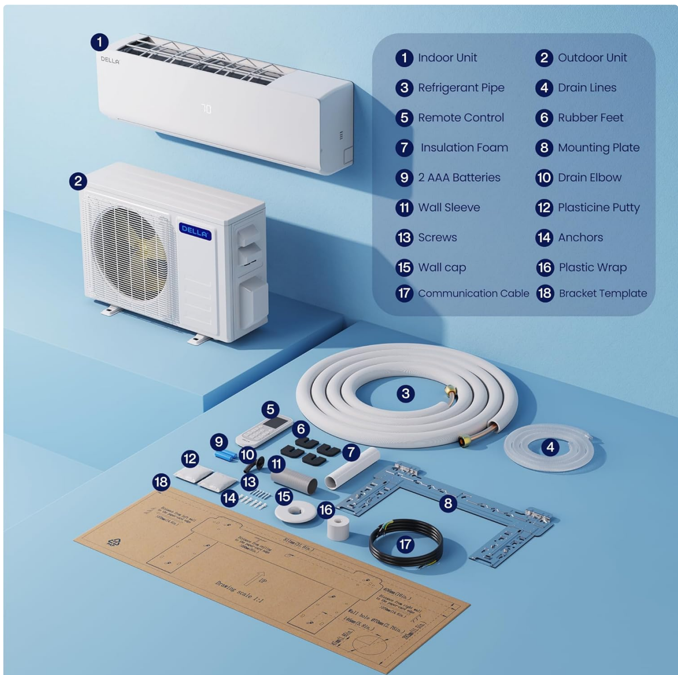
Image 3.1: An exploded diagram illustrating all components included with the DELLA Mini Split system, such as the indoor unit, outdoor unit, refrigerant pipe, remote control, and various installation accessories.