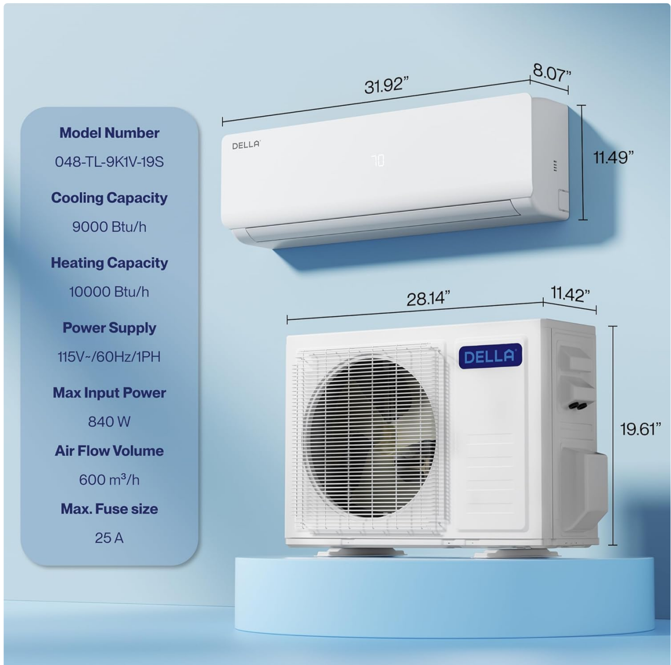
Image 7.1: A diagram showing the dimensions of both the indoor and outdoor units, alongside key performance specifications.

Detailed technical specifications for the DELLA Vario Series 9000 BTU Mini Split Air Conditioner.