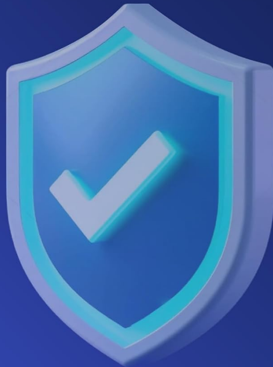
Image 8.1: An image illustrating the "Lifetime Coverage" and "24/7 Customer Support" offered by DELLA, emphasizing peace of mind for the user.