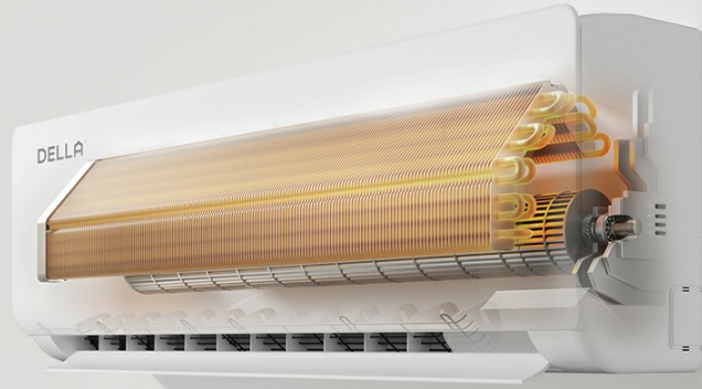
Image 5.2: A cutaway view of the indoor unit, demonstrating the PureClean technology that prevents dust buildup and aids in defrosting for cleaner air.

PureClean tech stops dust buildup and defrosts your indoor unit, keeping your air fresher with advanced sterilization.