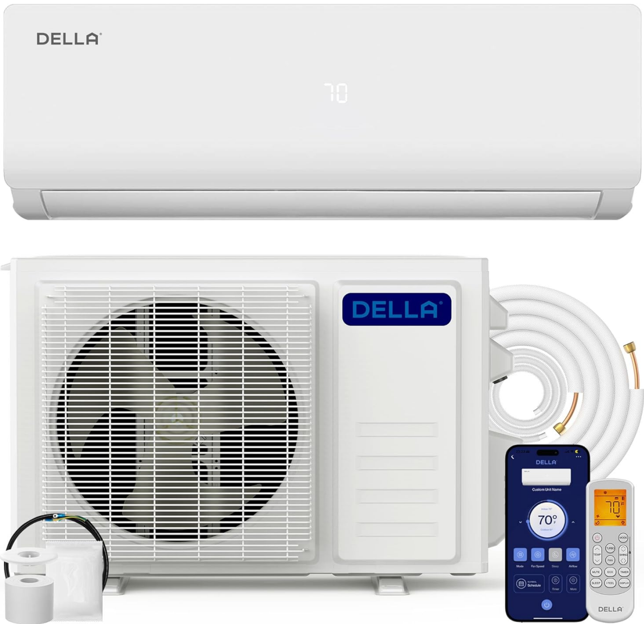
Image 1.1: The DELLA Vario Series Mini Split Air Conditioner, showcasing both the indoor and outdoor units, along with the remote control and a smartphone displaying the control app.

Key features include 4D airflow control (up-down, left-right), an "I Feel" mode for personalized comfort, a 24-hour timer, sleep mode, and an eco energy-saving mode. The system also offers multiple fan speeds, a turbo function, and dry modes for dehumidification. Its quiet operation, at only 41 dBa, ensures minimal disturbance.