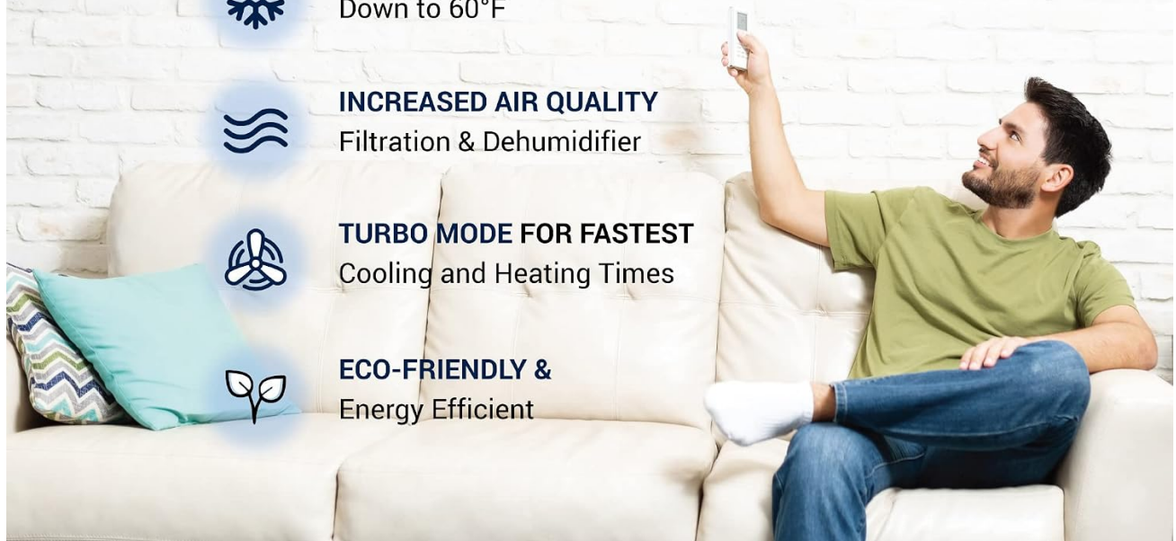
Figure 3.2: Overview of the unit's capabilities including powerful heating and cooling, improved air quality, turbo mode, and energy efficiency.