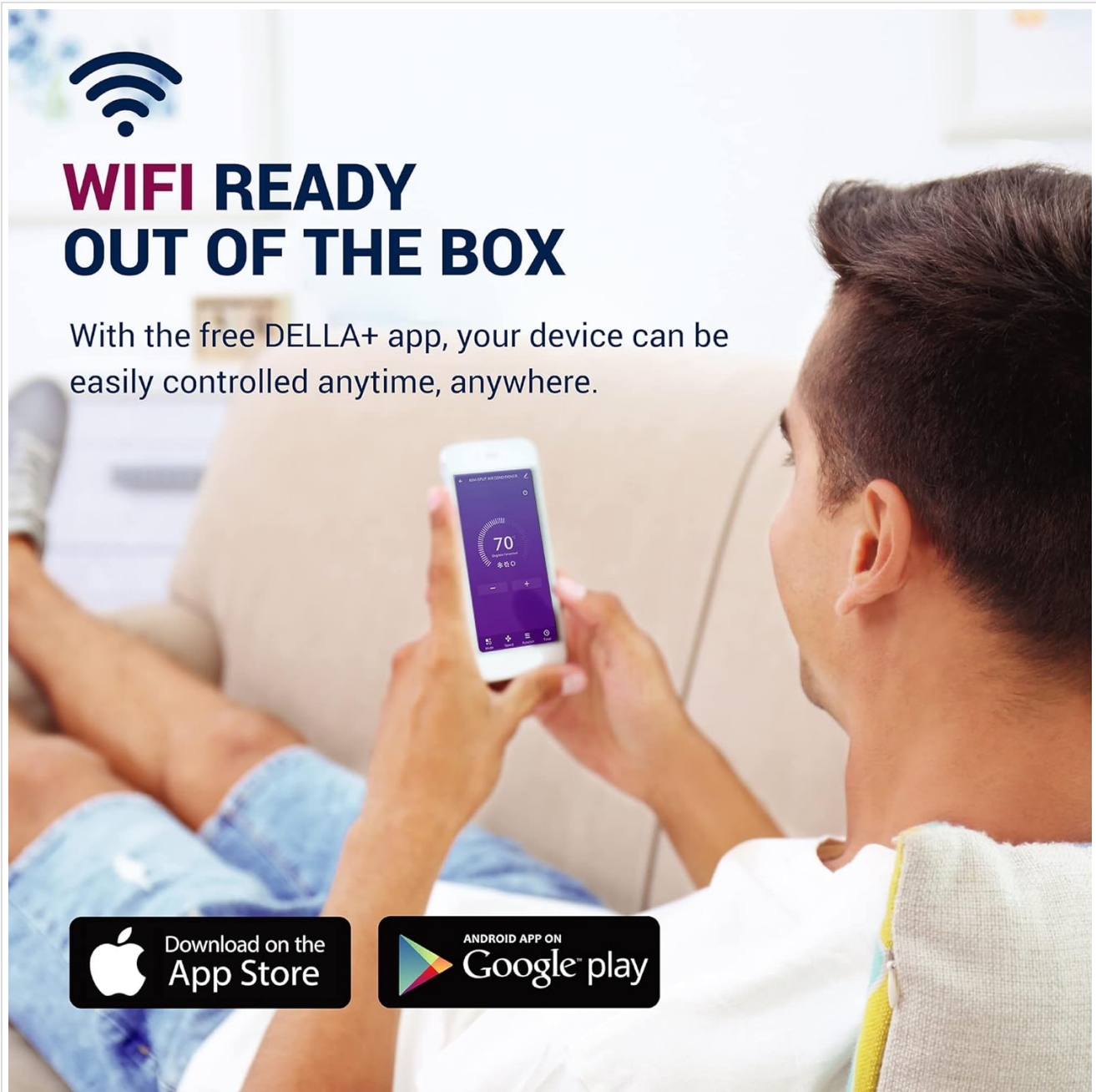
Figure 5.1: The DELLA+ app allows for convenient control of your unit from anywhere.