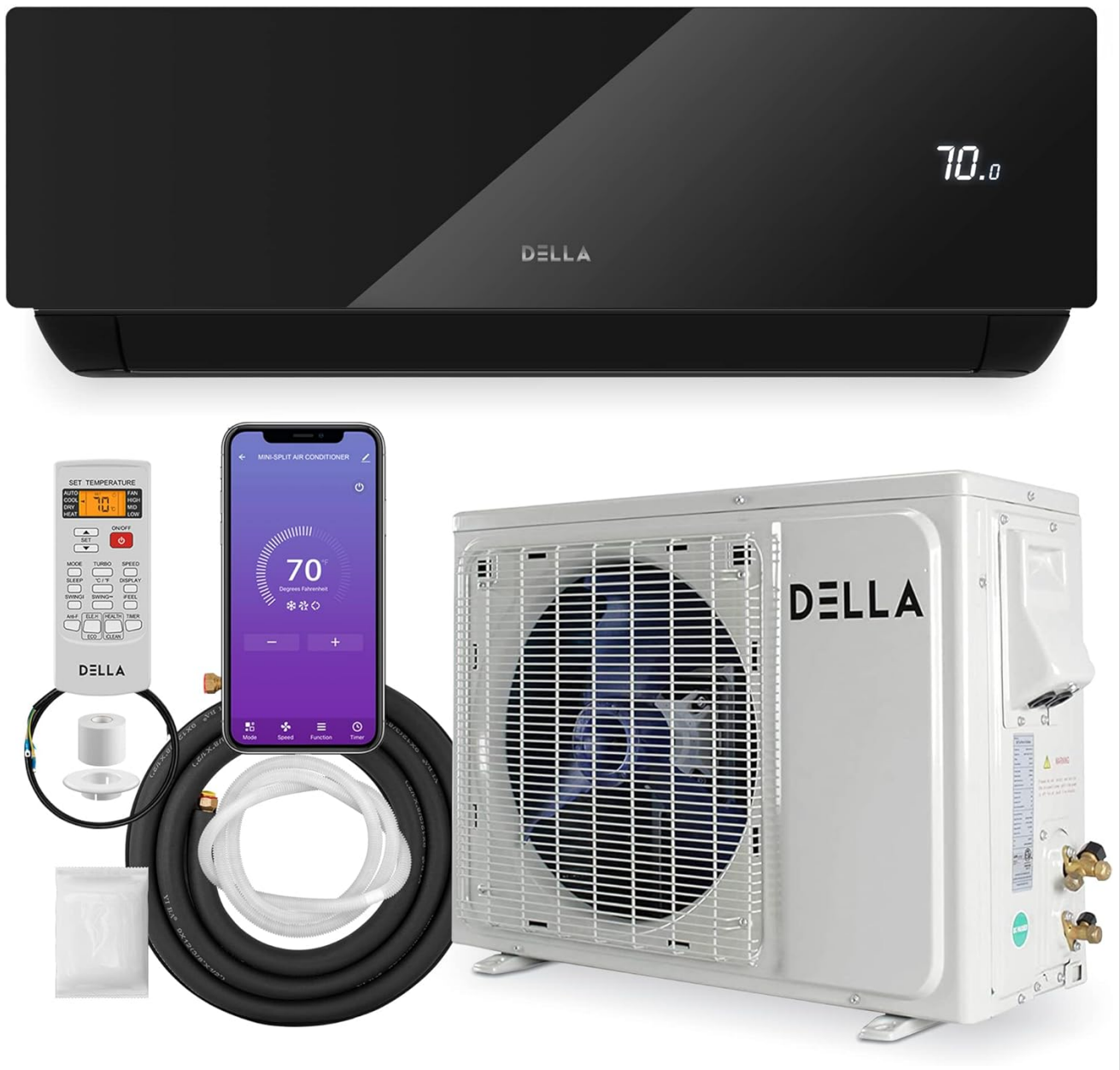
Figure 3.1: DELLA 18000 BTU Mini Split Air Conditioner and Heater components, including indoor unit, outdoor unit, remote control, and app interface.