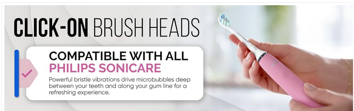
Image: A hand demonstrating how to attach a click-on brush head to the Philips Sonicare toothbrush handle.

Align the brush head with the metal shaft on the toothbrush handle and push it down firmly until it clicks into place.