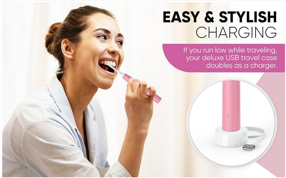
Image: Philips Sonicare DiamondClean toothbrush handle placed on its wireless charging base for charging.