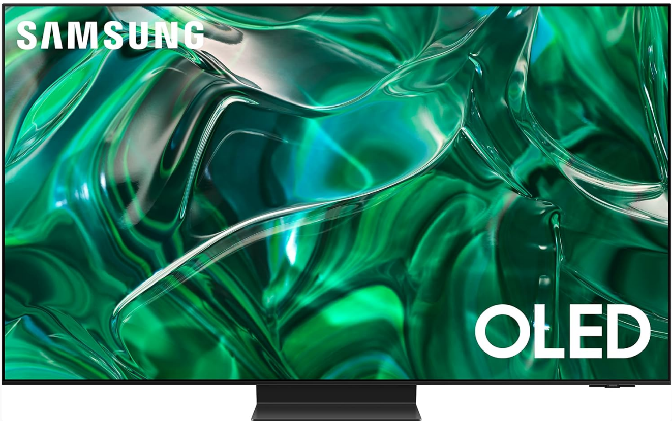
Front view of the Samsung 55-Inch Class OLED 4K S95C Series Smart TV.