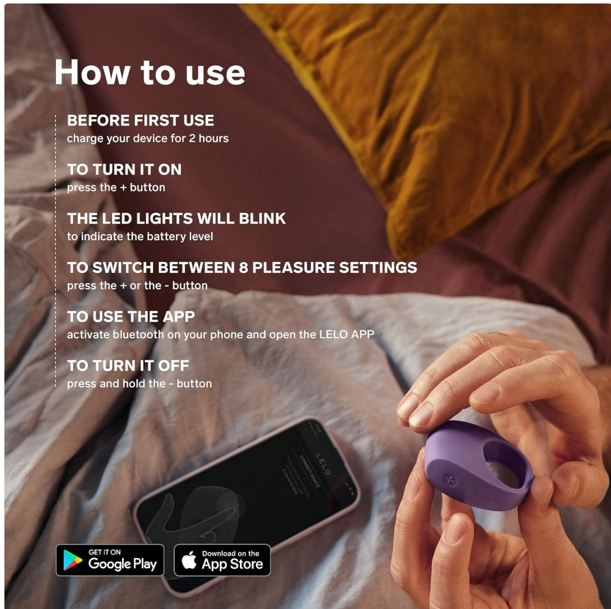
Figure 4: LELO TOR 3 Usage Guide

Once connected via Bluetooth, the LELO app provides additional control over vibration patterns and intensities, allowing for a customized experience. Refer to the app's interface for detailed options.