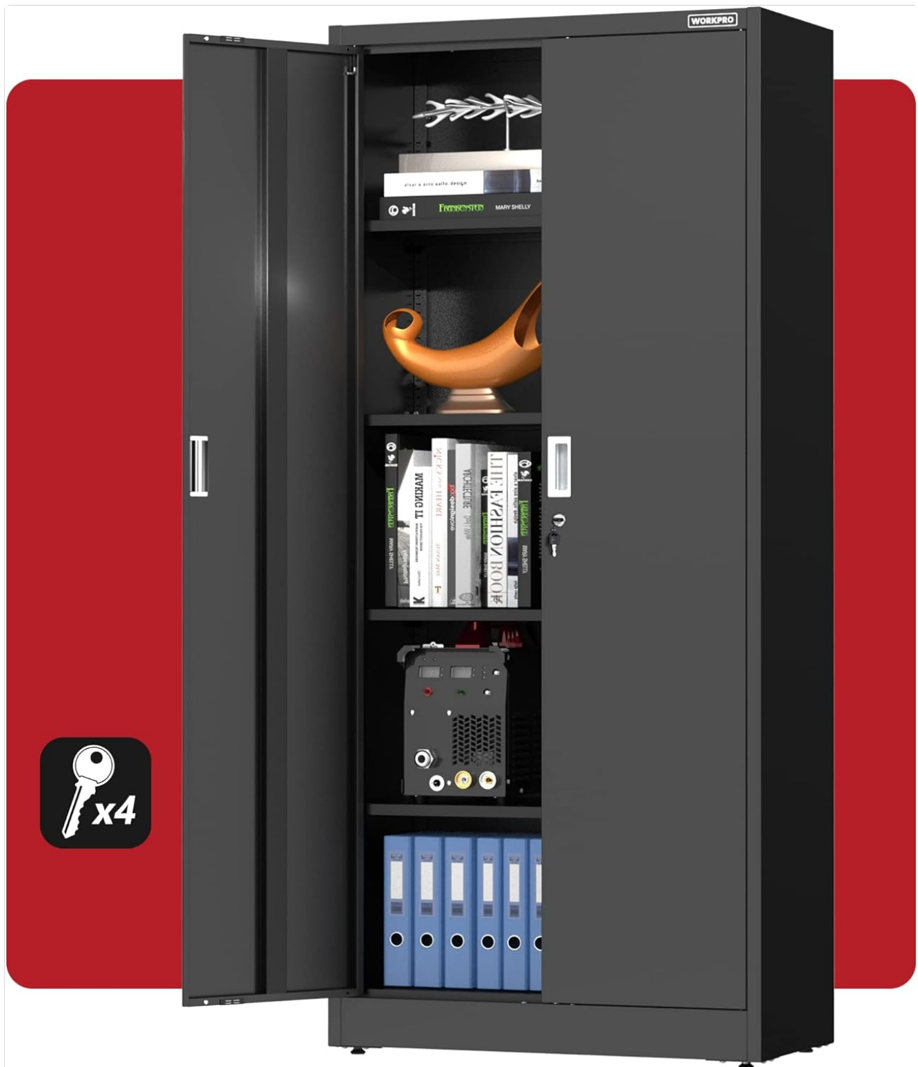
Figure 1: WORKPRO Storage Cabinet with doors open, displaying its spacious interior and included keys.