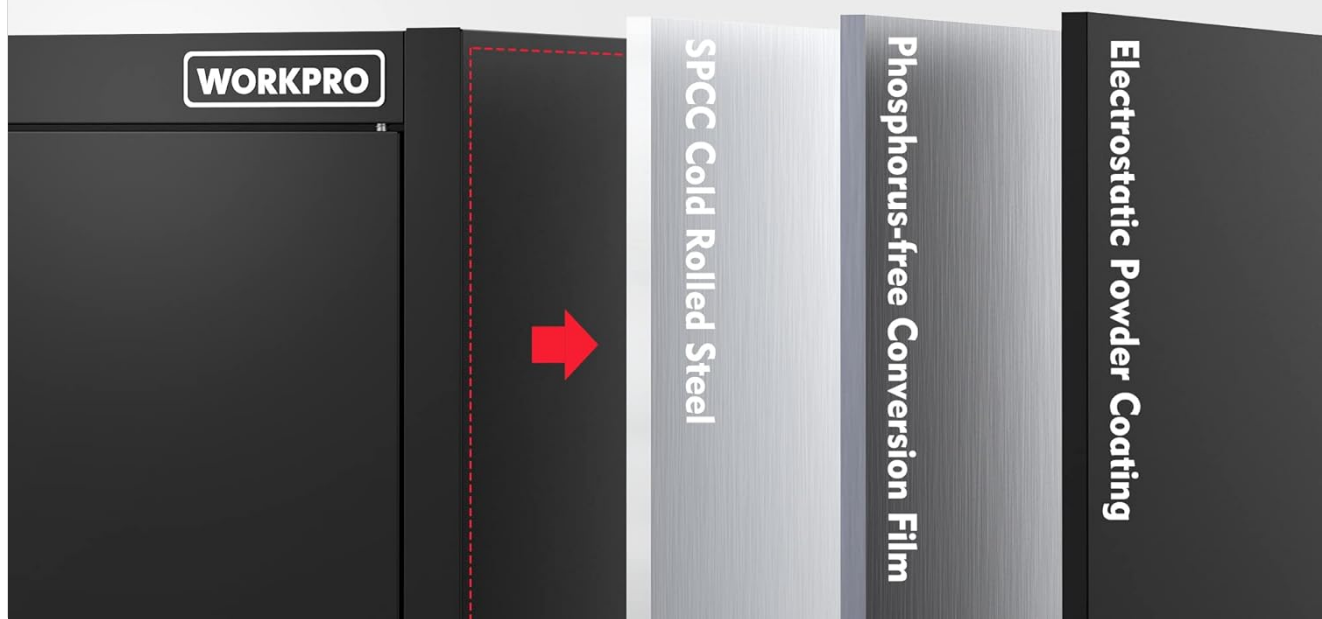
Figure 5: The cabinet's construction features durable SPCC cold rolled steel with a protective powder coating.