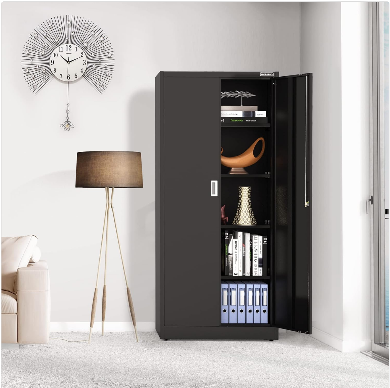
Figure 4: The enhanced locking system ensures the security of your stored items.