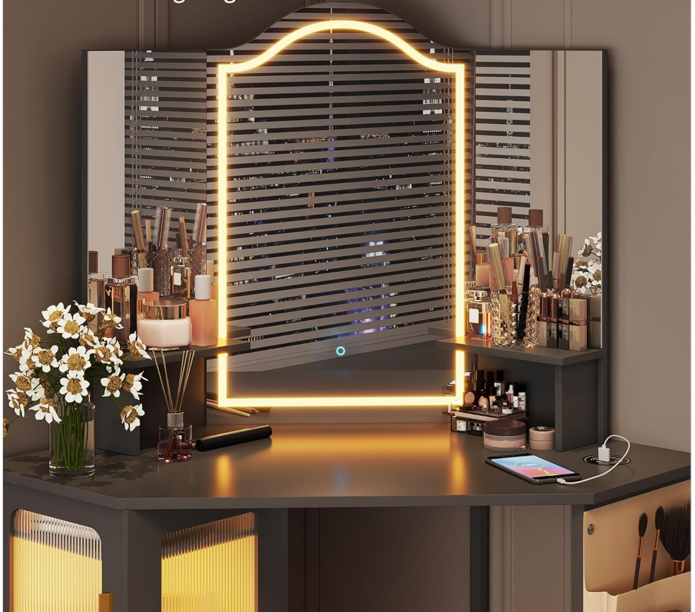
Image: Overview of the LVSOMT Corner Makeup Vanity Desk with labeled components and dimensions.