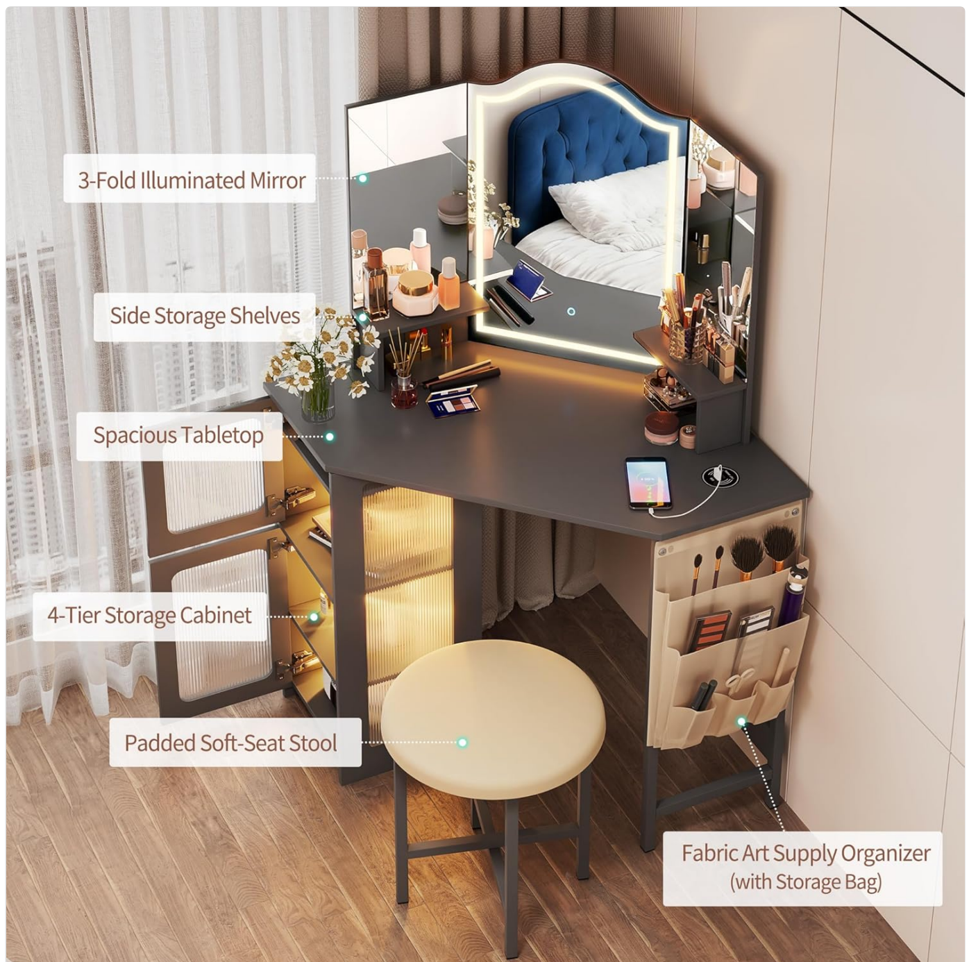
Image: The integrated 3-in-1 charging station, highlighting wireless, USB, and Type-C charging capabilities.