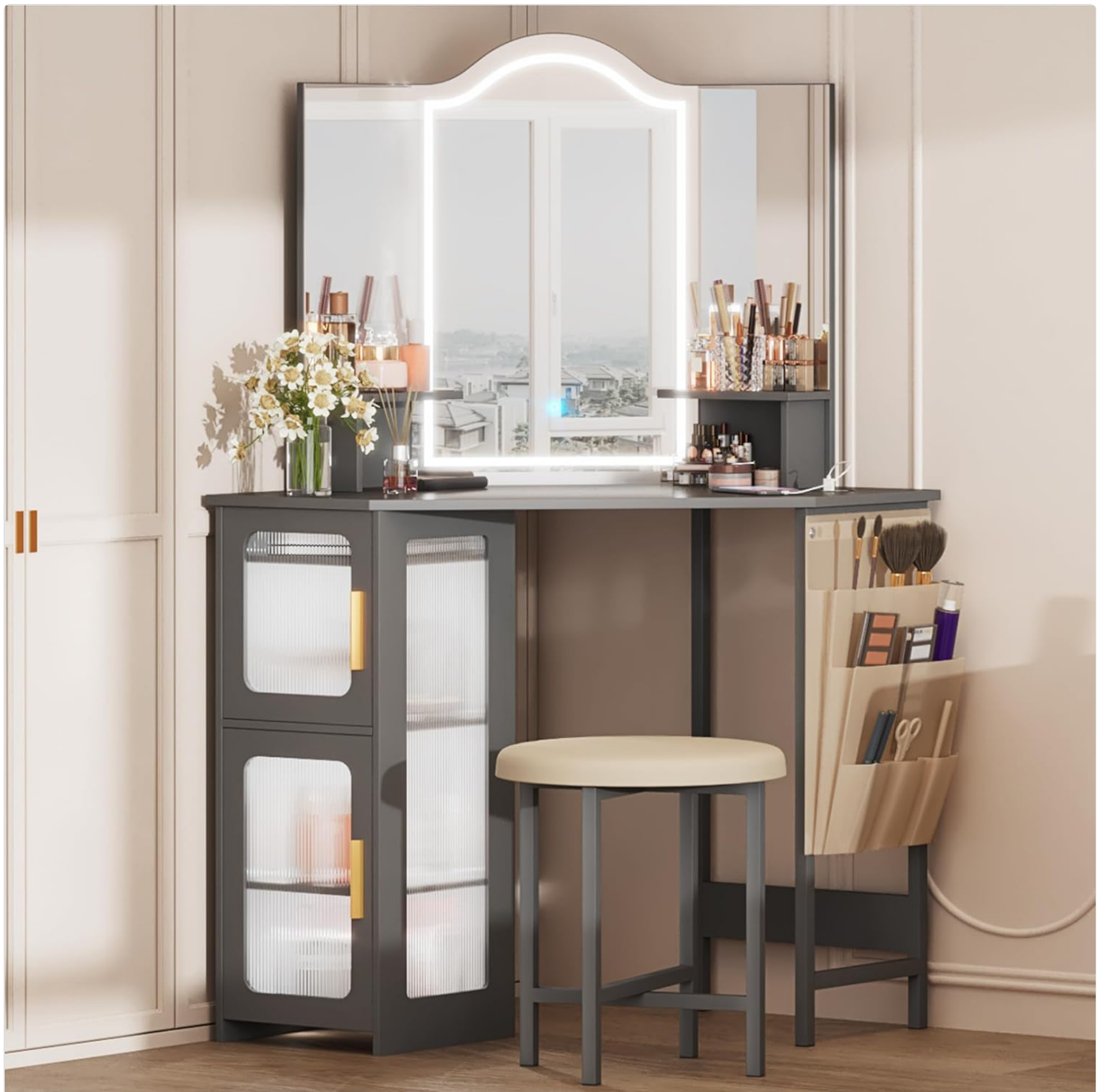
Image: The vanity desk showcasing its 4-layer storage cabinet with clear doors and the multi-pocket cloth storage bag.