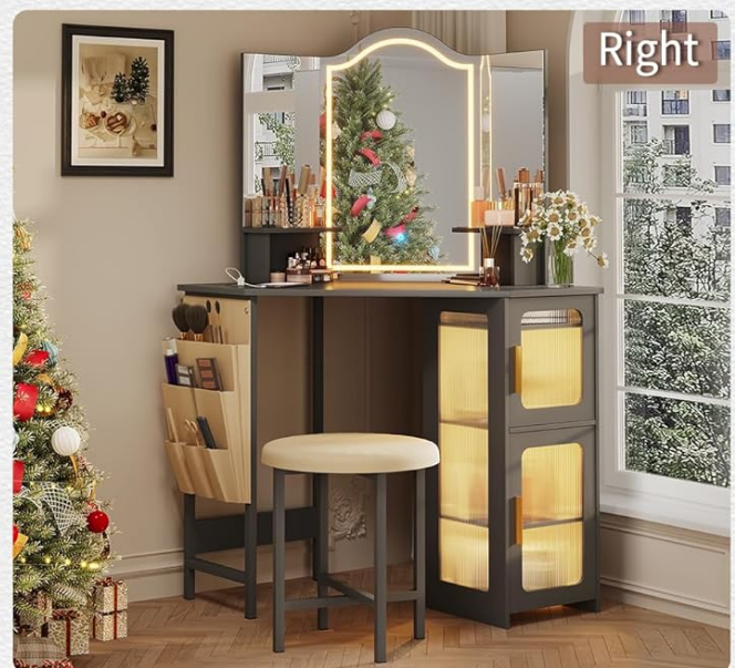
Image: The vanity mirror displaying its three adjustable light modes: Cool Light, Warm Light, and Blue Light.