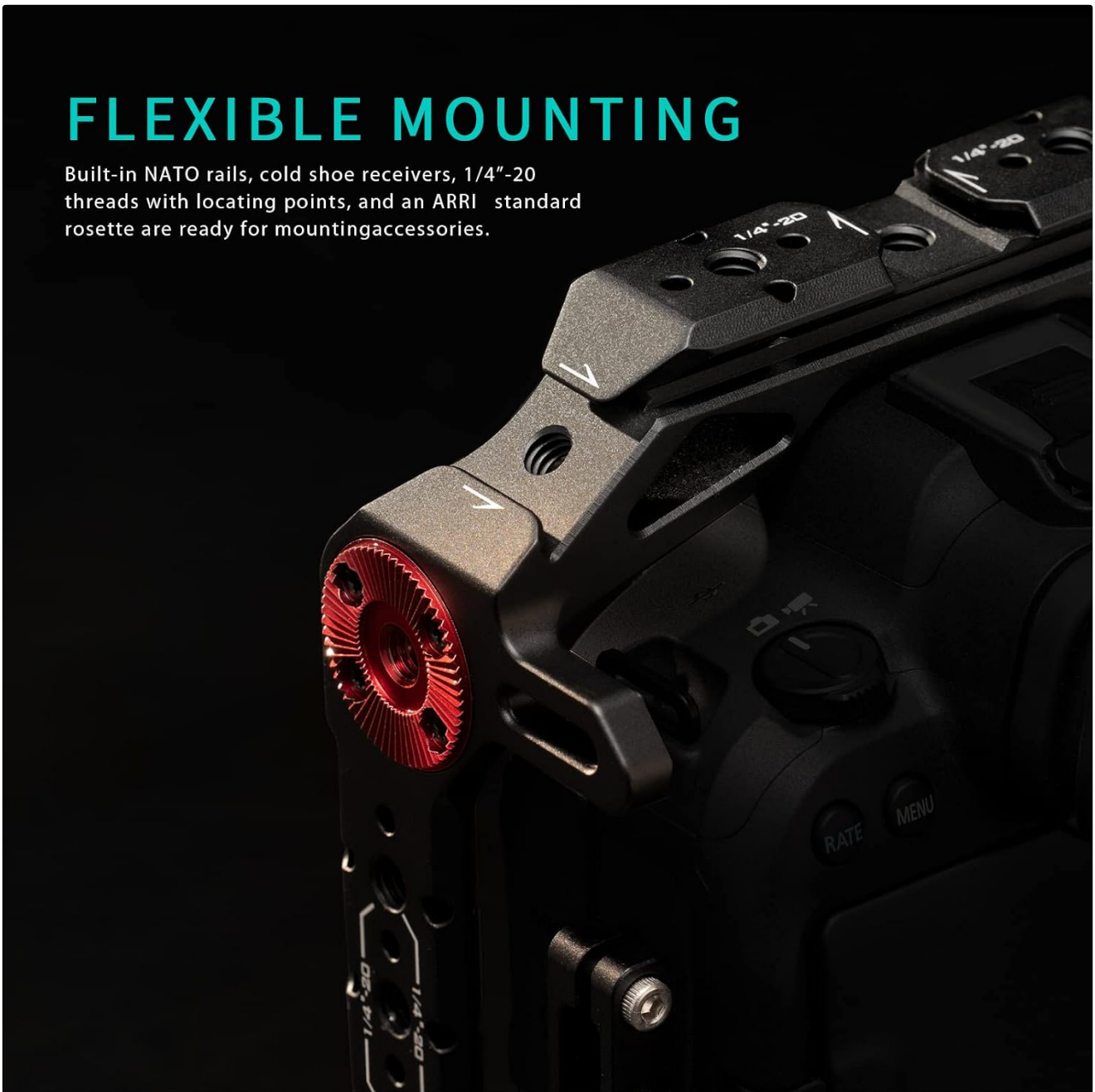
Image: A detailed view of the cage's flexible mounting options, including NATO rails, 1/4"-20 threads, and an ARRI rosette.

Built-in NATO rails, cold shoe receivers, 1/4"-20 threads with locating points, and an ARRI standard rosette are ready for mounting accessories.