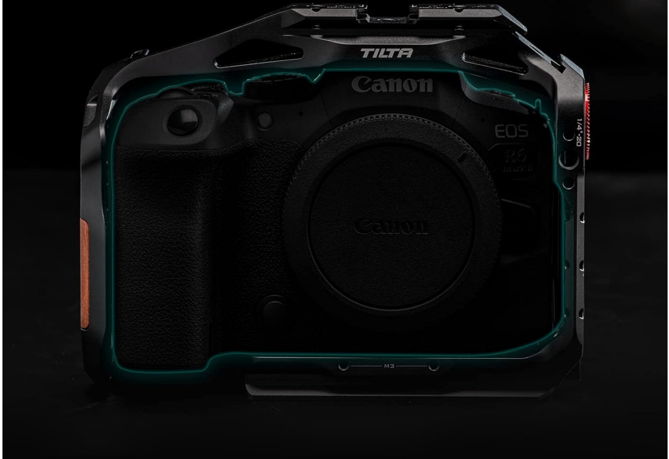
Image: The Tilta Full Camera Cage enclosing a Canon R6 Mark II, illustrating its protective design.

Provides all-around protection to the camera body. Ready for expansion.