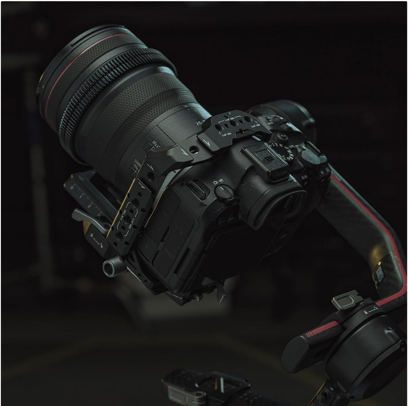
Image: The Tilta Full Camera Cage with a Canon R6 Mark II mounted on a gimbal, demonstrating its compatibility.