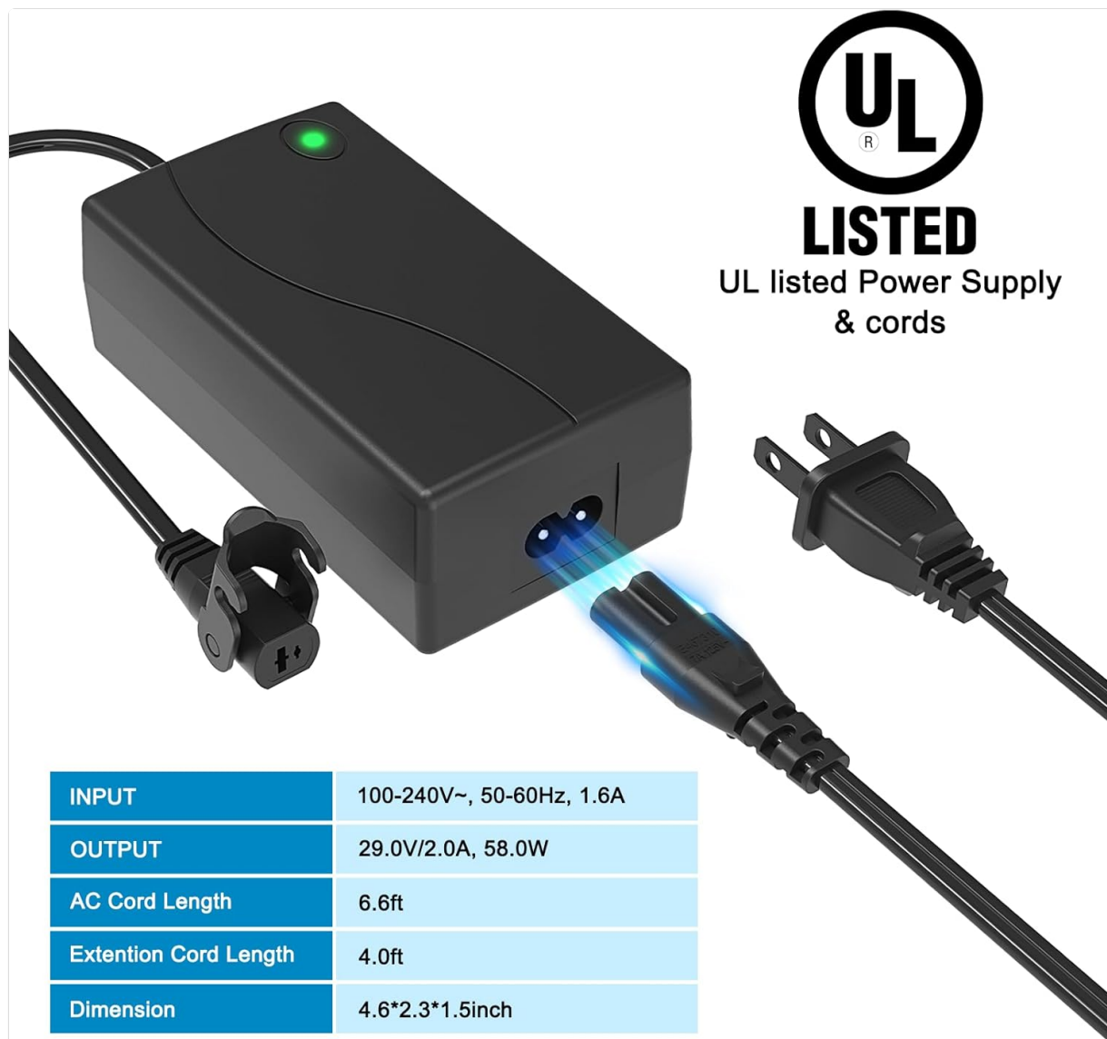
Image: The power supply unit is displayed alongside a table detailing its technical specifications, including input/output voltage and current, and physical dimensions.