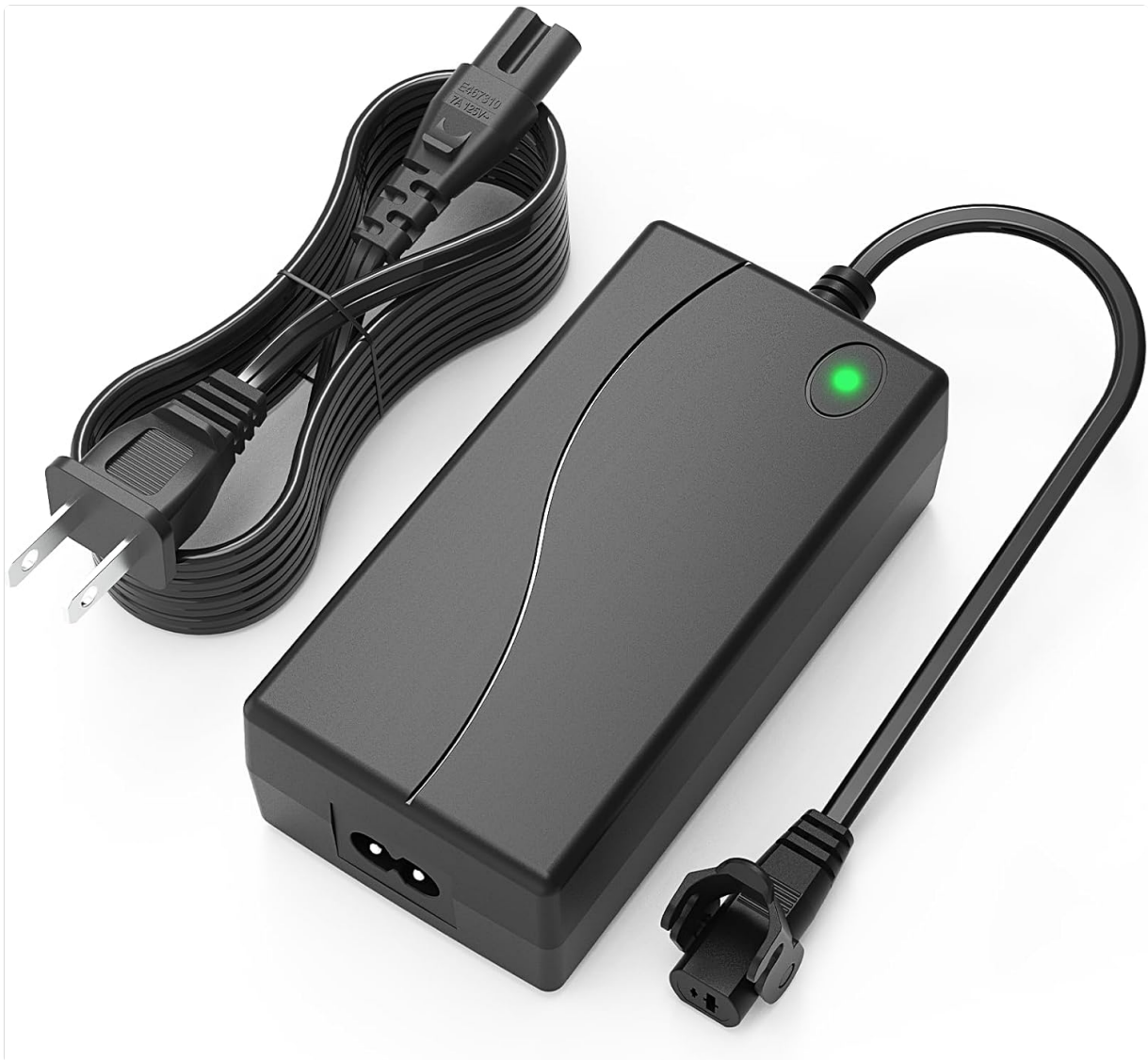
Image: The MineCtrl ZB-H290020-A power supply unit shown with its accompanying detachable AC power cord.