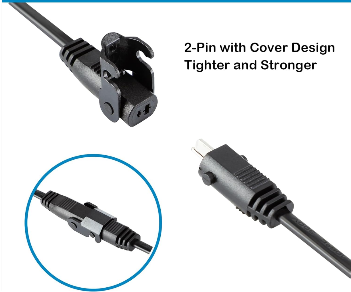
Image: Detail of the 2-pin flat round connector, highlighting its secure cover design for a stable connection.