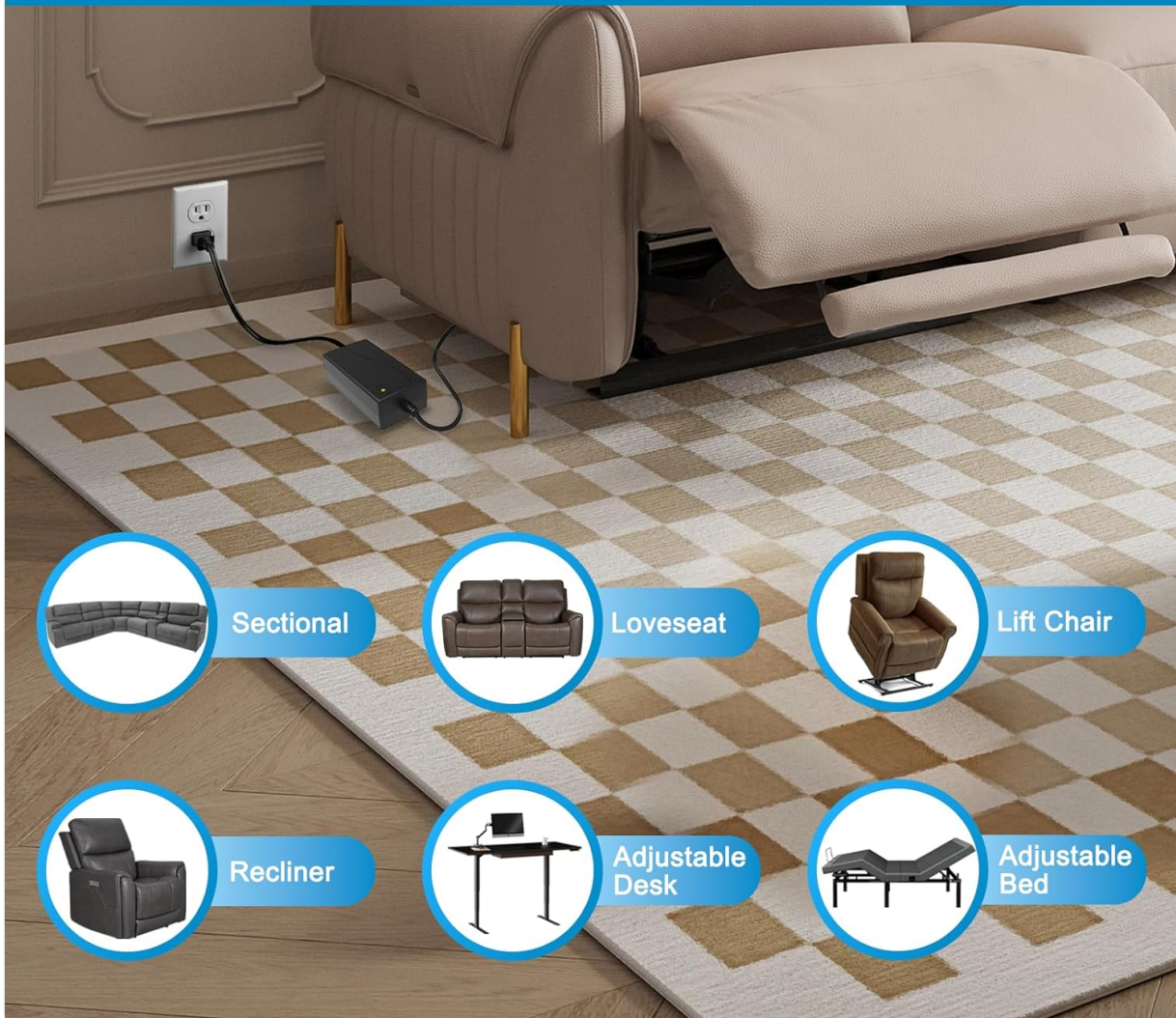
Image: Illustration showing the wide range of reclining and adjustable furniture compatible with the power supply, including recliners, loveseats, lift chairs, adjustable desks, and beds.