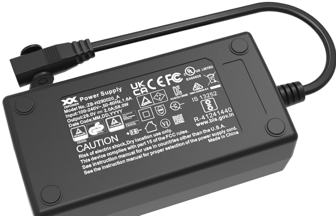
Image: The power supply features multiple protection mechanisms including over-load, over-current, over-voltage, over-heat, and short-circuit protection, indicated by corresponding icons.