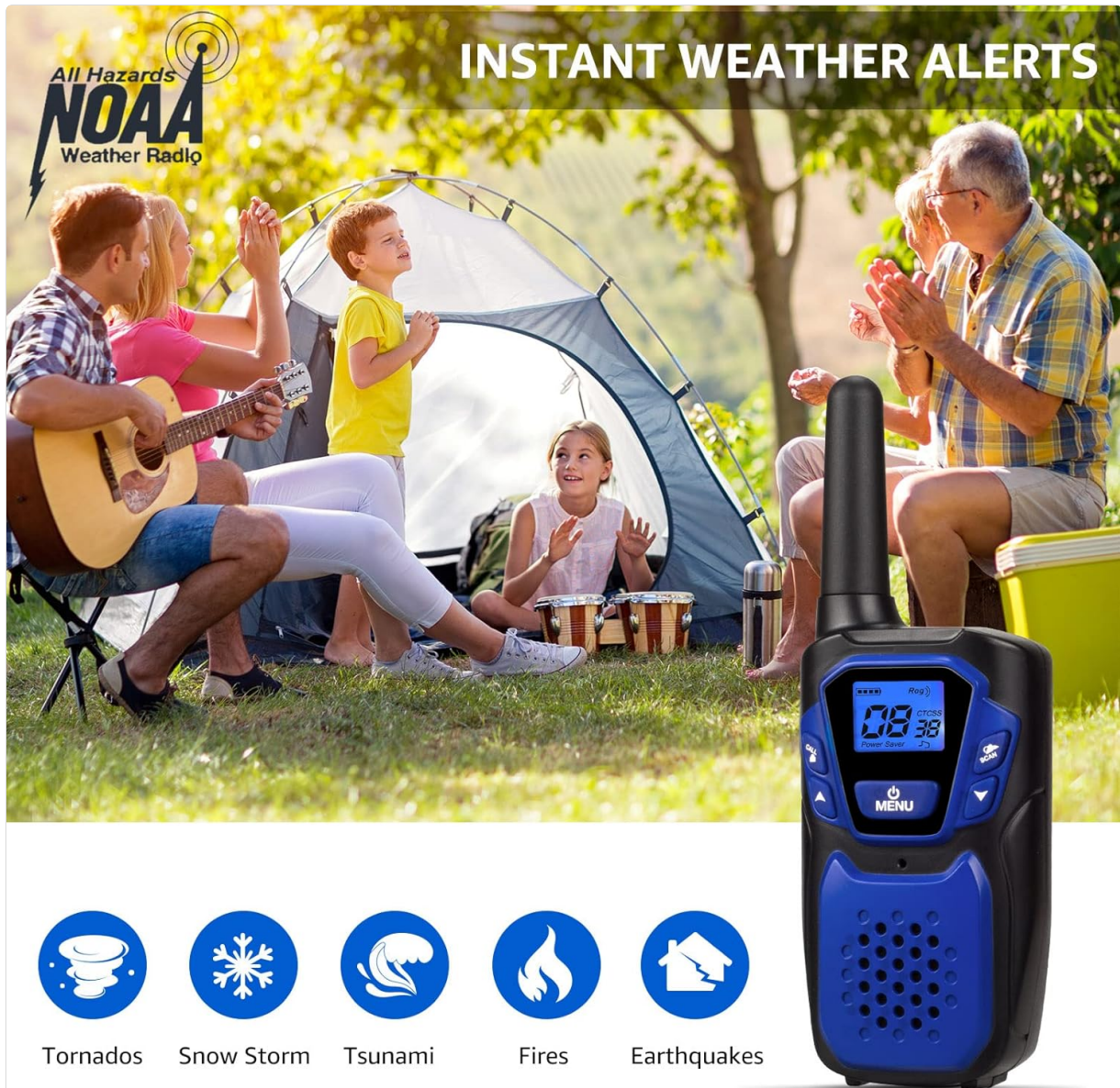
Figure 3: NOAA Weather Alert feature for outdoor safety.

The NOAA Weather Scan feature automatically scans through 25 available weather (WX) band channels and locks onto the strongest weather channel to alert you of severe weather updates. NOAA Weather Alert will sound an alarm indicating a risk of severe weather in your area. To activate, press and hold the W/A button.