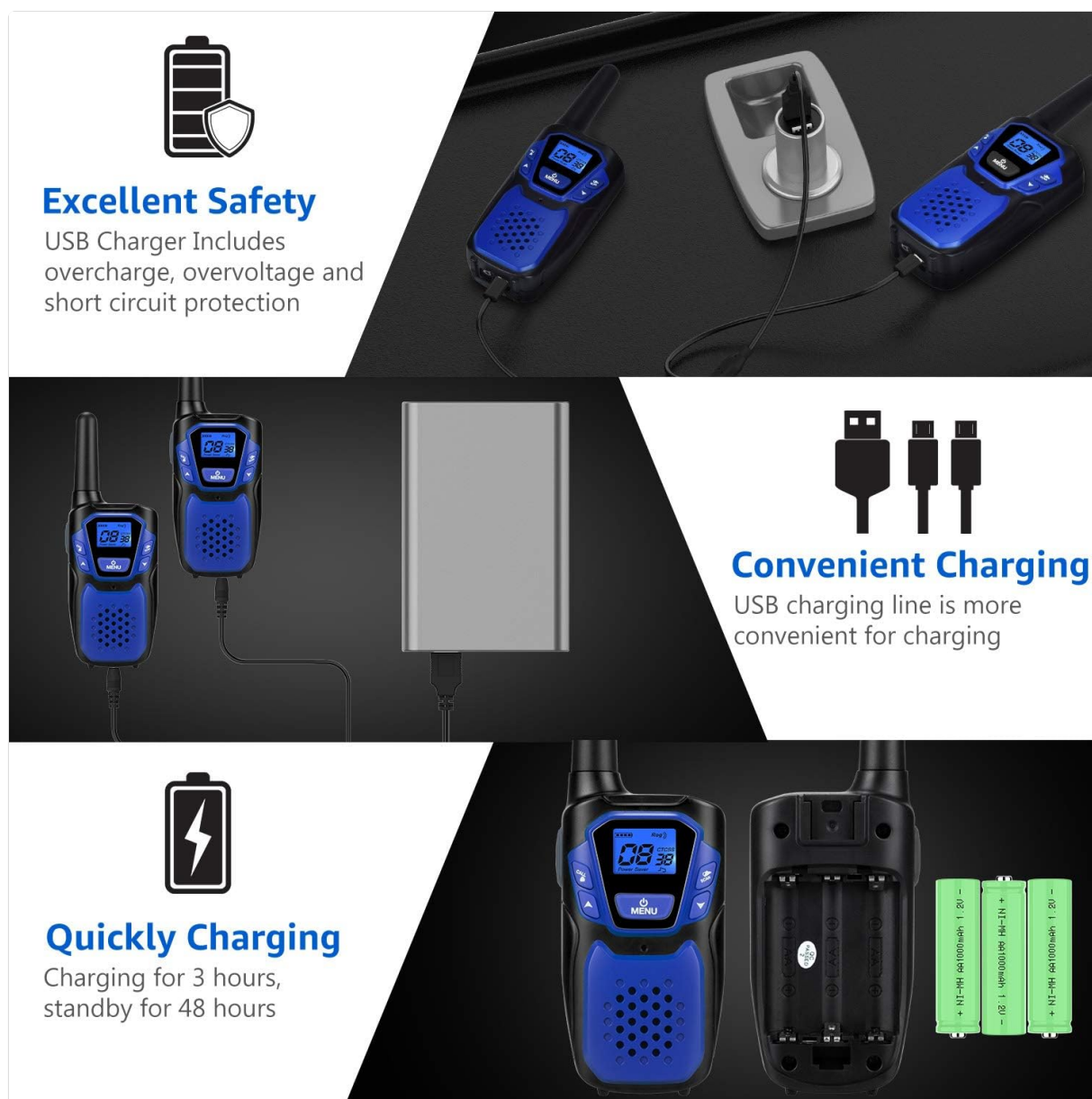
Figure 2: Convenient USB charging and battery compartment access.