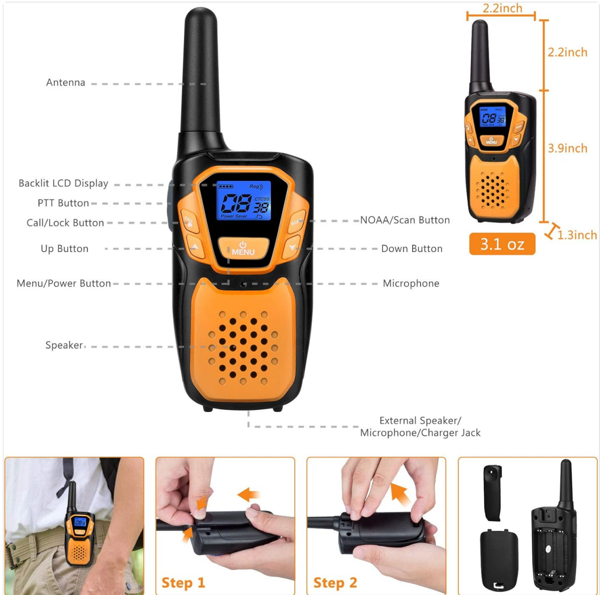
Figure 4: Key controls and features of the Topsung M920b.

A built-in LED flashlight is located at the top of the radio. To activate, briefly press the Light button (often combined with the W/A button). Press again to turn off.