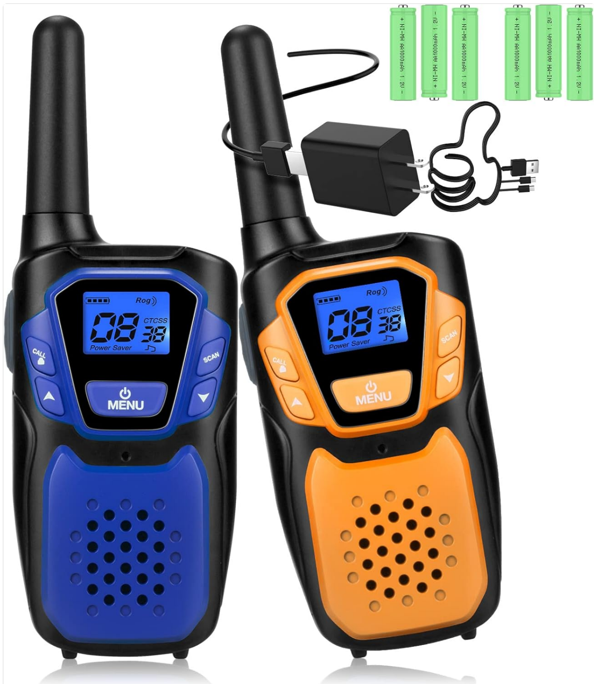
Figure 1: Topsung M920b Walkie Talkies (Blue and Orange) with accessories.