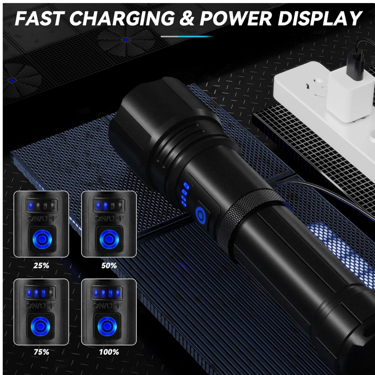
Image: The flashlight connected to a USB power source, illustrating the power display with four blue indicator lights showing the battery charge level.