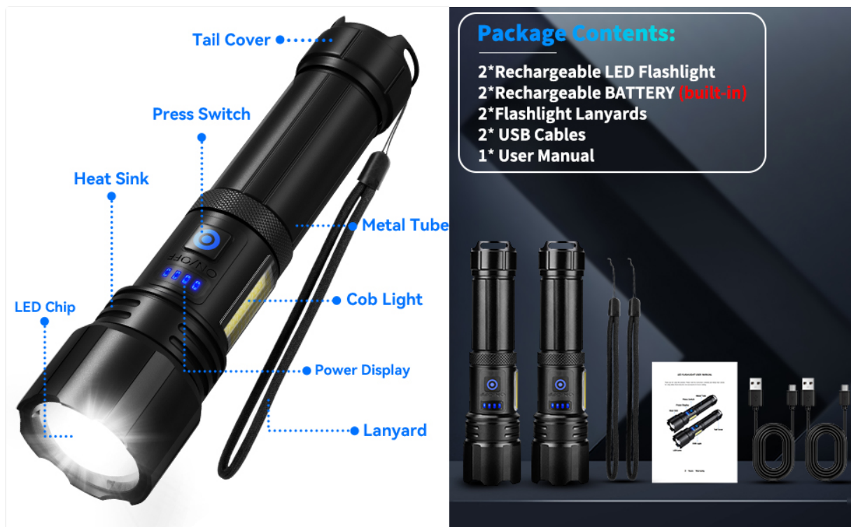
Image: A detailed diagram highlighting the components of the flashlight (LED chip, heat sink, press switch, metal tube, COB light, power display, lanyard, tail cover) and a separate image showing the complete package contents.