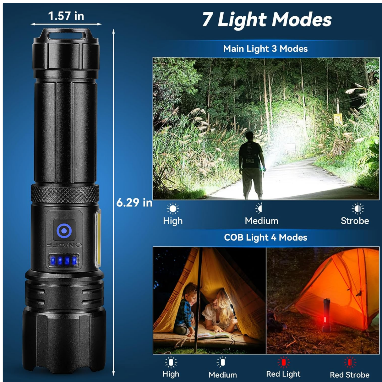
Image: A visual guide to the flashlight's 7 light modes, showing the main beam options and the COB sidelight options, along with instructions for switching between them.