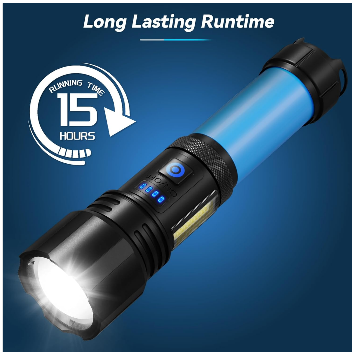
Image: A visual representation of the flashlight's long-lasting runtime, indicating up to 15 hours of operation on a single charge.