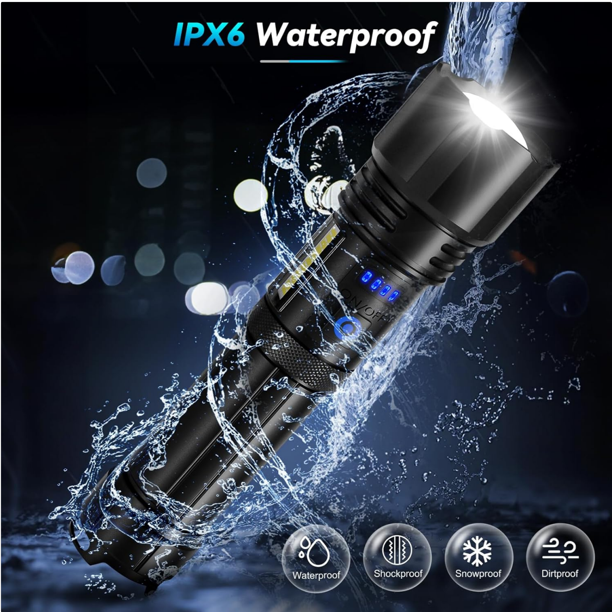
Image: The flashlight being tested under water splashes, highlighting its IPX6 waterproof capability and robust construction.