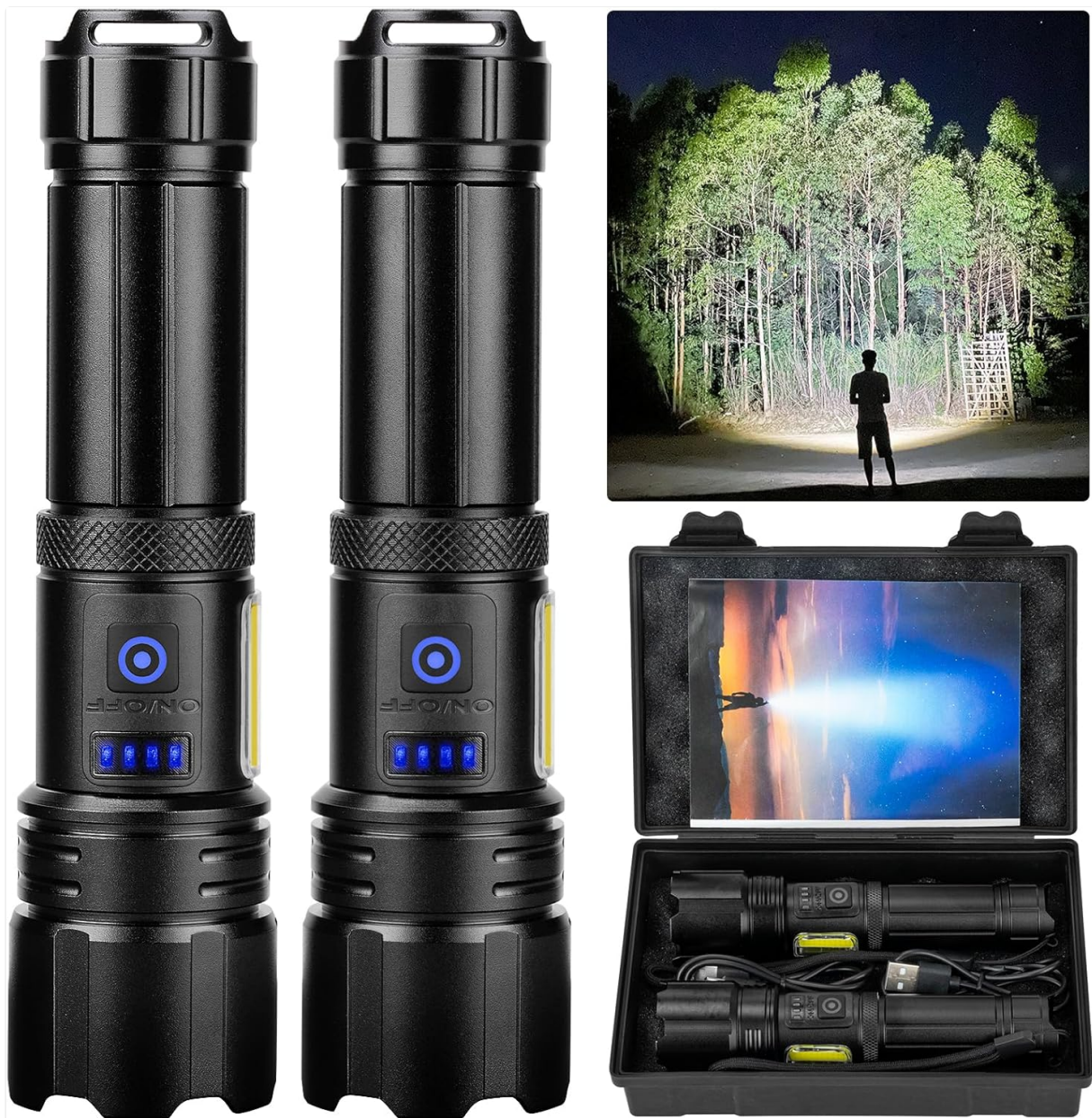
Image: Two Sigoobal LED rechargeable flashlights, one demonstrating its powerful beam in a dark forest, alongside the product packaging containing two flashlights, USB cables, and lanyards.