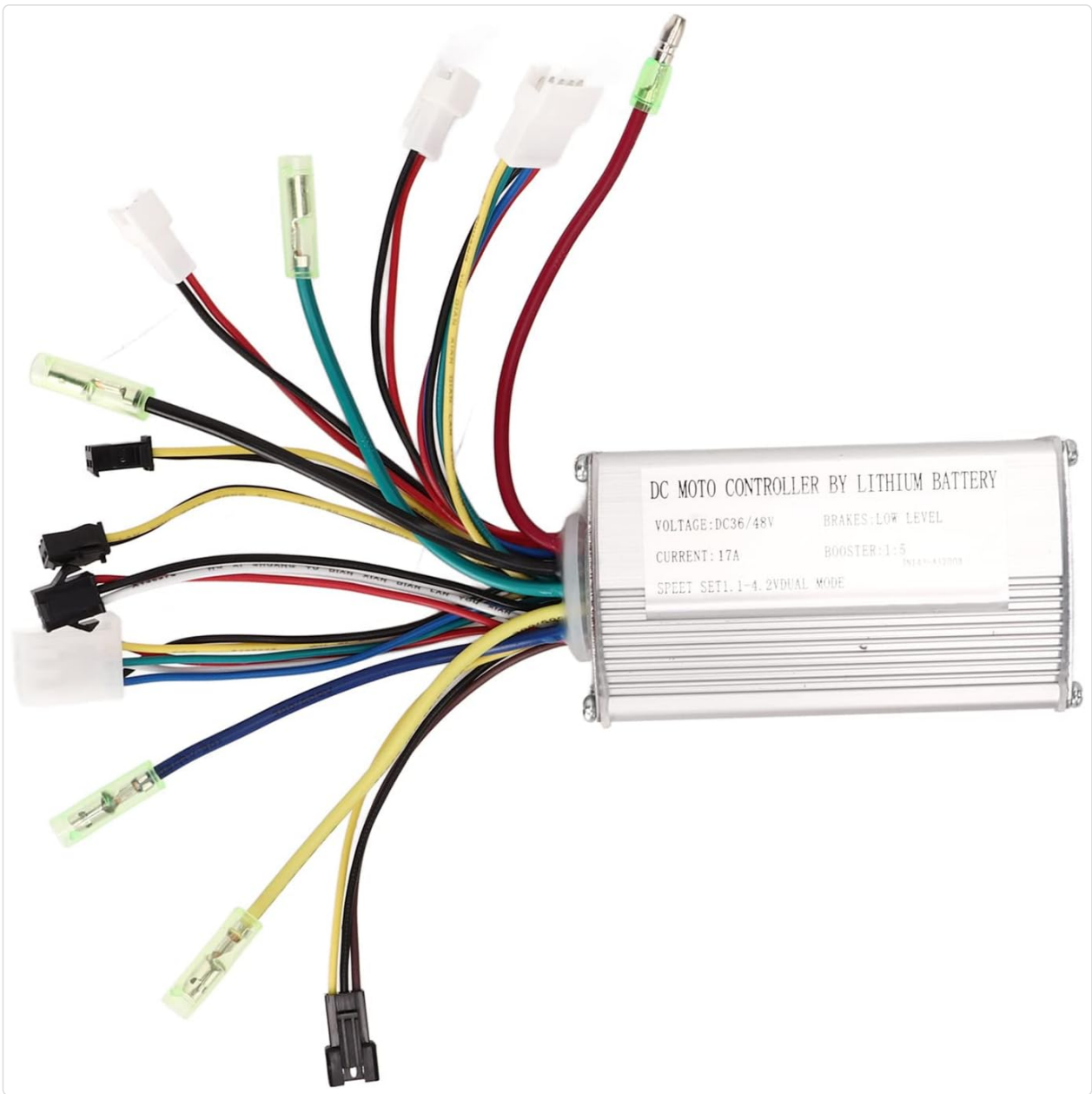
Figure 3.2: The Keenso DC Motor Controller with an overlay listing its key features, including 36V/48V compatibility, 250-350W motor applicability, groove design for heat dissipation, aluminum alloy shell, and standard wiring.