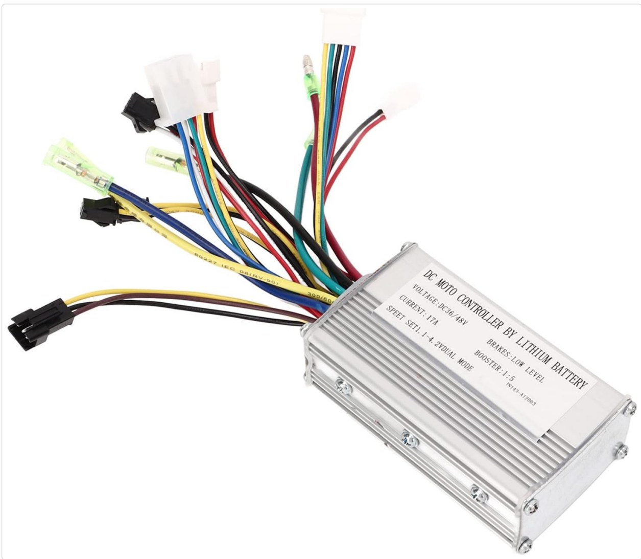
Figure 3.1: Front view of the Keenso DC Motor Controller, showing the main unit and various colored wire harnesses extending from one end.