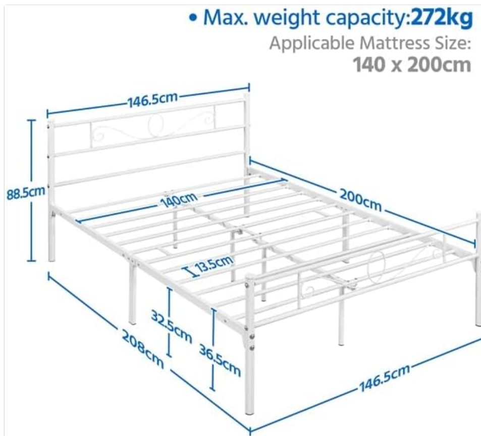
Figure 5: Dimensional diagram of the bed frame, indicating compatibility with a 140x200cm mattress and a maximum weight capacity of 272kg.

The bed frame offers 32.5 cm of clearance underneath, providing additional storage space for items like shoes or suitcases.