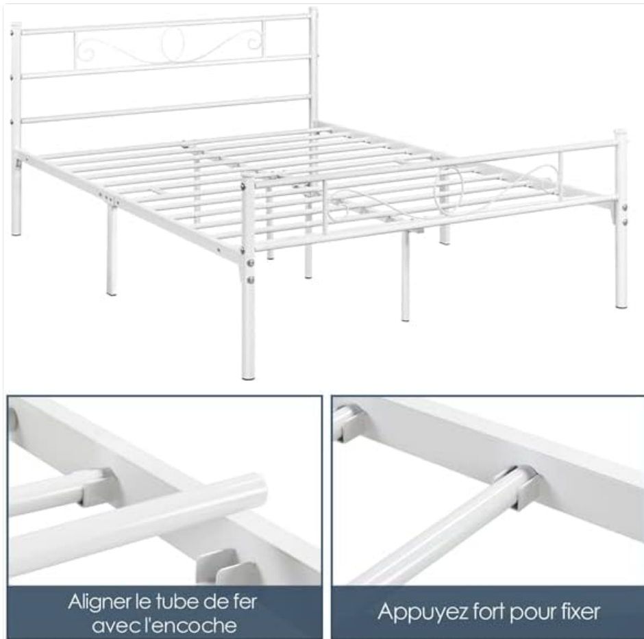
Figure 4: L-plate fixation for enhanced stability of the bed frame.