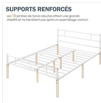
Figure 2: Illustration of reinforced supports, highlighting the 10 robust legs for stability.