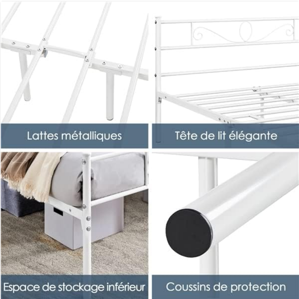
Figure 7: Detail of the anti-slip protection pads located at the base of the bed legs.