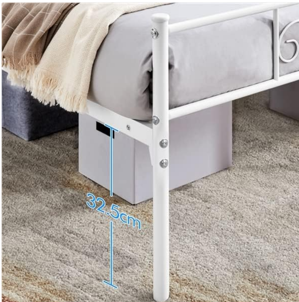
Figure 6: View of the under-bed storage space, demonstrating its utility for storing boxes or other items.

The bed frame offers 32.5 cm of clearance underneath, providing additional storage space for items like shoes or suitcases.