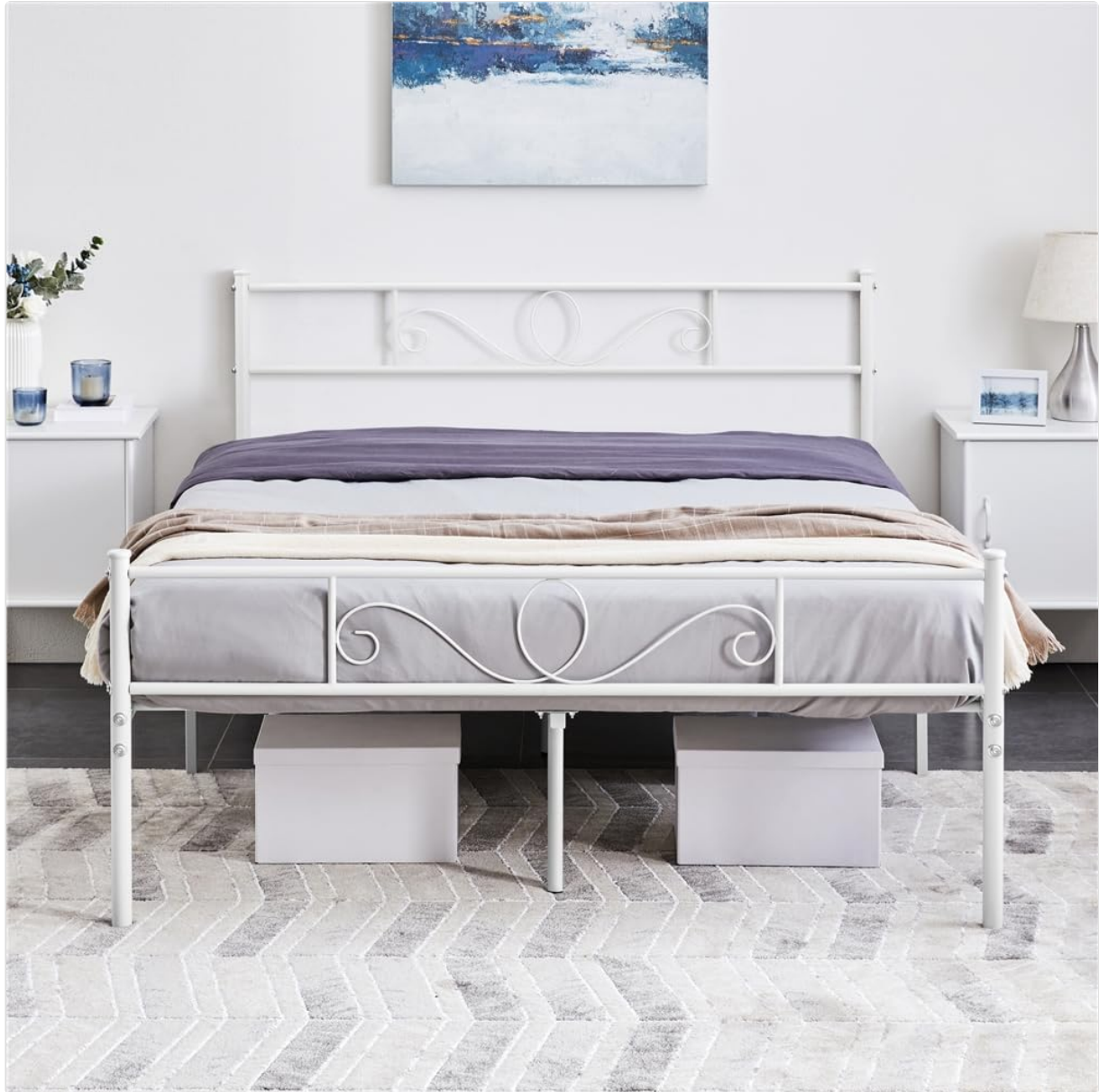
Figure 1: Fully assembled bed frame, showing headboard and footboard design.

Attach the side rails to the headboard and footboard using the provided bolts and Allen key. Ensure all connections are finger-tight before fully tightening.