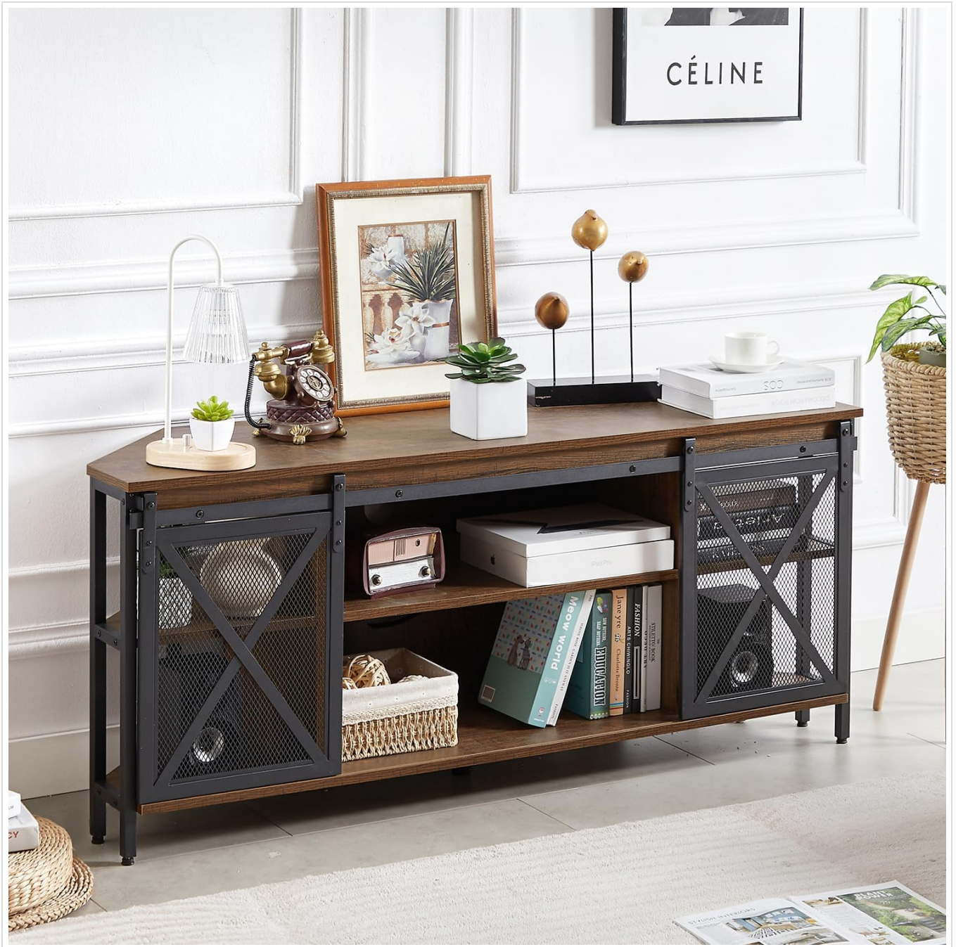
Figure 6: Storage Capacity. This image demonstrates the ample storage capacity of the TV stand, with books, baskets, and other items neatly organized on its shelves.