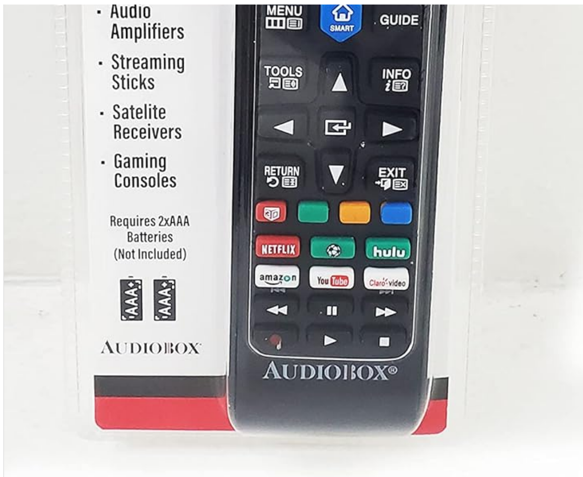
Image: The Audiobox Universal Smart Remote Control as it appears in its retail packaging, highlighting its 4-in-1 function and compatibility with various devices.