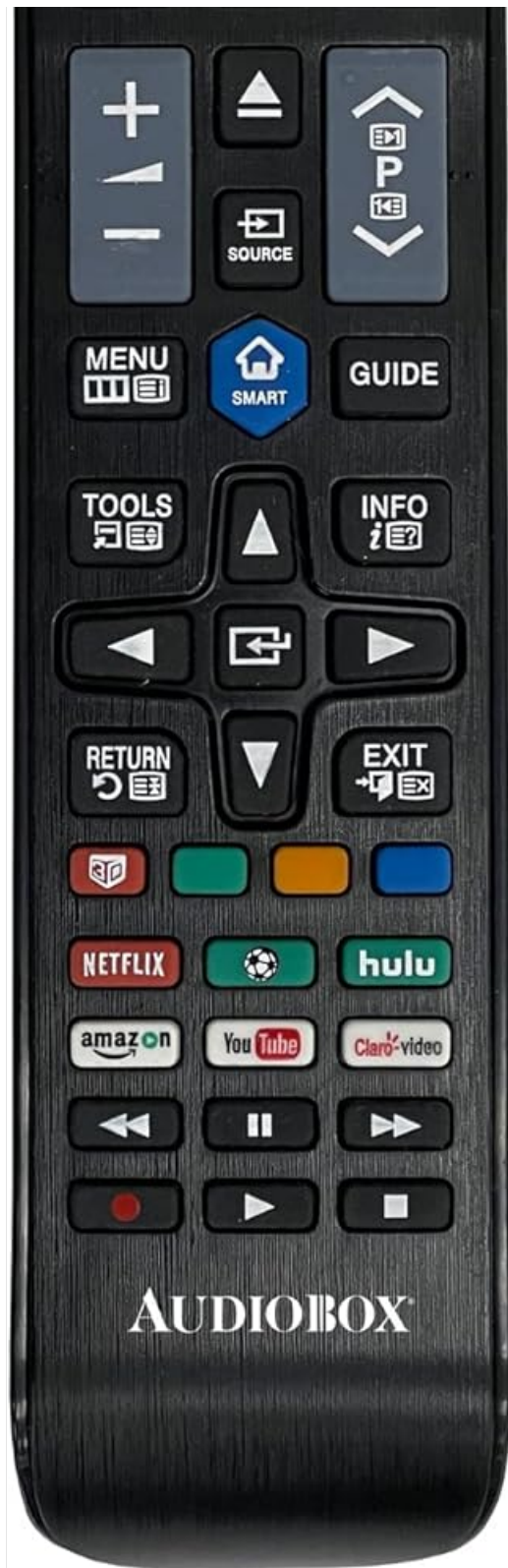
Image: Full view of the Audiobox Universal Smart Remote Control, showcasing its complete button layout.