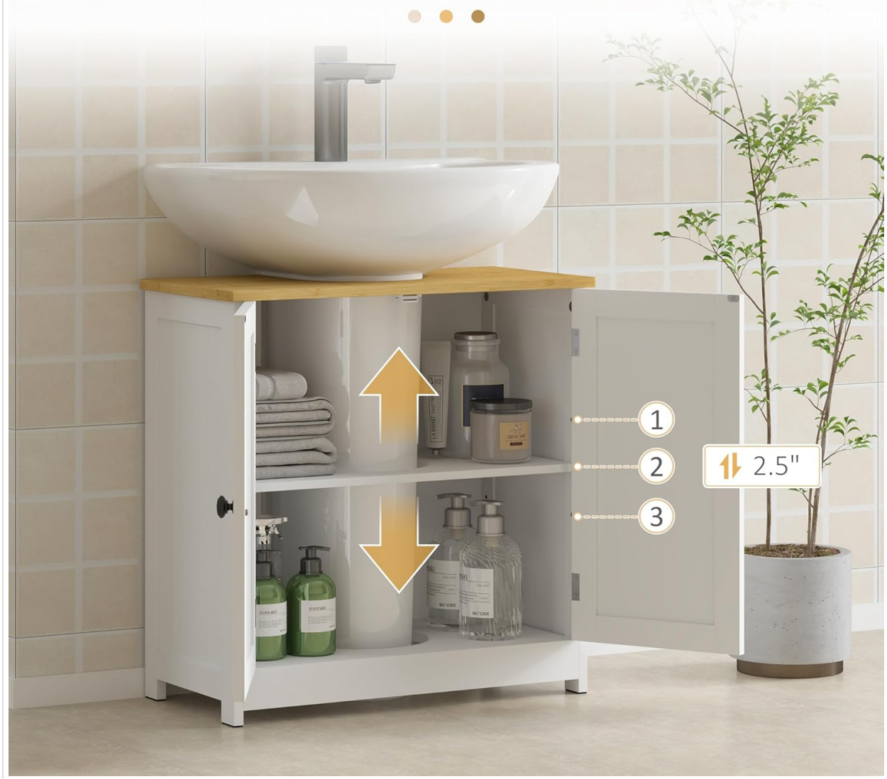
Figure 5.1: The adjustable shelf can be moved up or down to fit various item sizes.