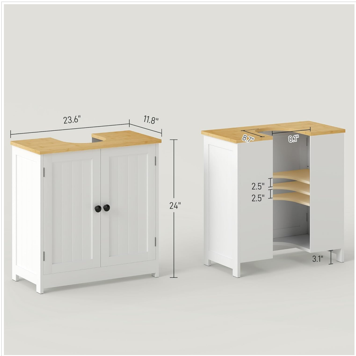
Figure 4.1: Cabinet dimensions and internal layout. Overall Dimensions: 23.5" W x 11.75" D x 24" H. "U" Cut-Out Dimensions: 8" W x 8.75" D.