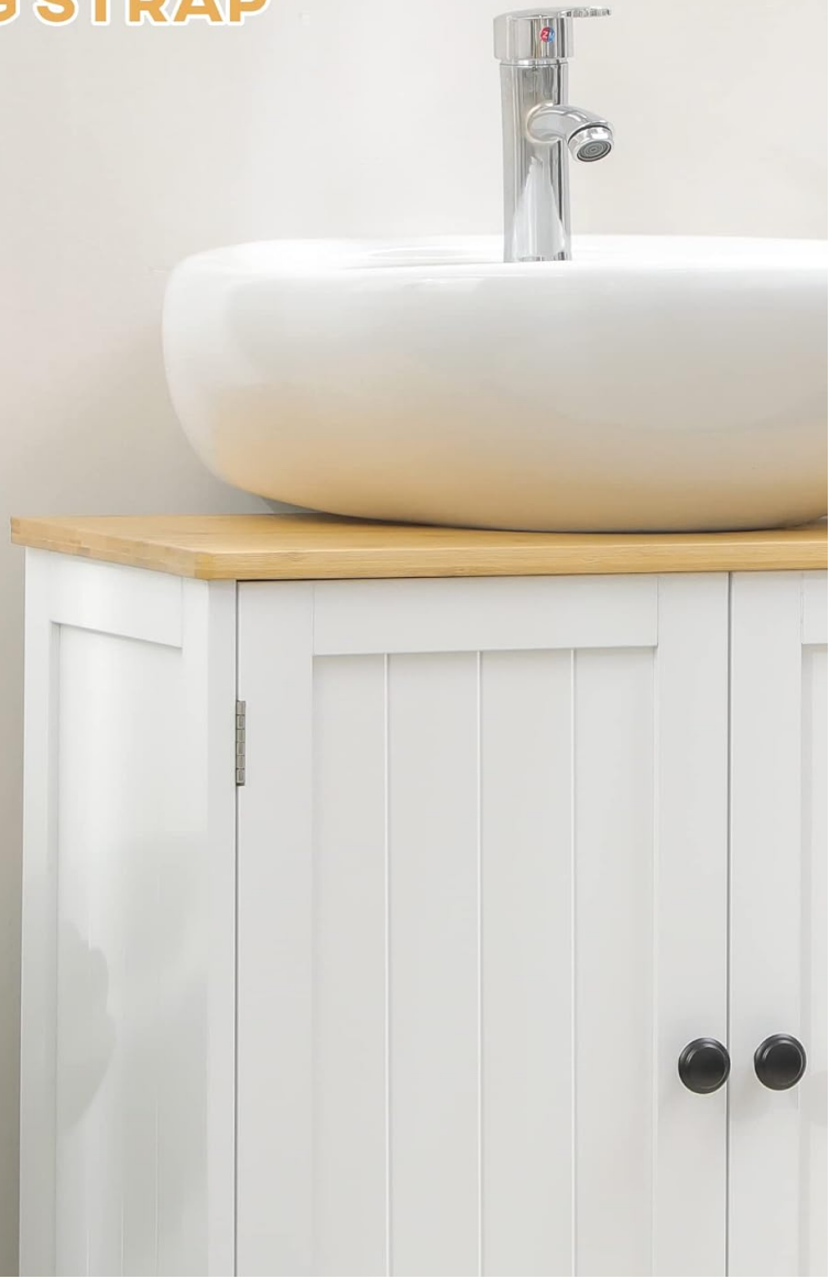
Figure 2.1: Anti-tipping strap installation for enhanced stability.