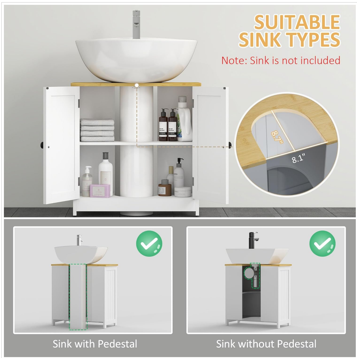
Figure 4.2: Compatibility with various sink types, including pedestal and wall-mount sinks.