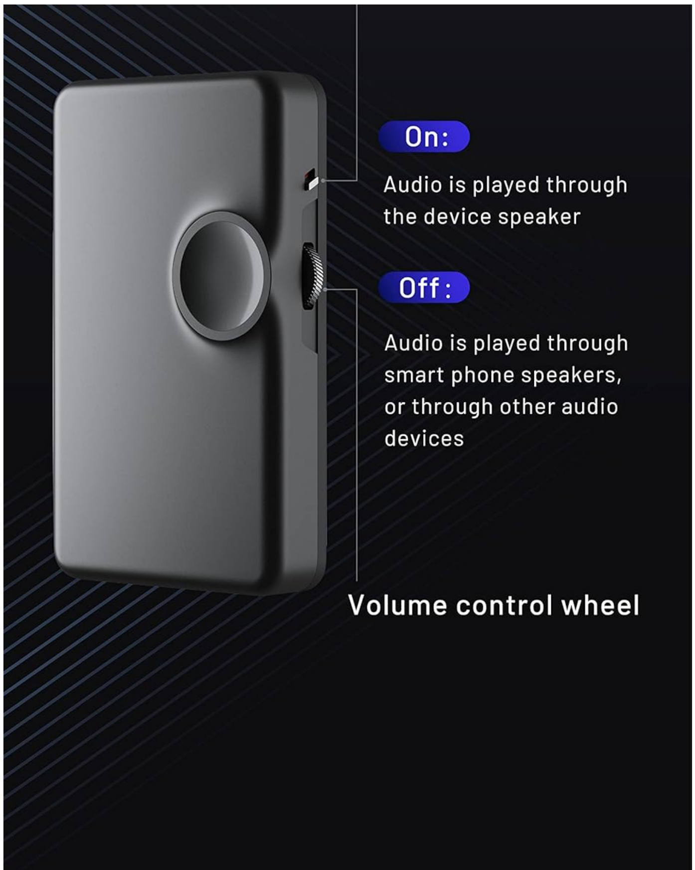
Figure 2: Audio Controls

This image shows the side of the adapter, pointing out the device speaker switch and the volume control wheel. The speaker switch allows users to toggle audio output between the adapter's internal speaker (if applicable) or external smart phone speakers/audio devices.