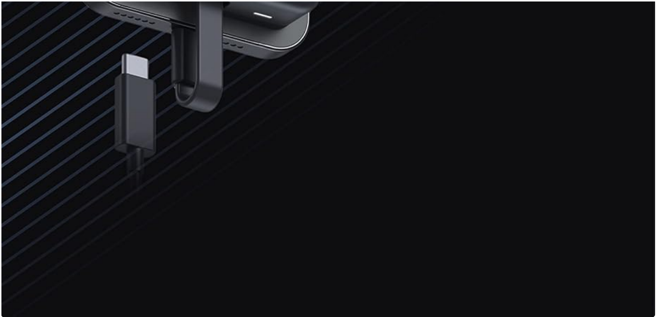
Figure 3: Magnetic Attachment

This image illustrates the MiraScreen Portable Adapter magnetically attached to the rear of a smartphone, demonstrating the secure connection method.