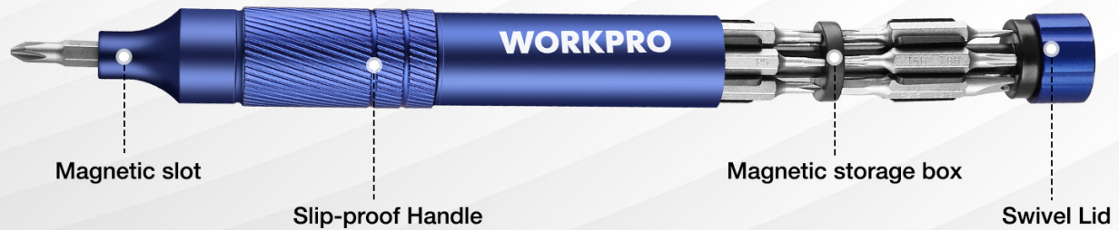
Image: Diagram illustrating the all-in-one design with magnetic slot, slip-proof handle, magnetic storage box, and swivel lid.