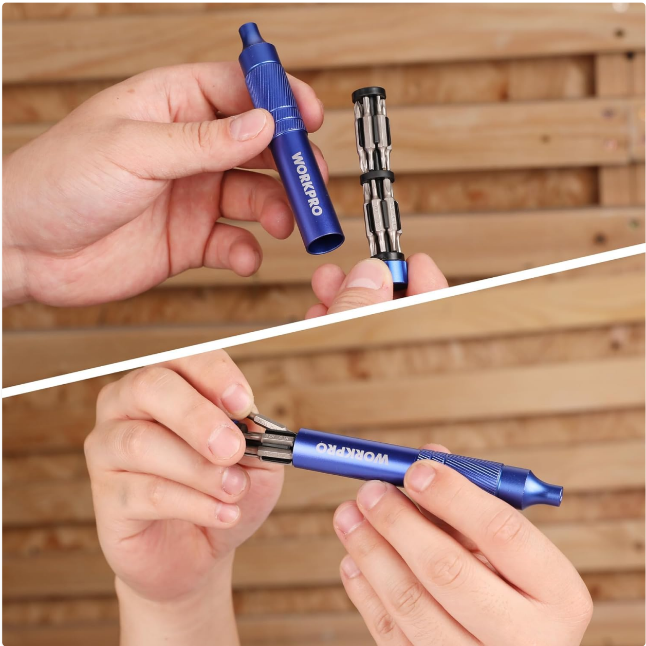
Image: Hands demonstrating how to open the screwdriver handle to access the internal bit storage and how to insert a bit into the magnetic tip.