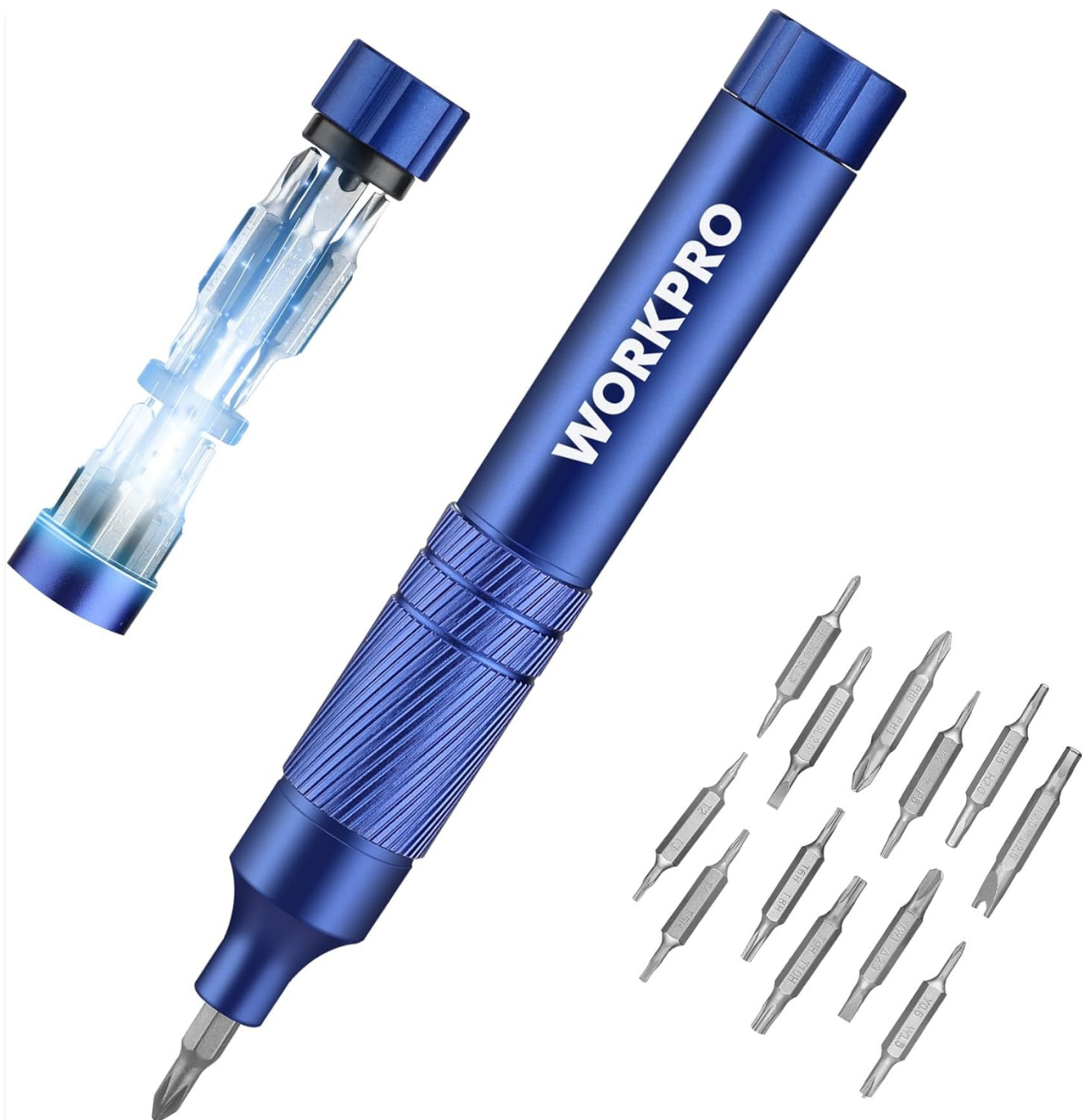
Image: The WORKPRO 24-in-1 Multi-Bit Mini Screwdriver Set, showing the blue screwdriver handle and the assortment of precision bits.