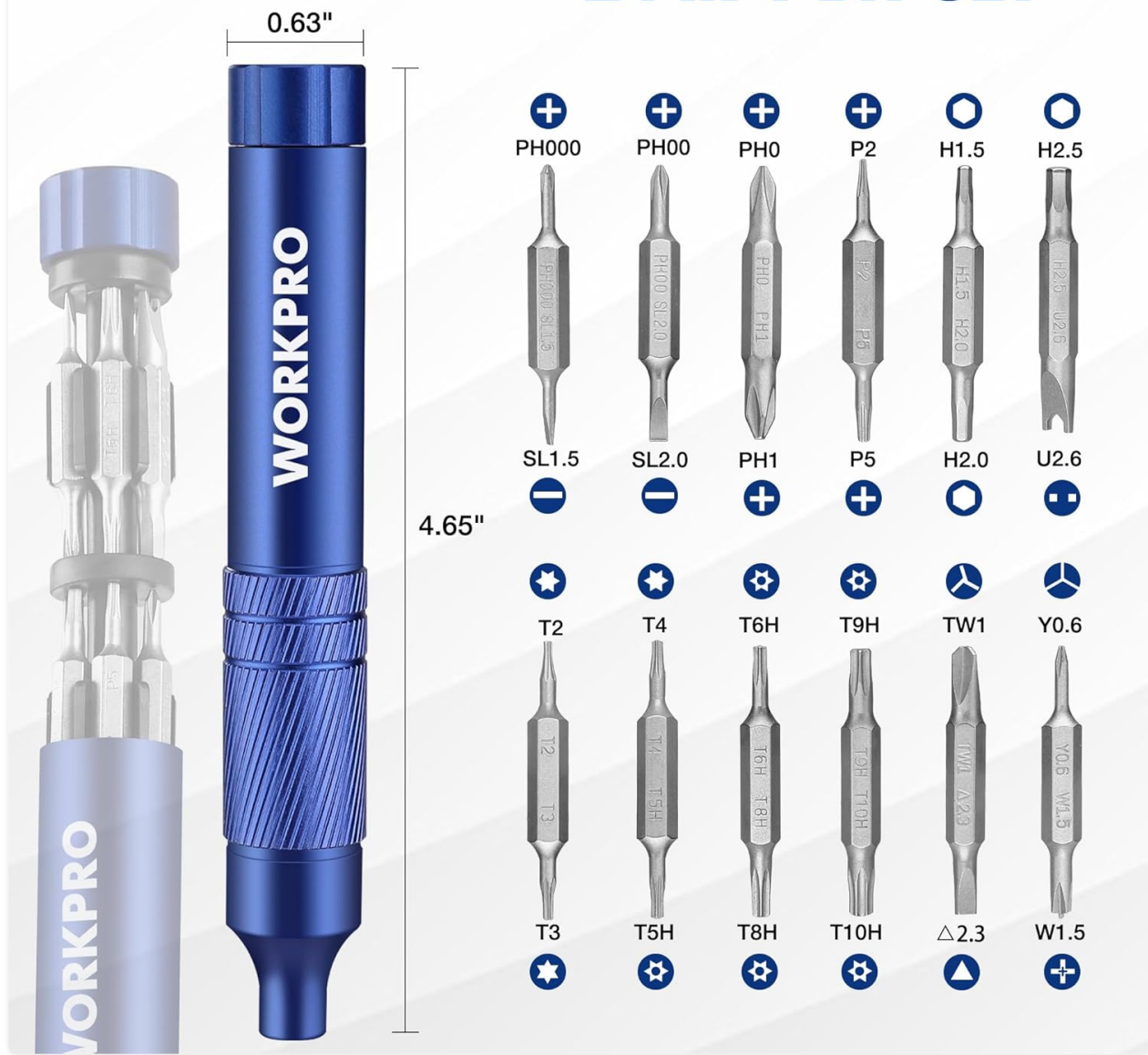
Image: A detailed view of the 24 precision bit types included in the set, along with the screwdriver handle and its dimensions.