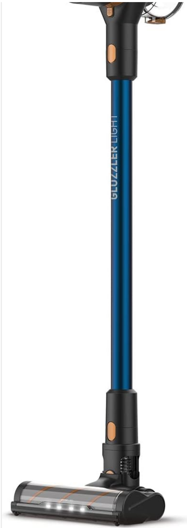
Figure 2.3: The Taurus Guzzler Light vacuum cleaner shown with its included wall mount support, demonstrating its convenient parking position.