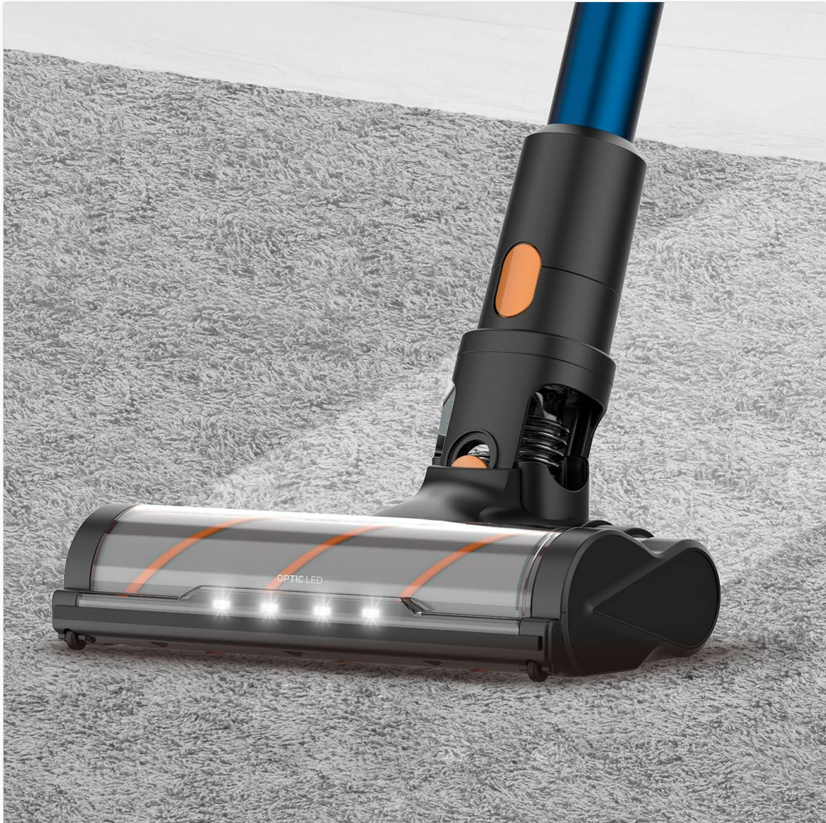
Figure 2.2: Close-up view of the motorized Turbo Brush Helix floor head, featuring Optic LED lighting for enhanced visibility during cleaning.