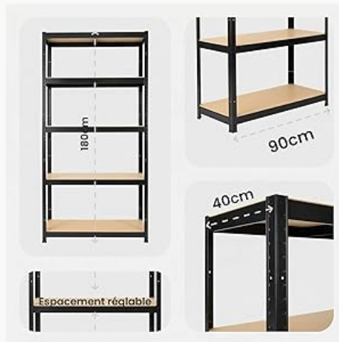
Image 5: Dimensions of the straight shelving unit (180cm H x 90cm W x 40cm D) and adjustable shelf spacing.