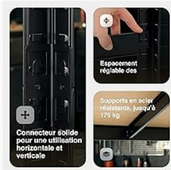
Image 2: Details of the robust connectors, adjustable shelf spacing, and steel supports, highlighting the 175 kg per shelf capacity.