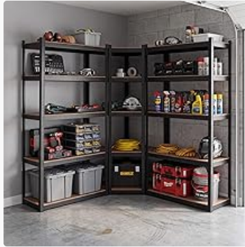
Image 3: Example of a heavy-duty corner shelving setup in a garage, demonstrating practical storage solutions.