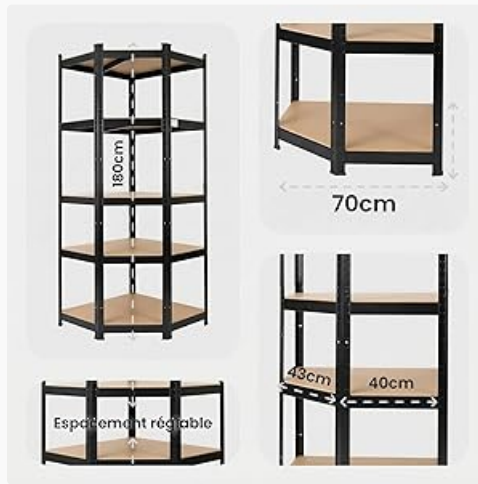
Image 6: Dimensions of the corner shelving unit (180cm H x 70cm W x 70cm D) and adjustable shelf spacing.