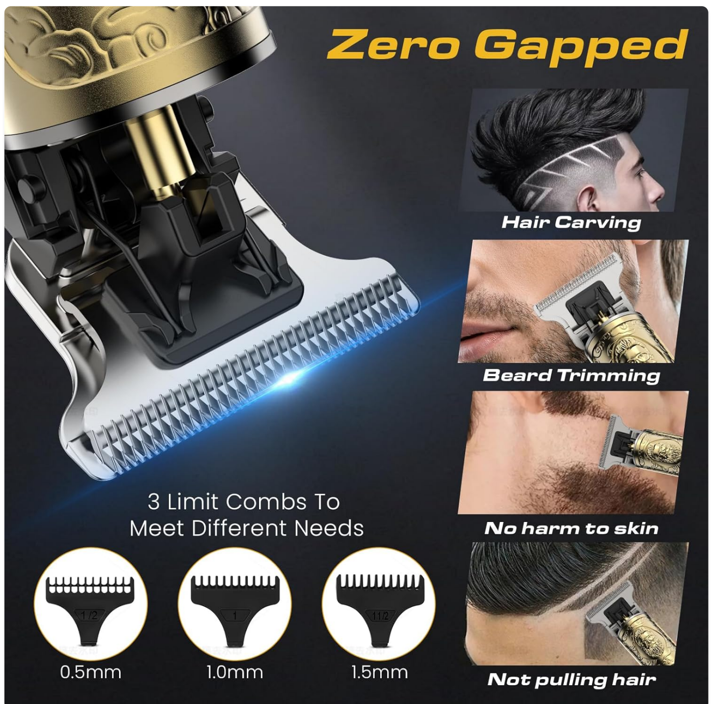
Image: Detailed view of the T-shaped blade, highlighting its zero-gapped design, alongside the three included guide combs for various