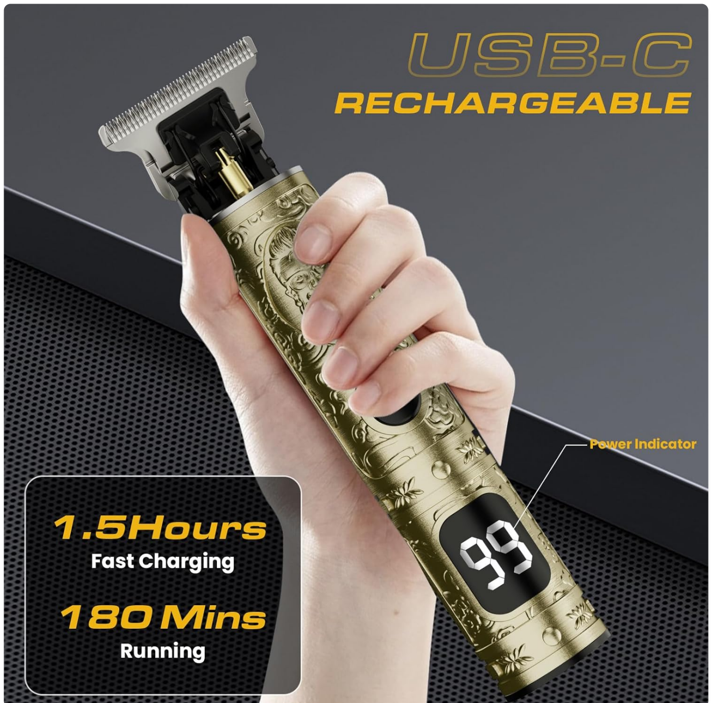
Image: The Fannas Hair Trimmer held in hand, showcasing its USB-C charging capability and the clear LCD display indicating battery life.

To achieve desired hair lengths, select one of the three guide combs (0.5mm, 1mm, 1.5mm). Align the comb with the trimmer blade and gently push until it clicks securely into place. Ensure the comb is firmly attached before use.