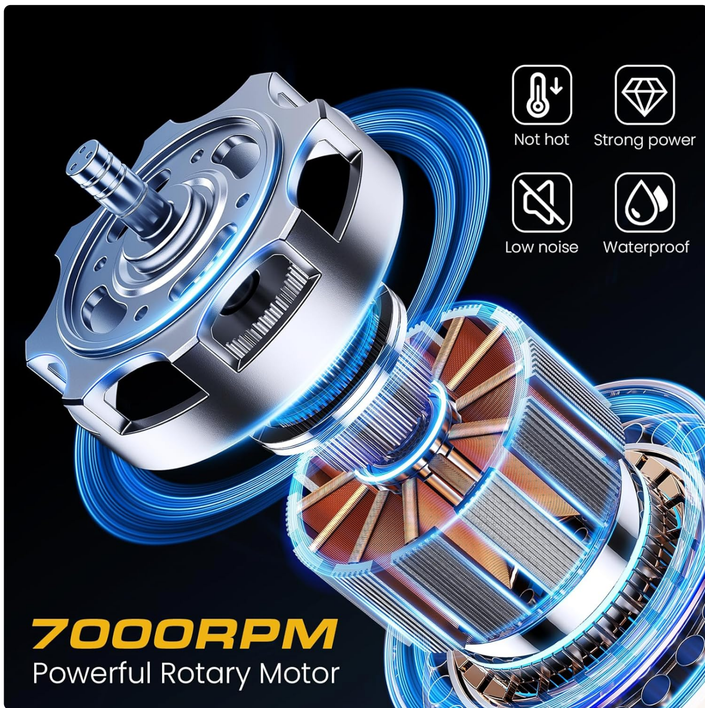
Image: An internal diagram illustrating the powerful 7000RPM rotary motor, emphasizing its efficiency and features like low noise and waterproof design (for blades).