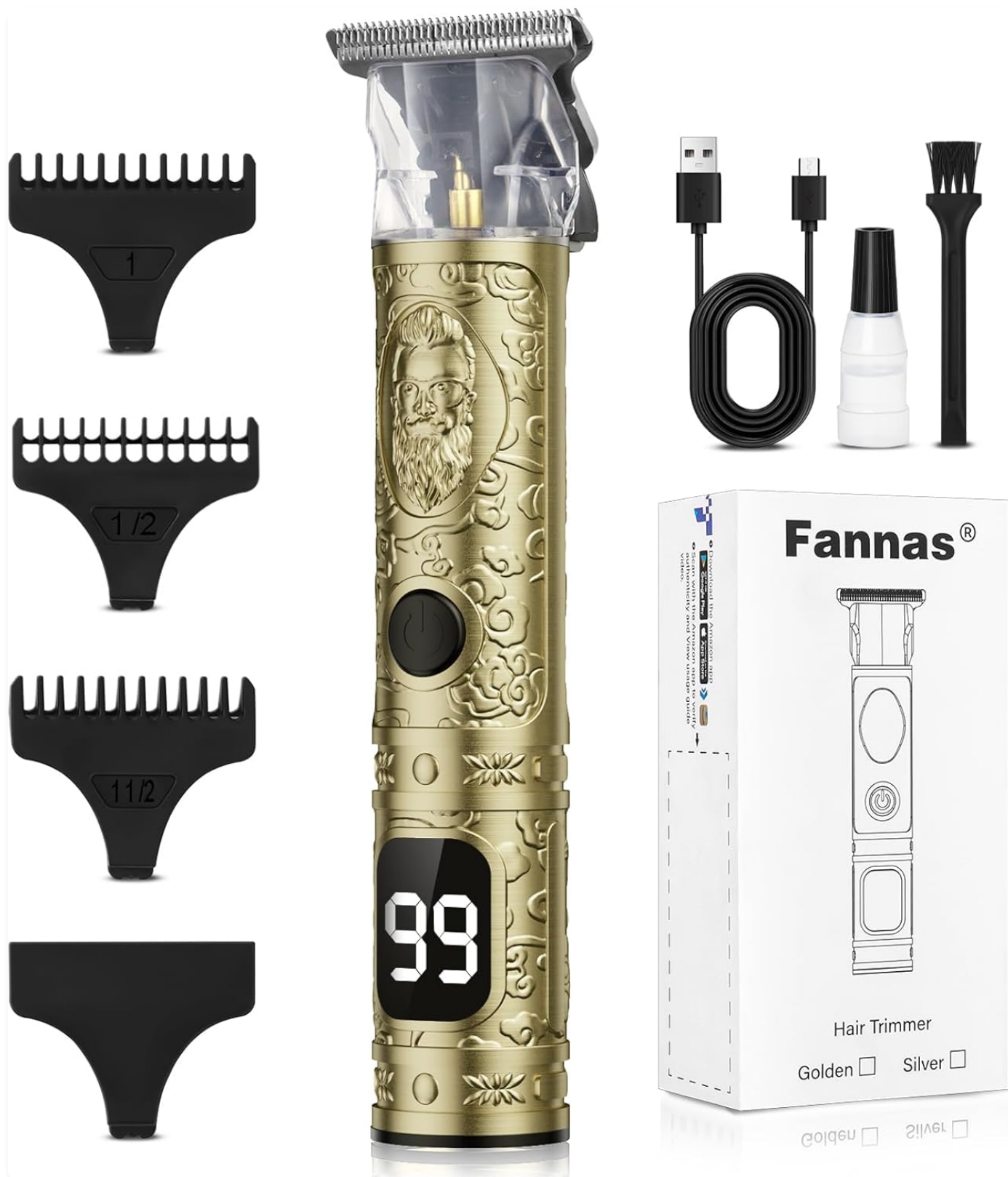
Image: Fannas Professional Hair Trimmer in gold, displayed with its charging cable, oil, cleaning brush, and three guide combs.