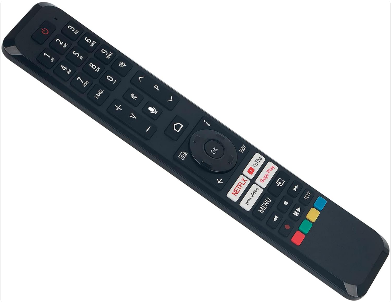
Figure 2: Angled view of the remote control.