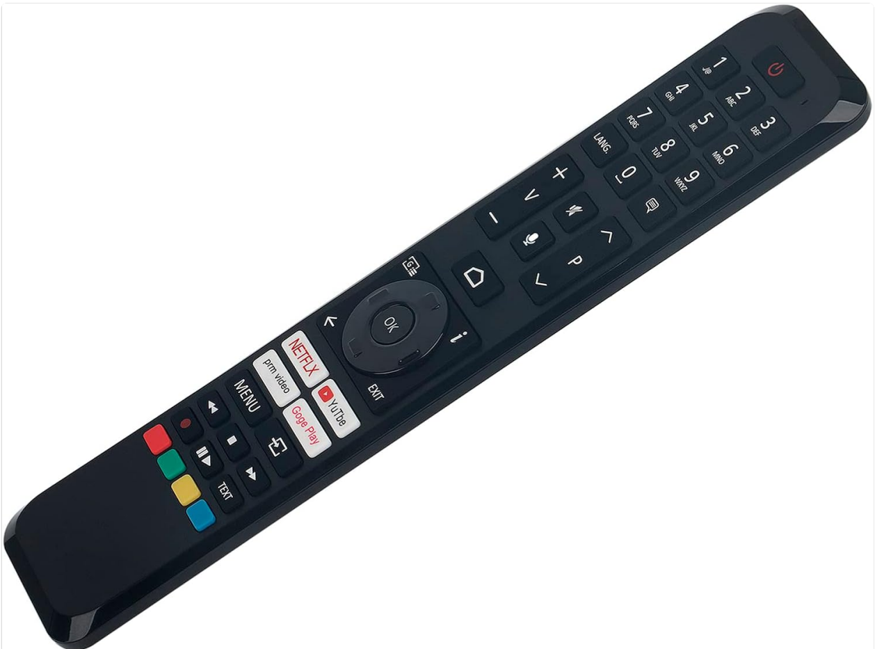
Figure 3: Side view of the remote control.