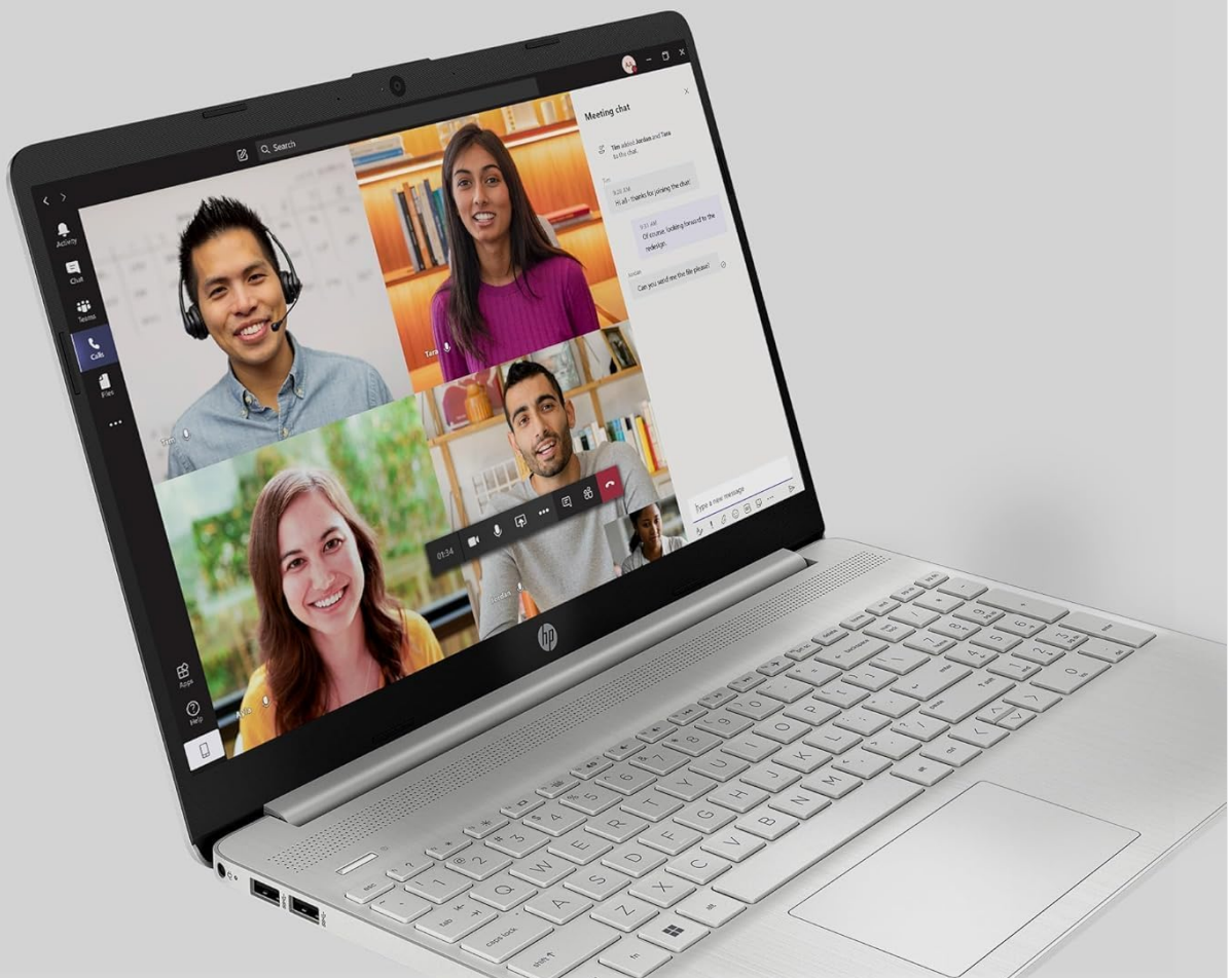
Image: The HP 15 Laptop displaying a video conference, highlighting its webcam and display features.

Long-lasting battery life lets you stay connected all day. A precision touchpad speeds up navigation and productivity.