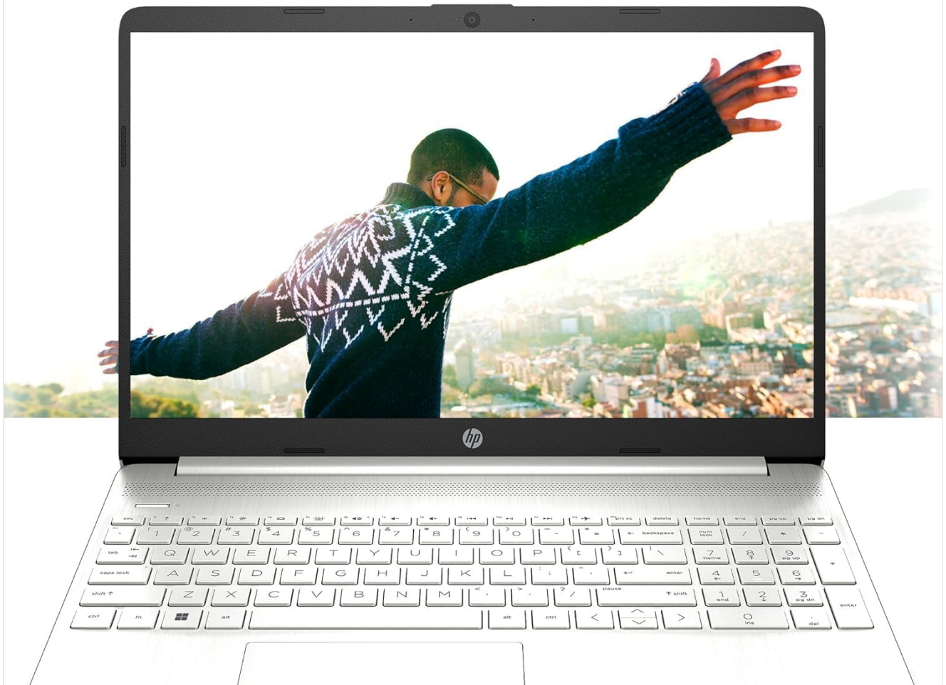
Image: The HP 15 Laptop's screen showing a video call, with callouts for the HP True Vision Camera and Edge-to-edge Full HD display.

See your photos, videos and projects on a 15.6" micro-edge bezel display in a portable laptop designed for travel.