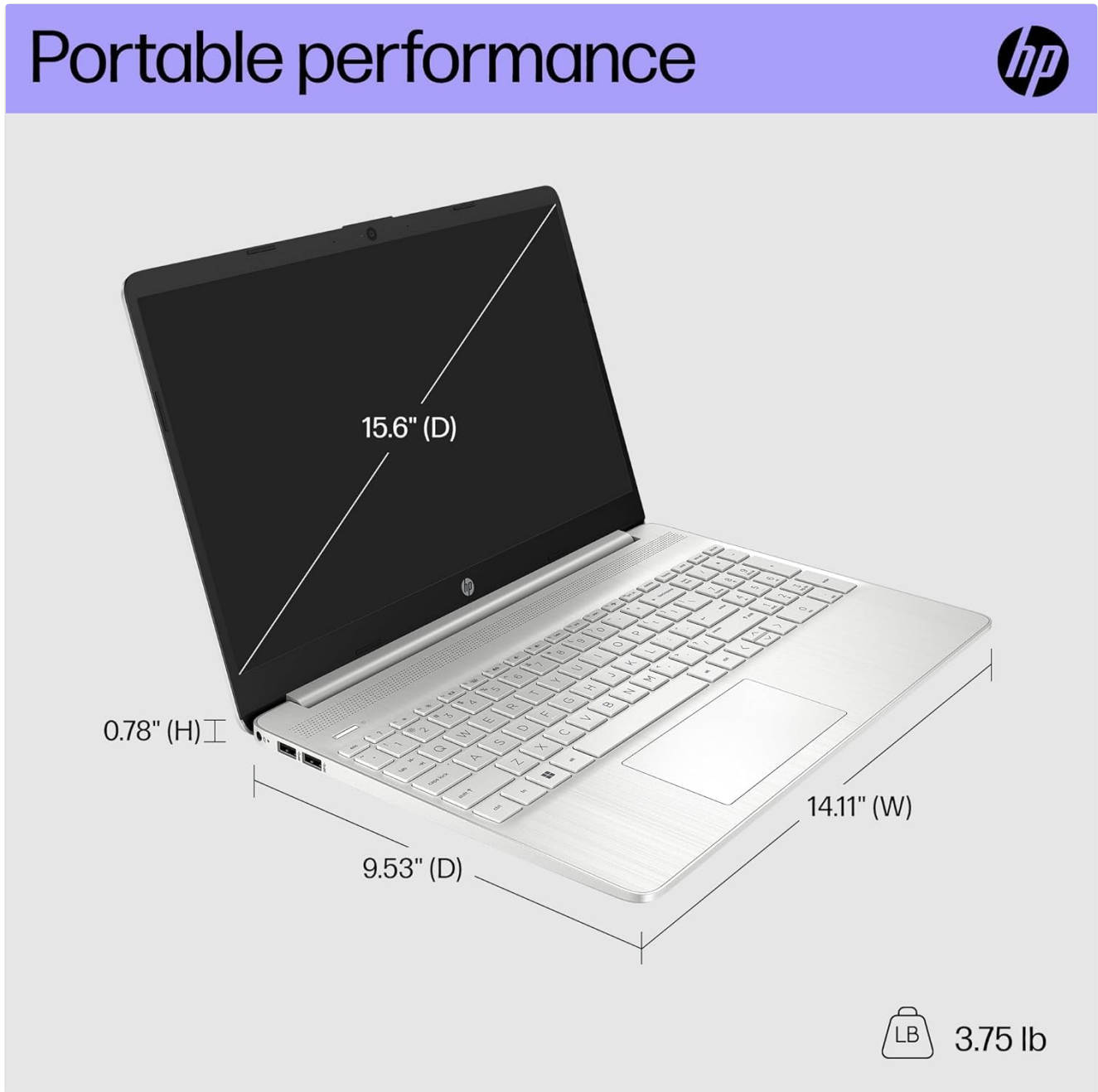
Image: The HP 15 Laptop with its dimensions labeled: 15.6" (D), 0.78" (H), 14.11" (W), and weight 3.75 lb.