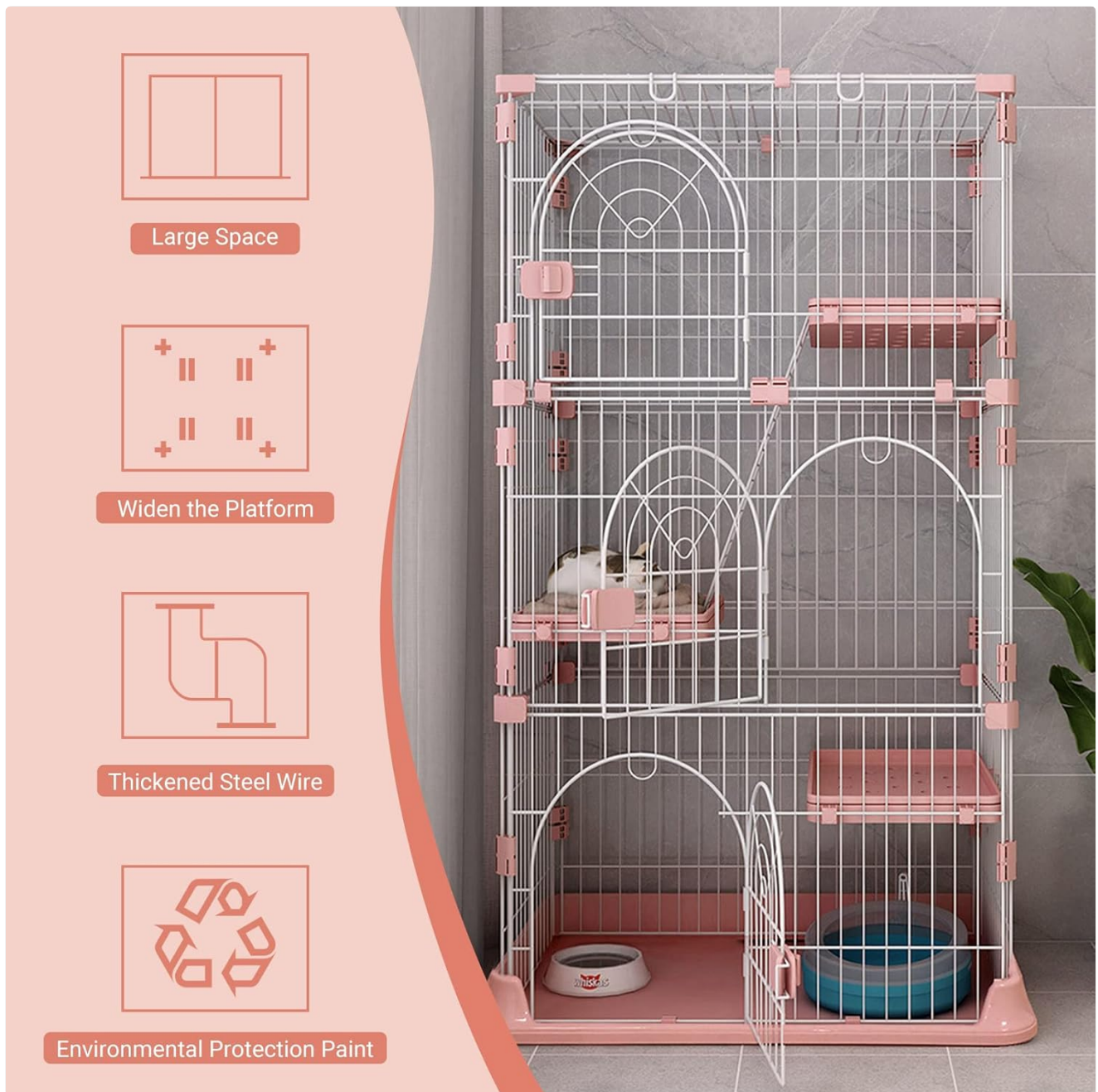
Image: Visual representation of the cage's features, including large space, widened platforms, thickened steel wire construction, and environmentally friendly paint.