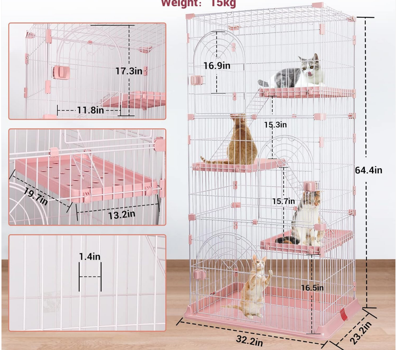
Image: Detailed dimensions of the pet cage, including overall height, width, depth, and individual platform sizes.