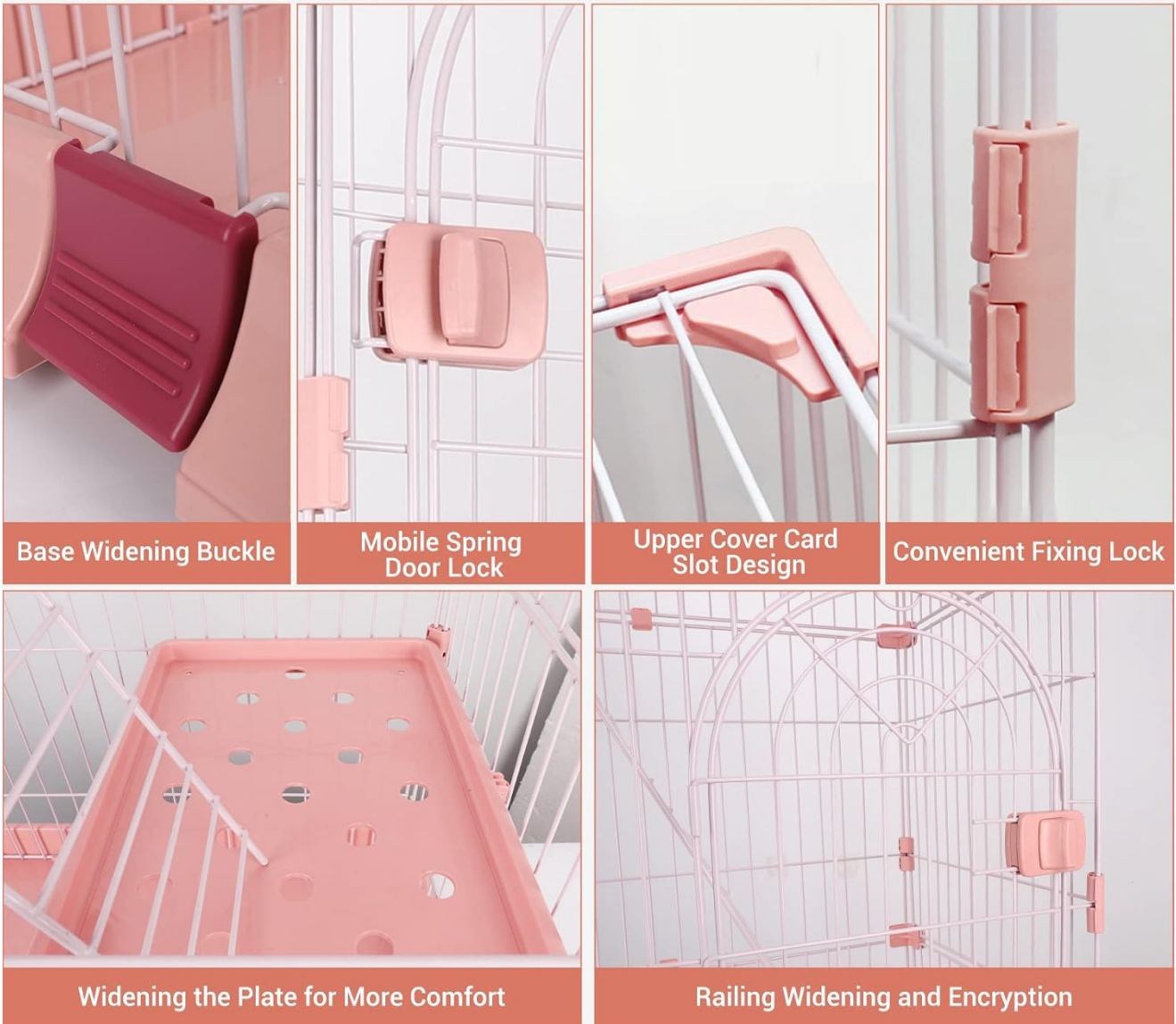
Image: Detailed views of the cage's locking mechanisms, buckles, and platform design, aiding in correct assembly and understanding of features.