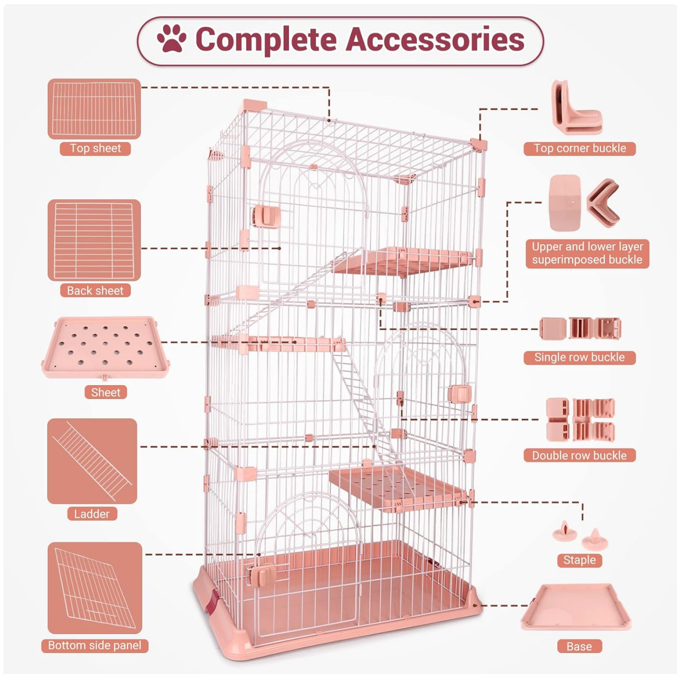
Image: Detailed diagram of all parts included in the package, essential for checking contents and assembly.