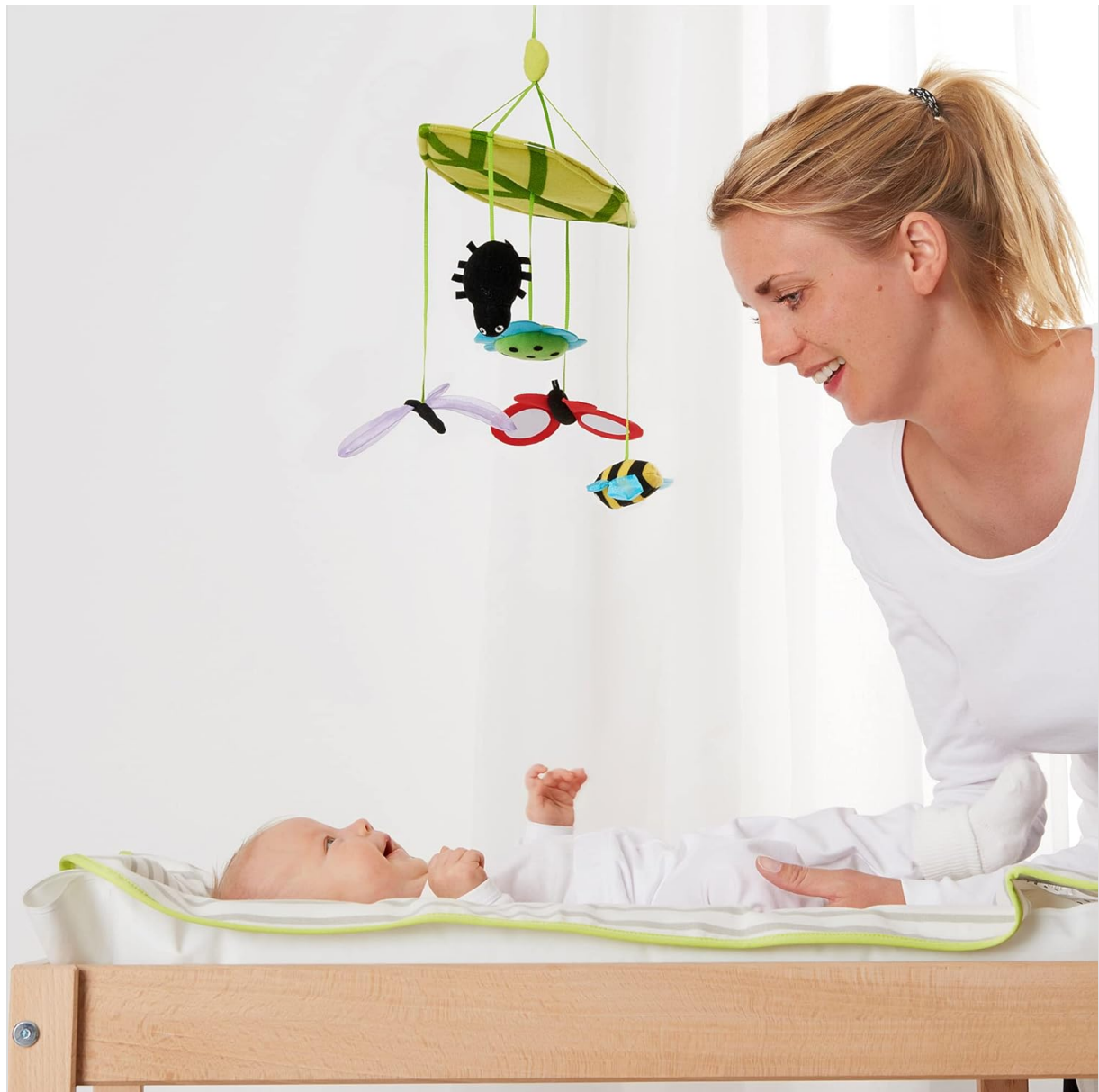
Figure 3: A parent safely changing a baby on the SNIGLAR table, maintaining contact.