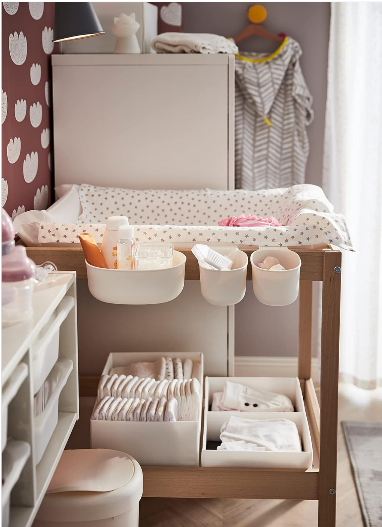
Figure 4: The lower shelf provides practical storage for baby essentials, keeping them within reach.