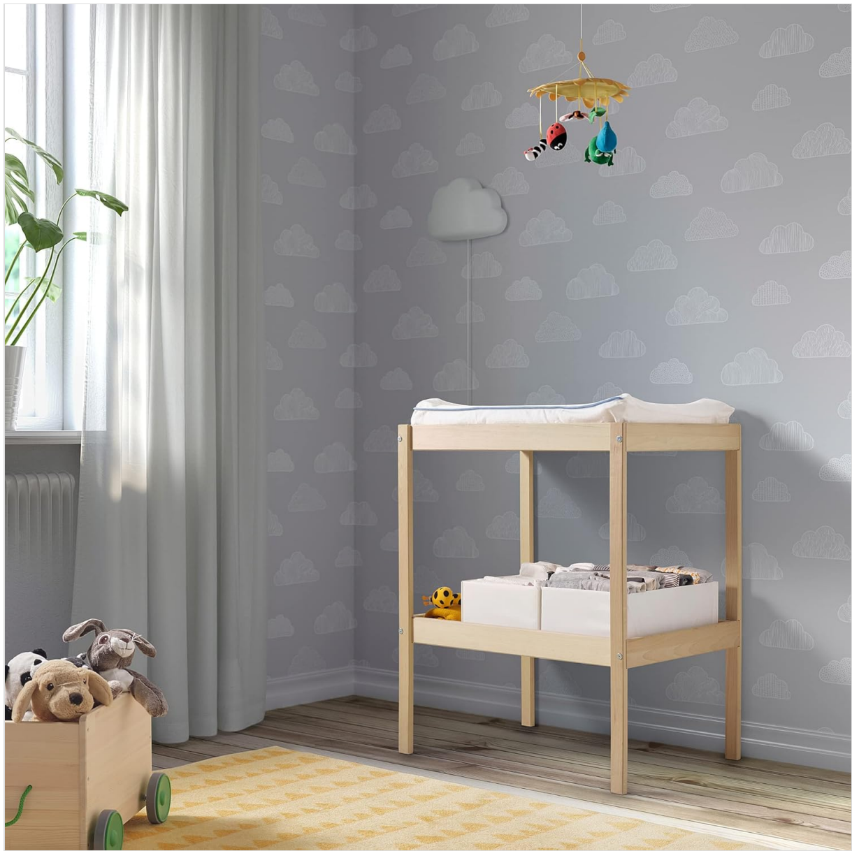
Figure 1: The IKEA SNIGLAR Changing Table in a typical nursery setting.