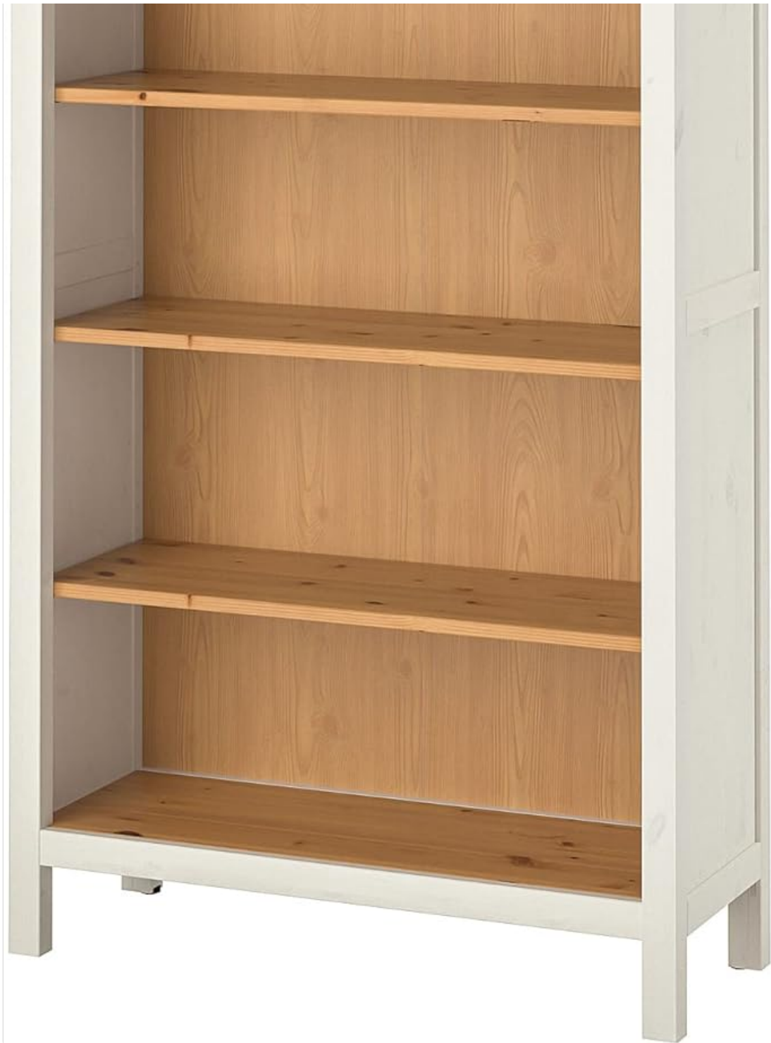
Image: Front view of the IKEA HEMNES Bookcase, highlighting its five adjustable shelves and sturdy construction.