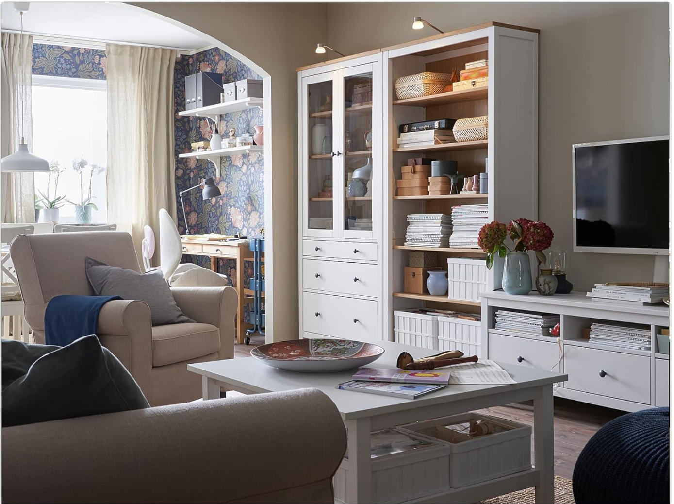
Image: The HEMNES Bookcase complementing other furniture pieces in a room, illustrating its adaptability within different interior designs.