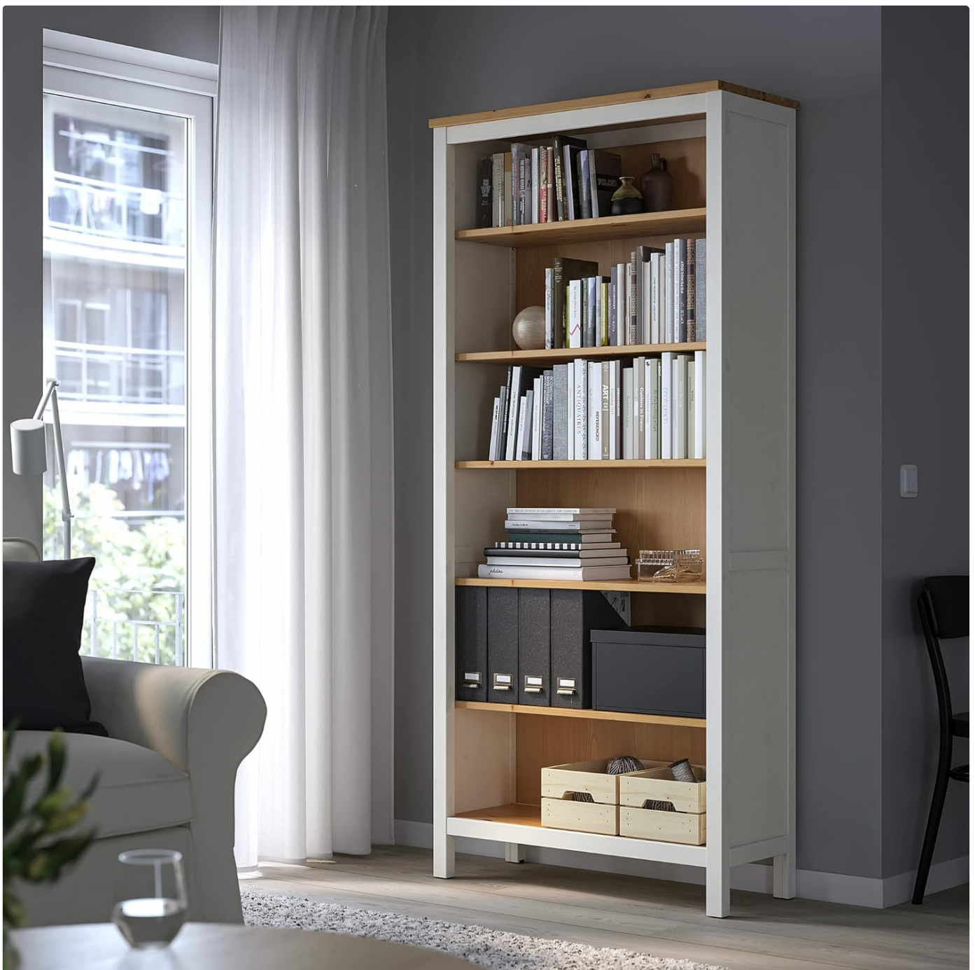
Image: The HEMNES Bookcase integrated into a living room, demonstrating its capacity for books and various decorative objects.