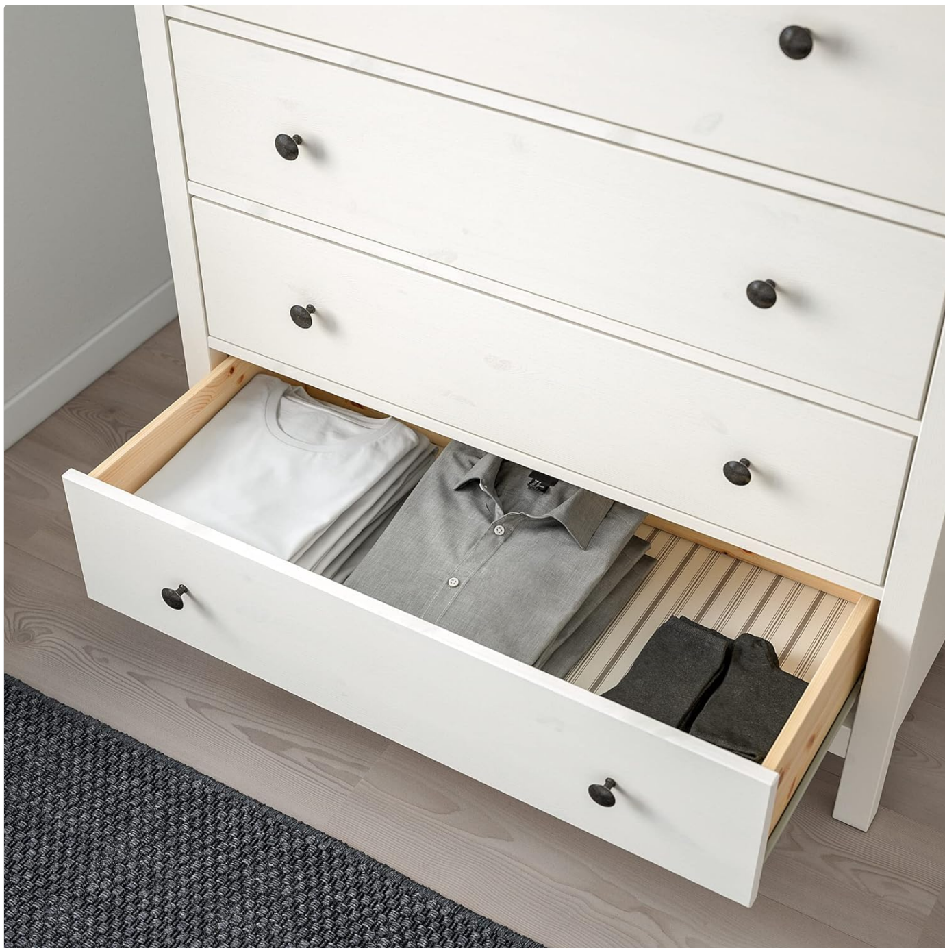
Figure 4: An open drawer of the HEMNES chest, demonstrating its storage capacity with neatly folded clothing items.