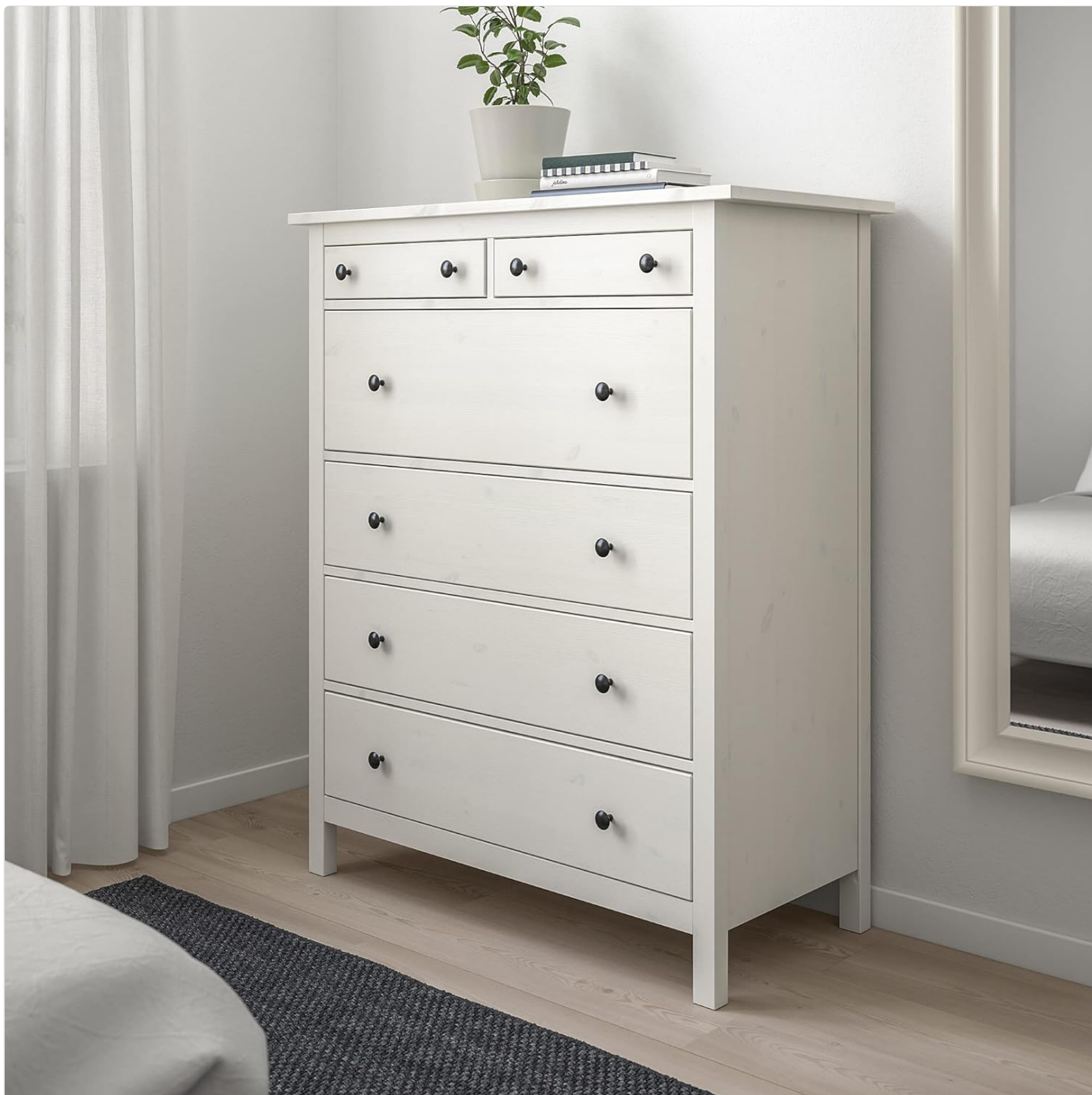
Figure 2: The HEMNES chest positioned in a room, demonstrating its versatile design and how it complements interior decor.