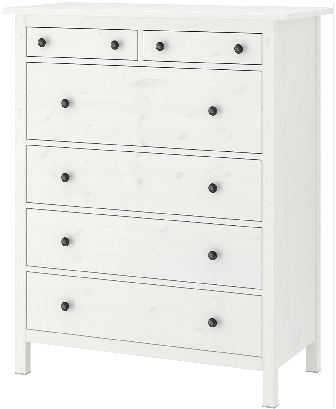
Figure 1: The IKEA HEMNES Chest of 6 Drawers, featuring a white stain finish and six spacious drawers with dark handles.