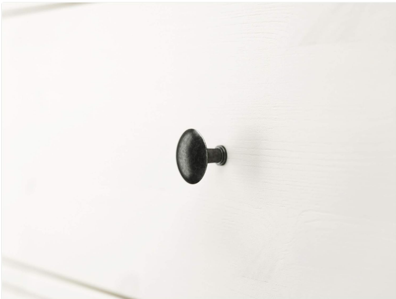
Figure 5: A close-up view of one of the dark metal handles, highlighting the design detail and ease of grip for drawer operation.