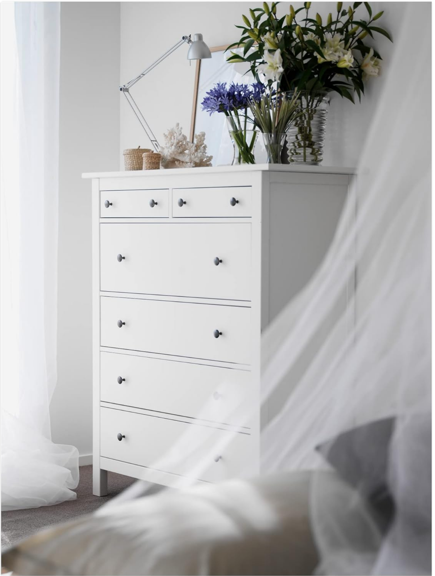
Figure 6: The HEMNES chest integrated into a bedroom environment, showcasing its aesthetic appeal and functional design.